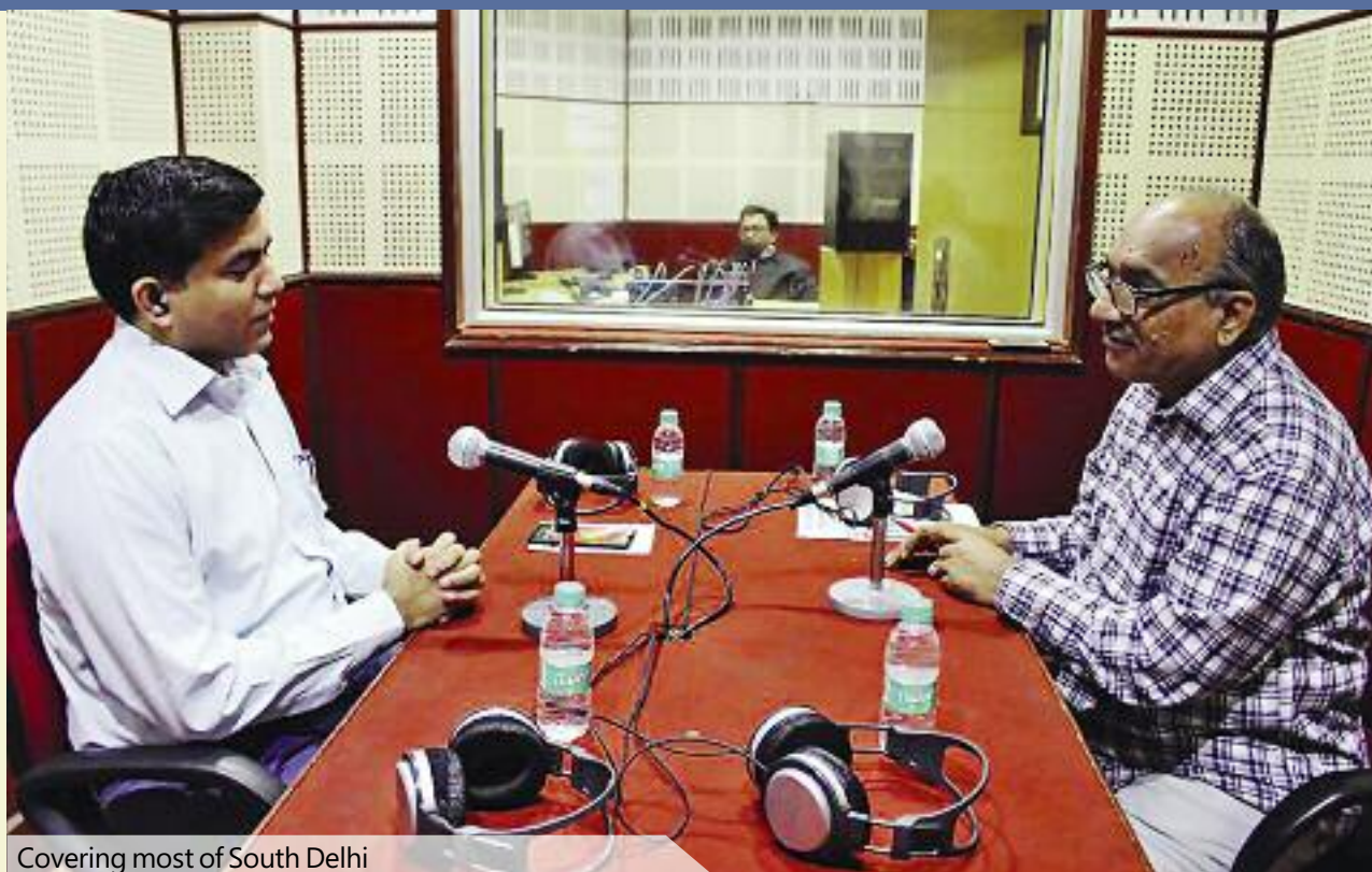
Covering most of South Delhi