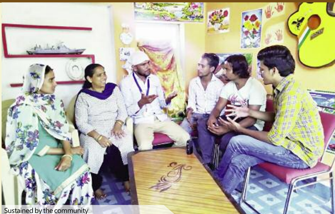
Sustained by the community