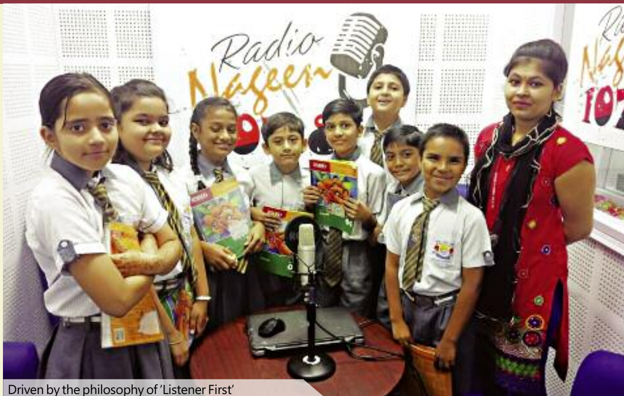
Driven by the philosophy of 'Listener First'