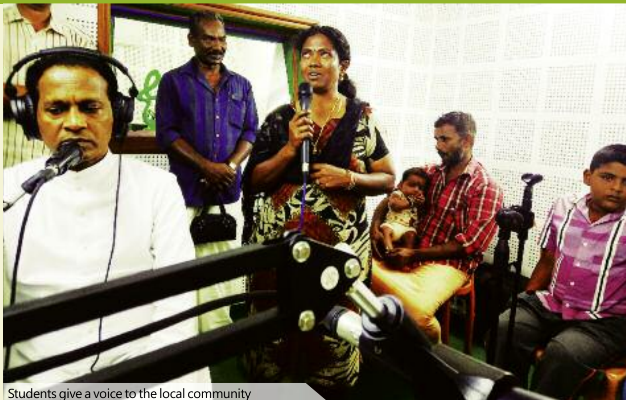
Students give a voice to the local community