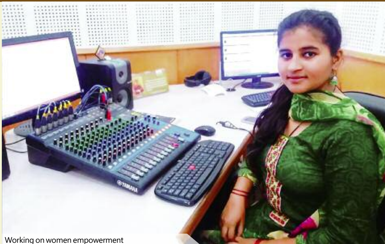
Working on women empowerment