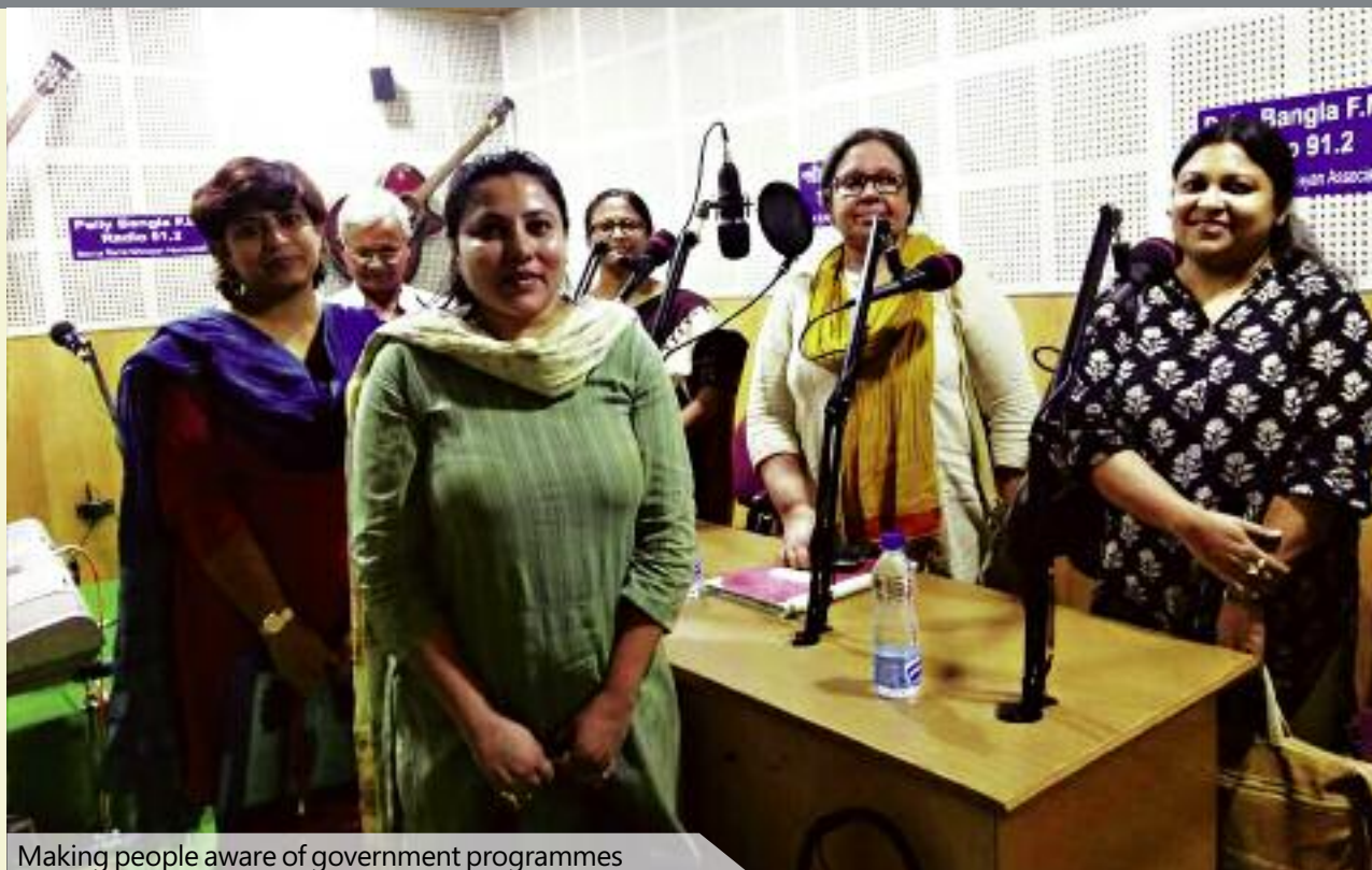
Making people aware of government programmes