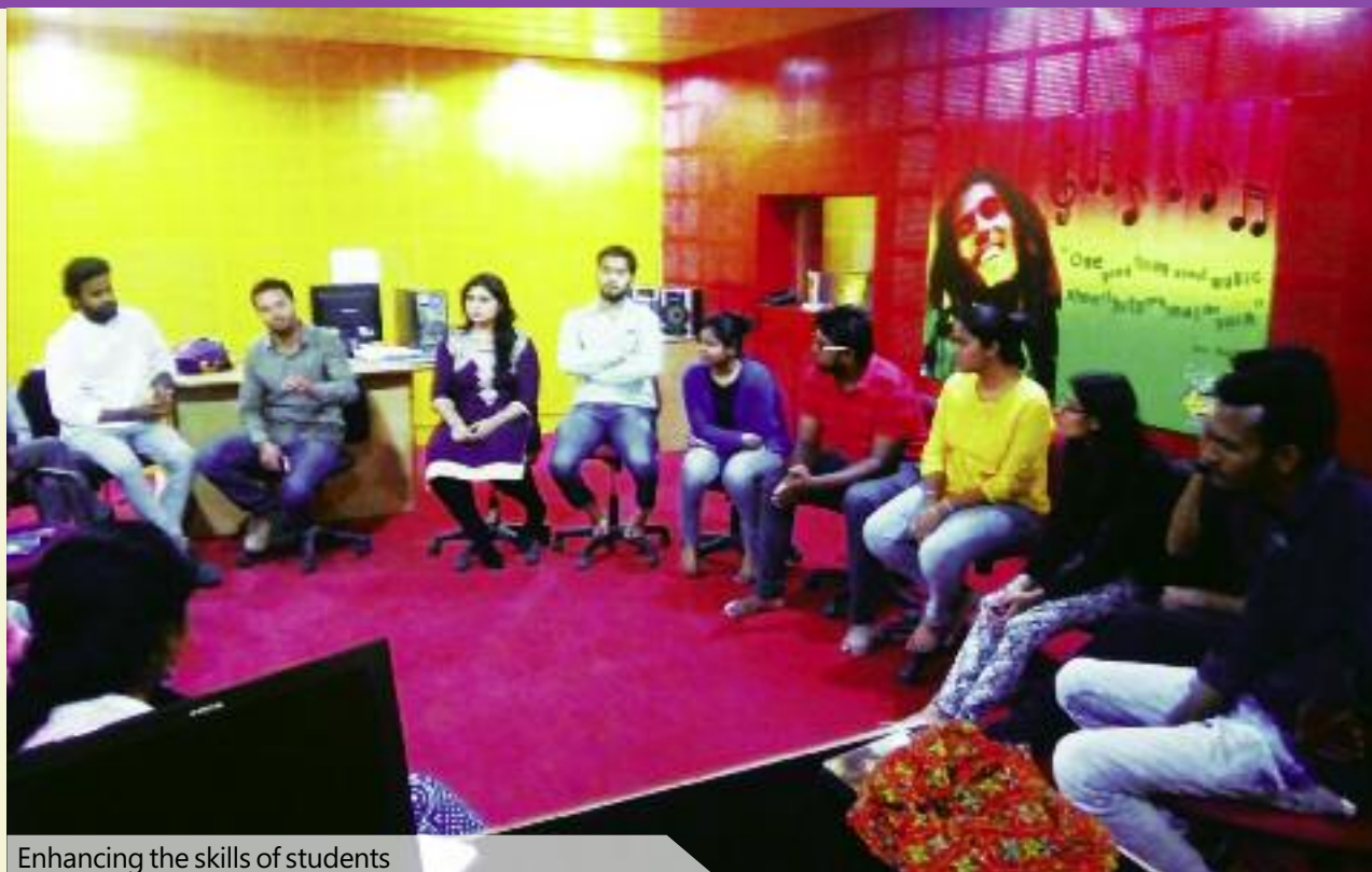
Enhancing the skills of students