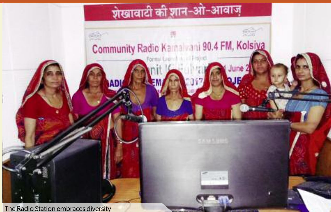
The Radio Station embraces diversity