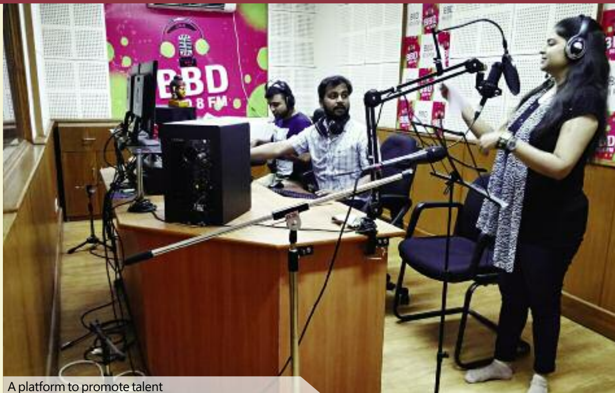
A platform to promote talent