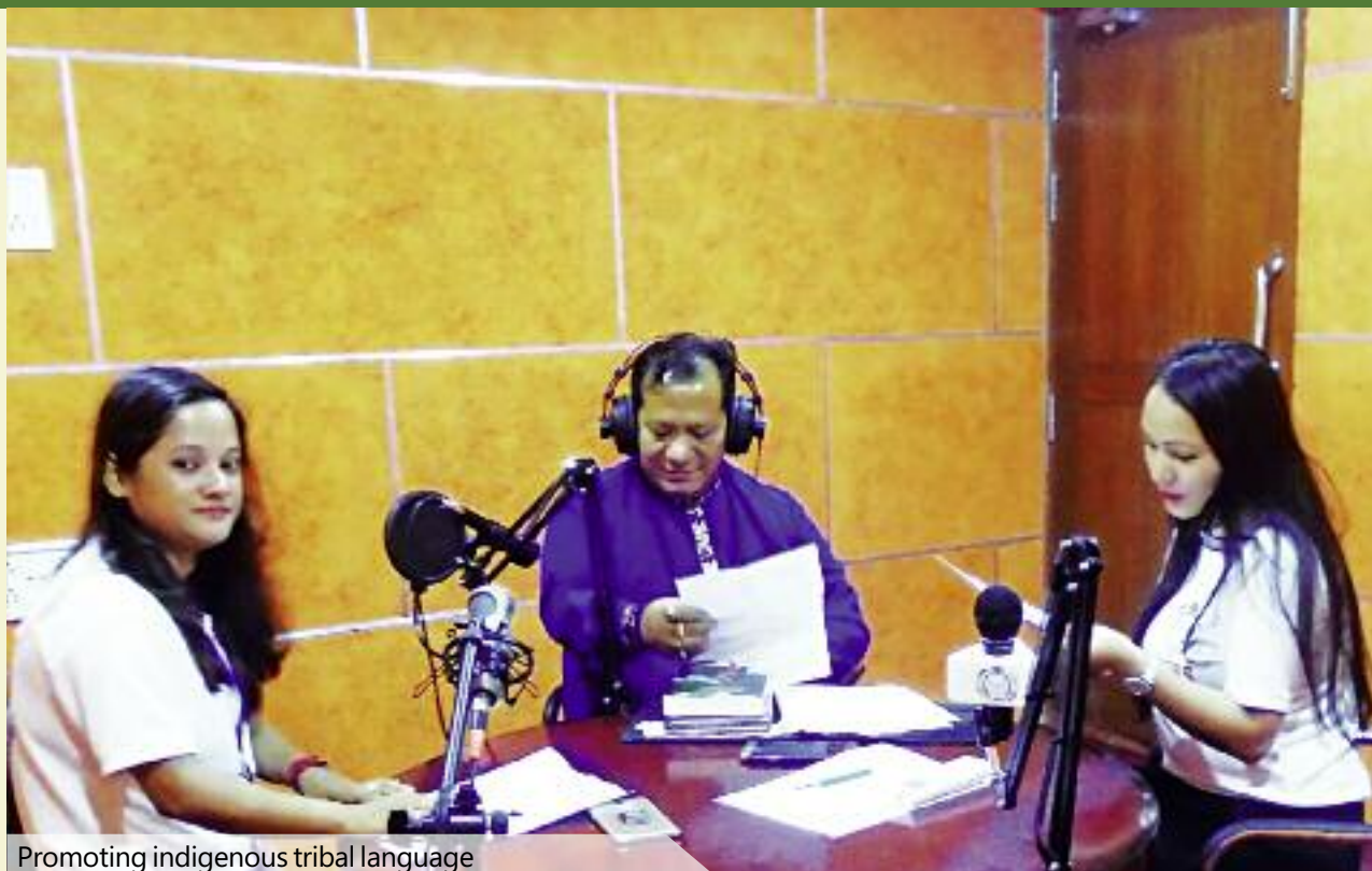
Promoting indigenous tribal language