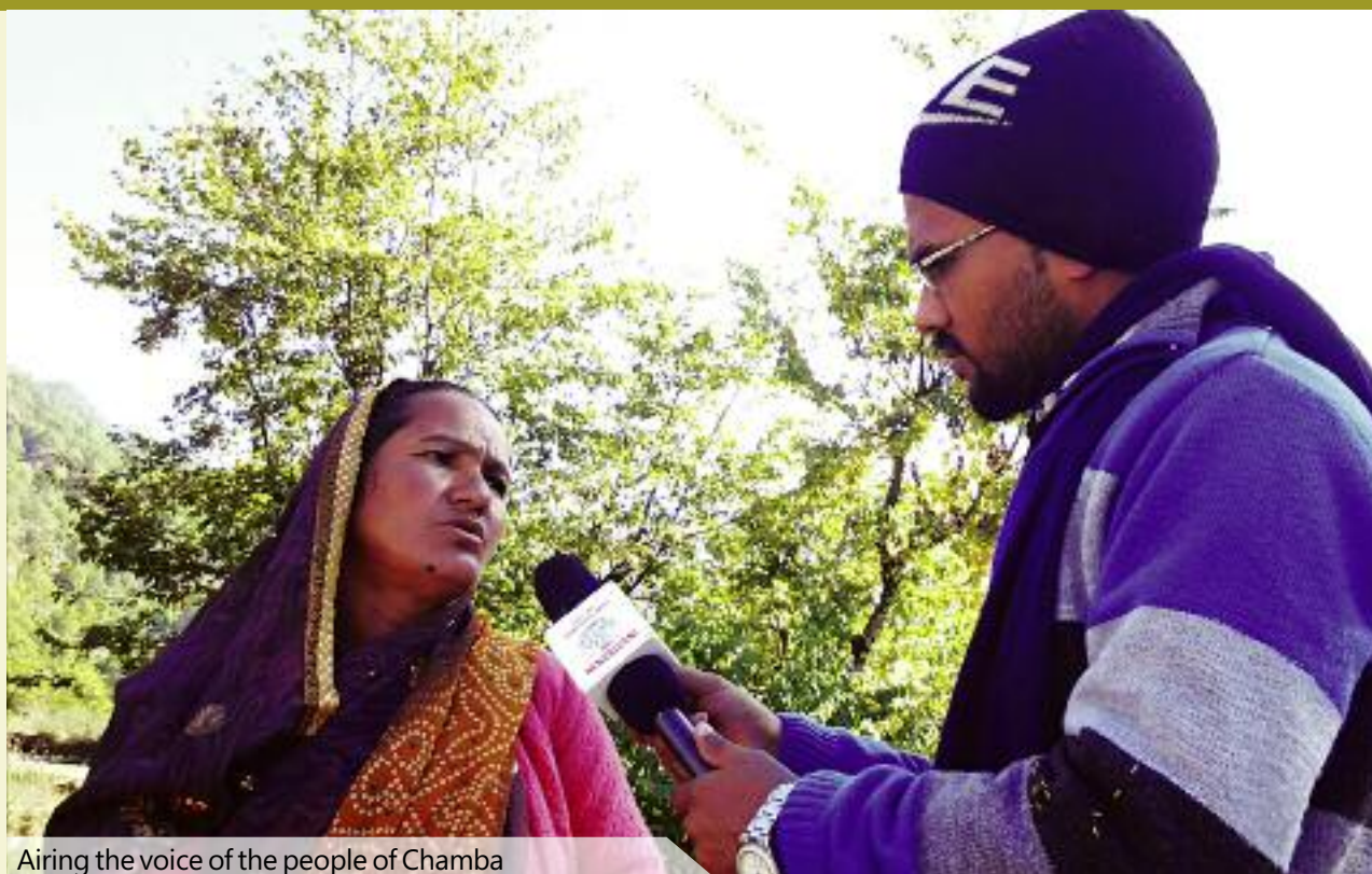
Airing the voice of the people of Chamba