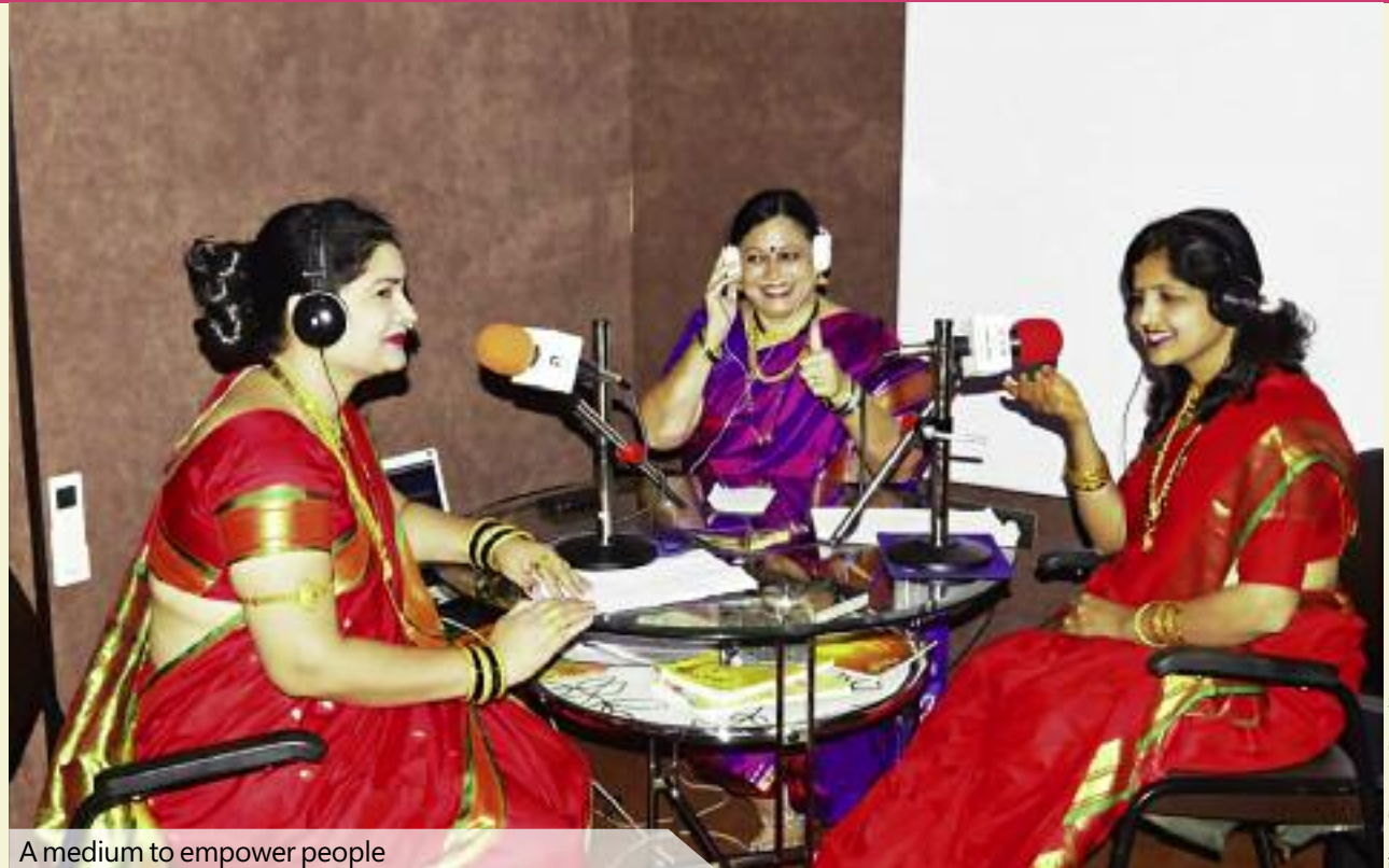
A medium to empower people

Broadcast Hours 16 hours Languages Hindi and Marathi