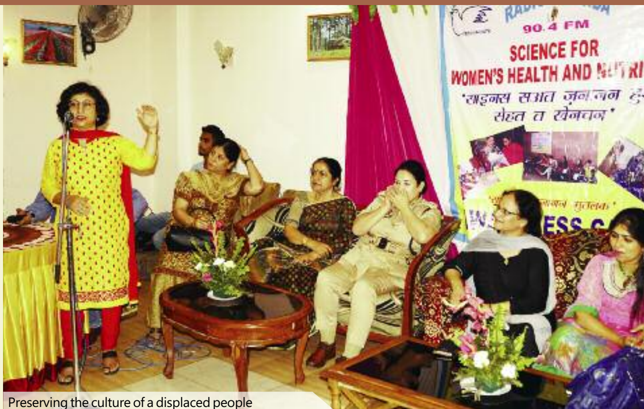
Preserving the culture of a displaced people