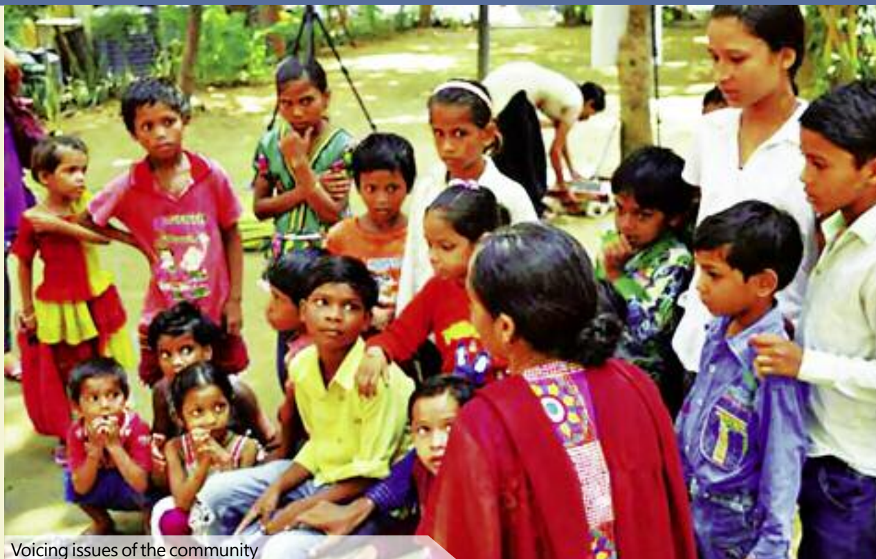
Voicing issues of the community