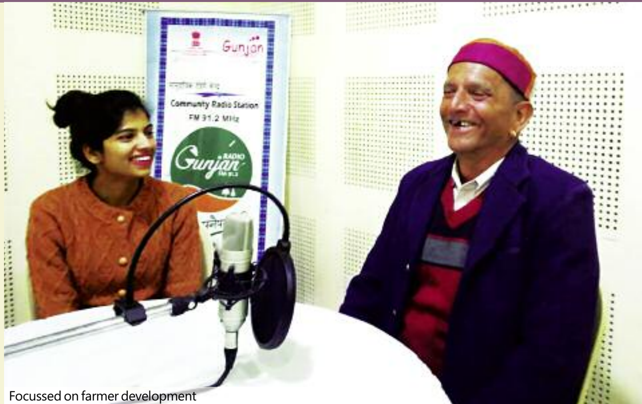
Focused on farmer development