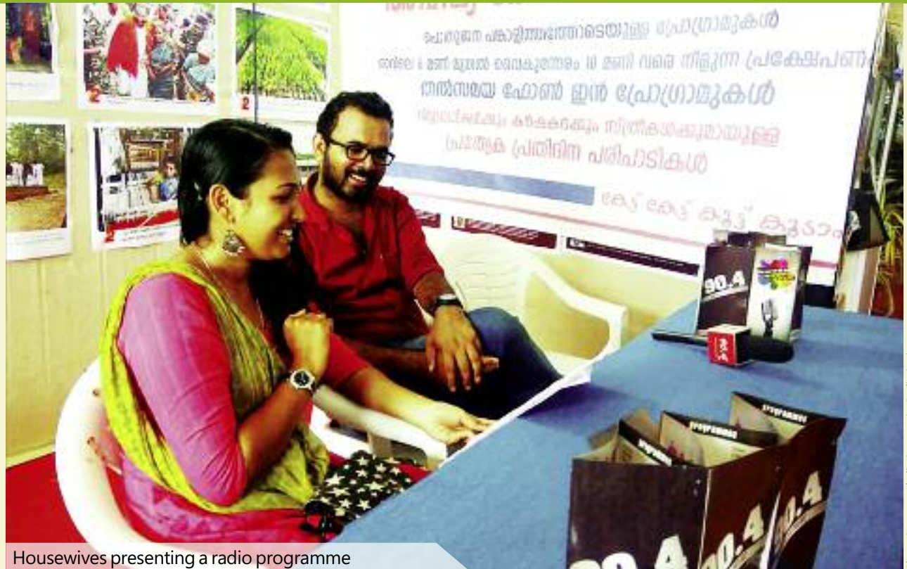
Housewives presenting a radio programme

Broadcast Hours | Languages 16 hours | Malayalam