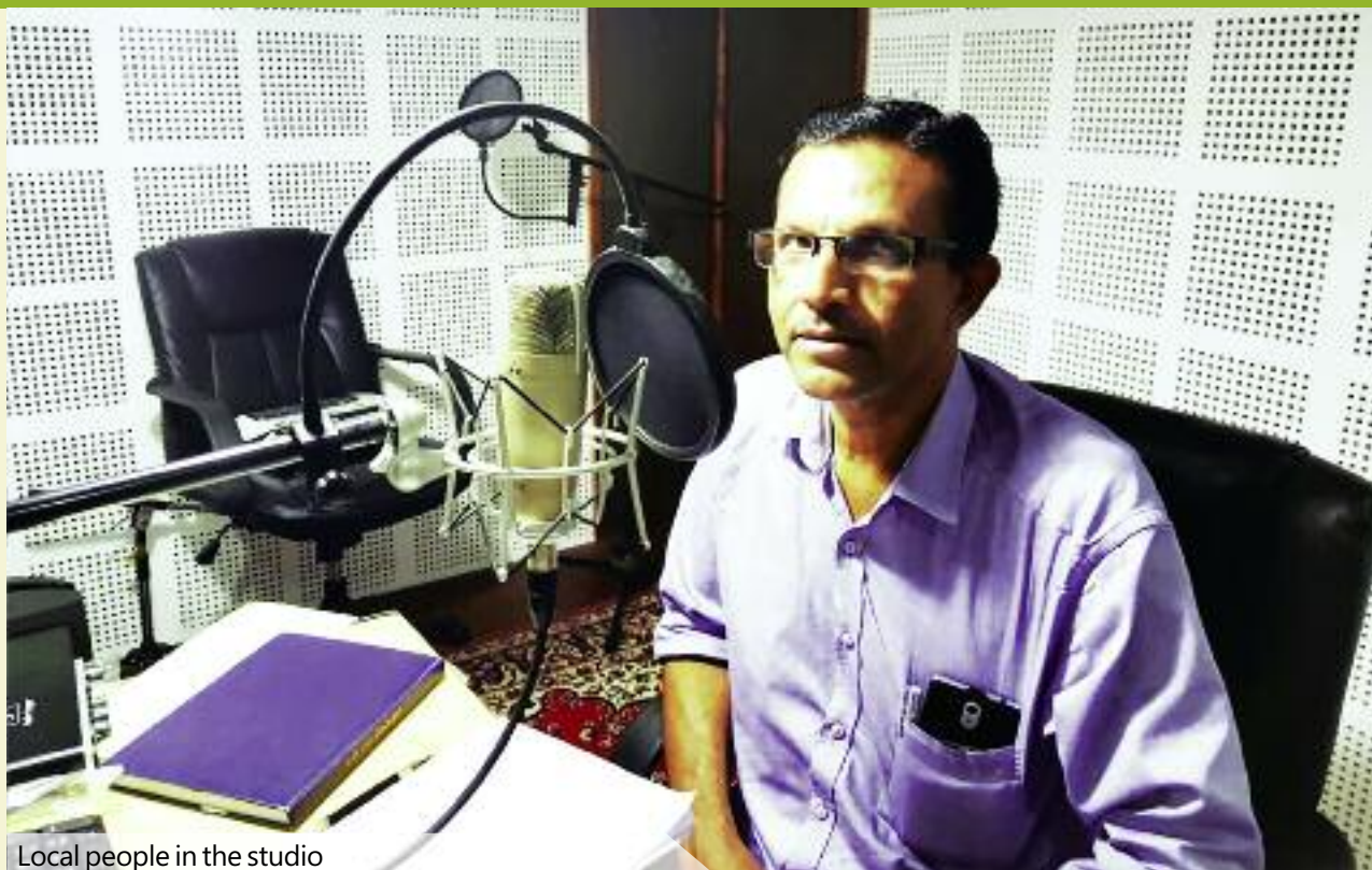
Local people in the studio