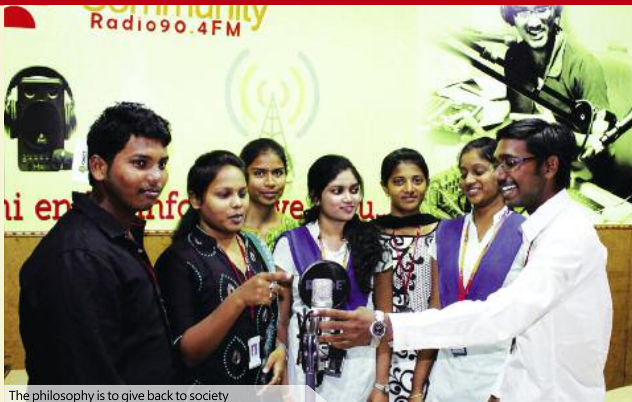
The philosophy is to give back to society