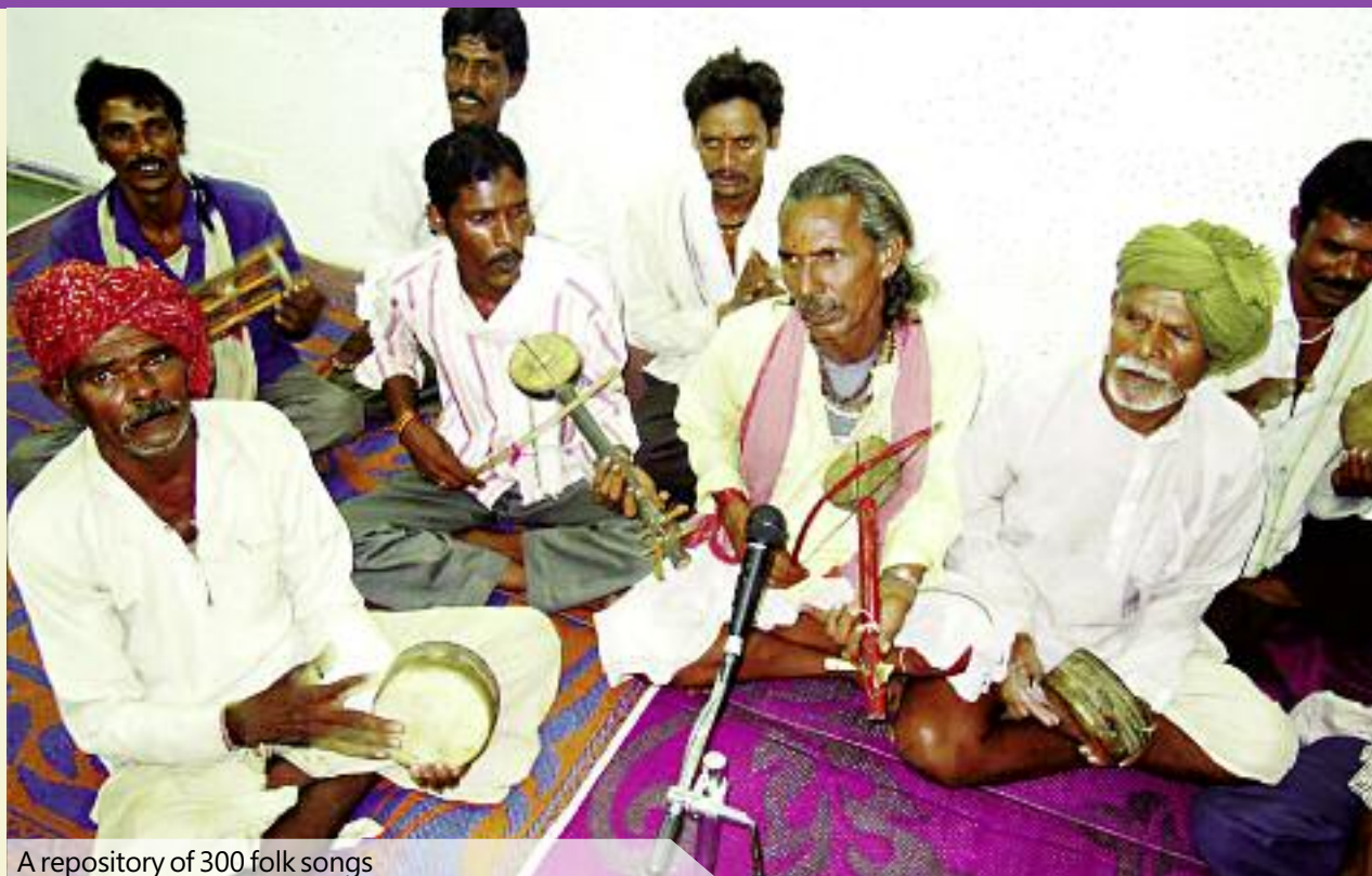
A repository of 300 folk songs