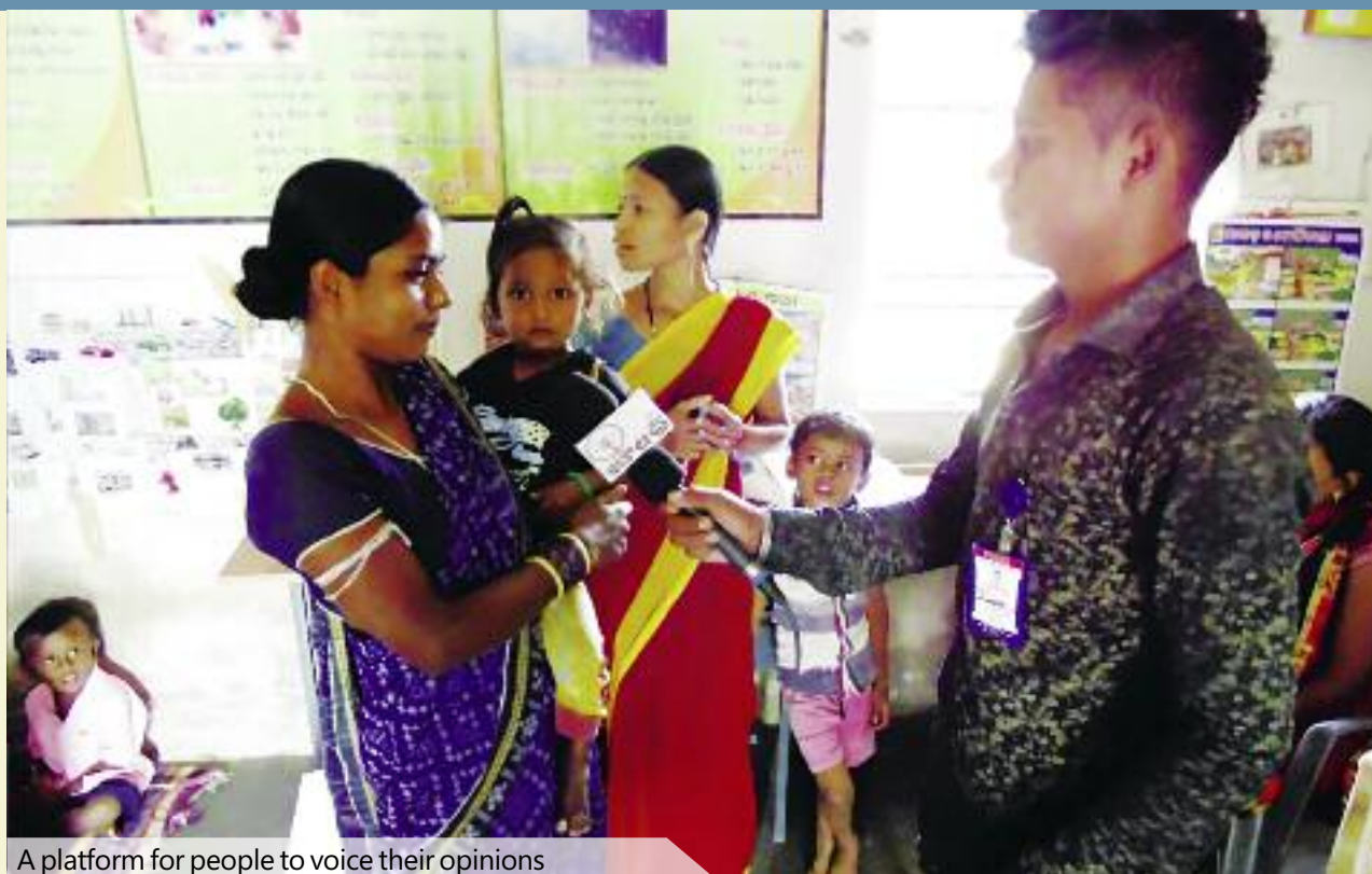
A platform for people to voice their opinions