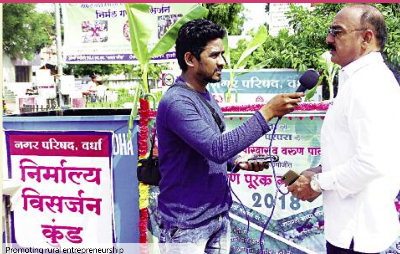
Promoting rural entrepreneurship