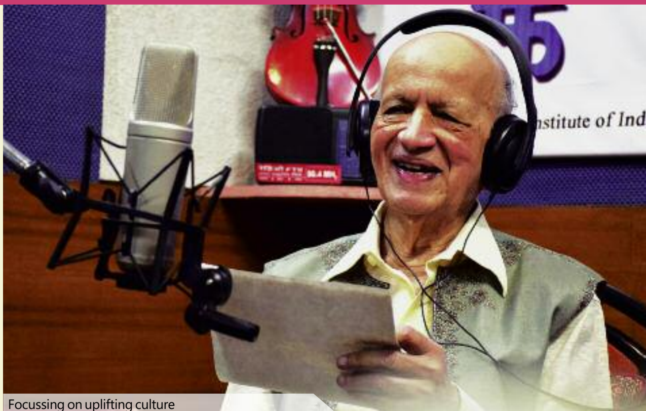
Focussing on uplifting culture