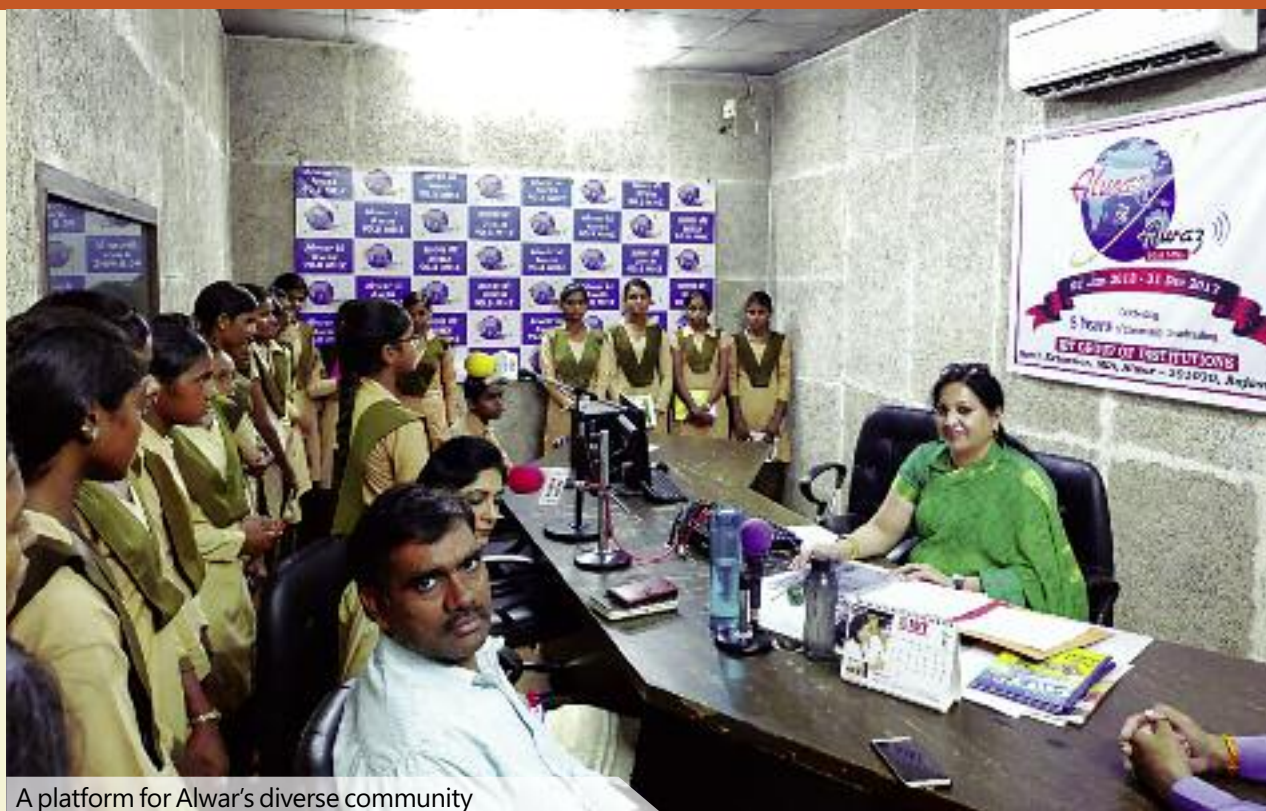
A platform for Alwar's diverse community