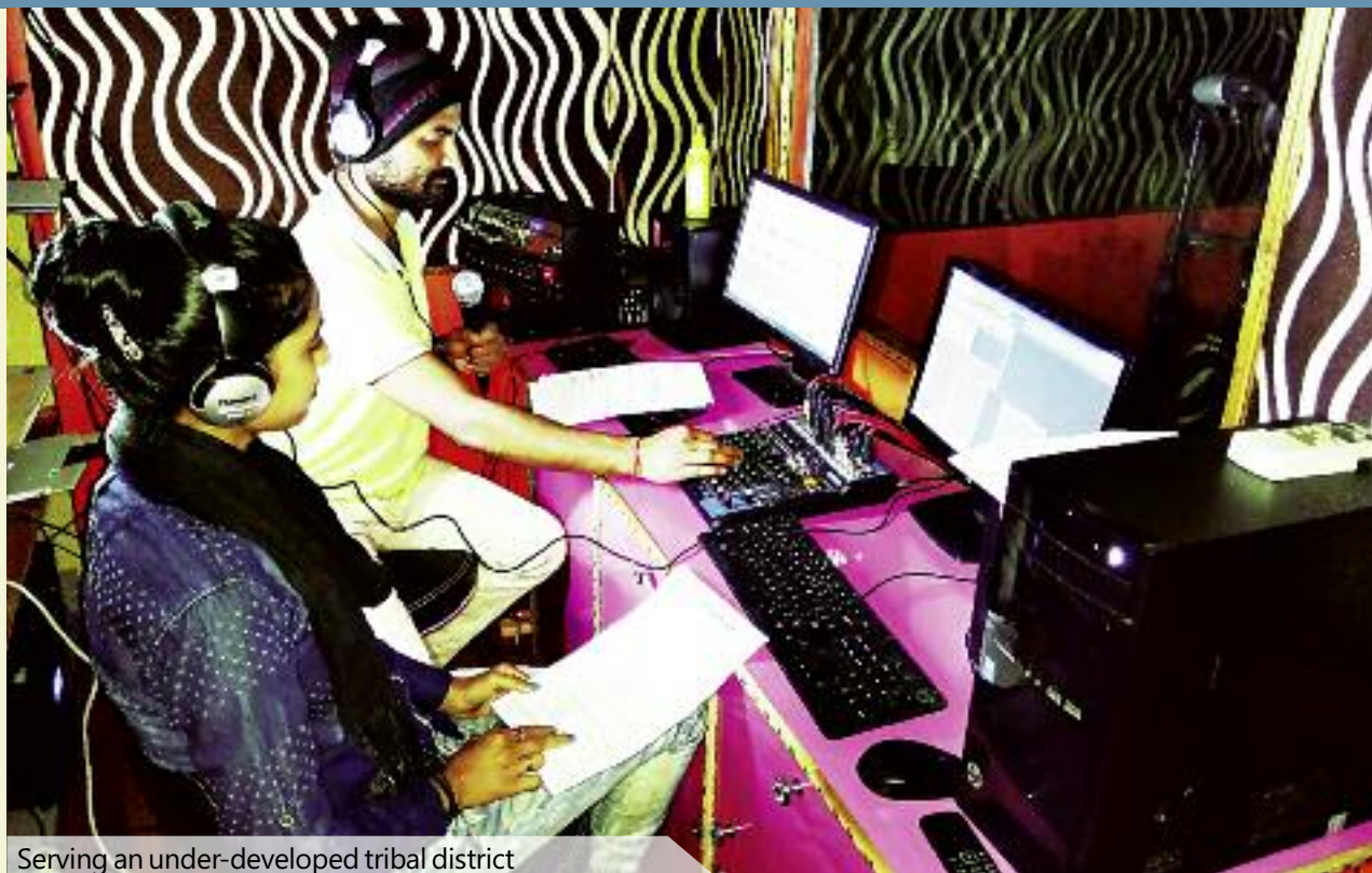
Serving an under-developed tribal district

Broadcast Hours Languages 10 hours Odia, Hindi and English