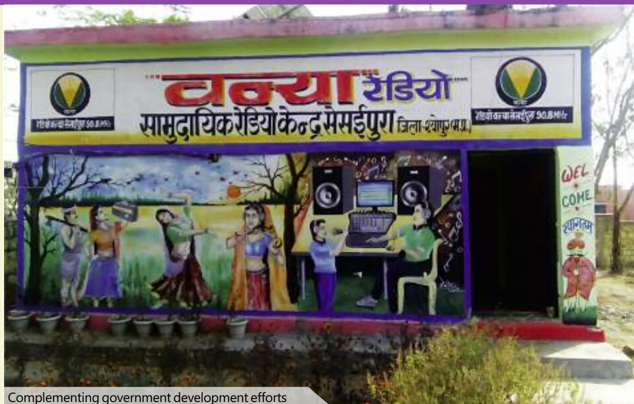
Complementing government development efforts