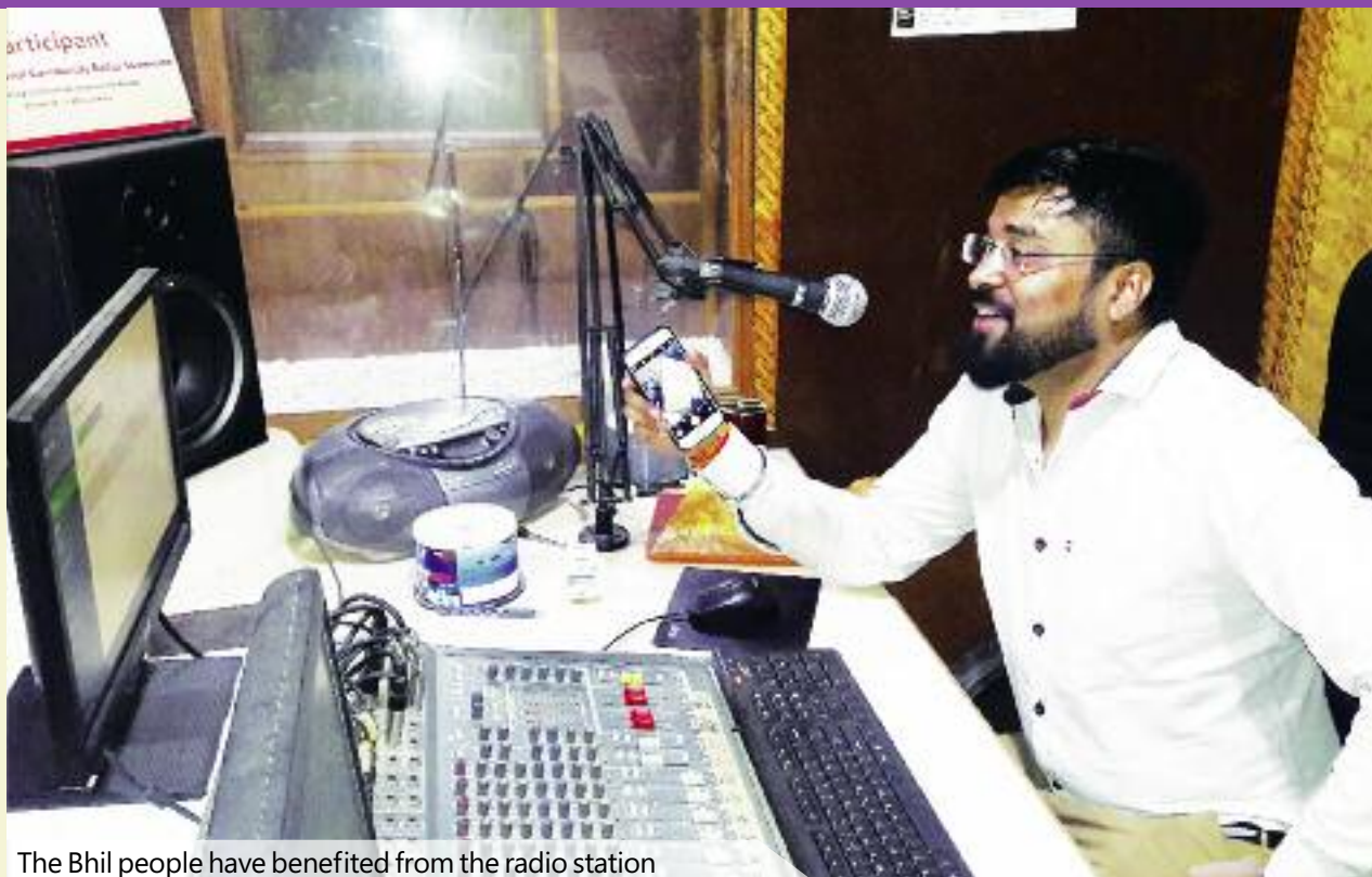
The Bhil people have benefited from the radio station

Broadcast Hours Languages 10 hours Hindi and Bhili