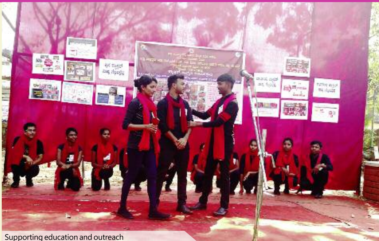
Supporting education and outreach

Languages Kannada, Tulu, Konkani & English