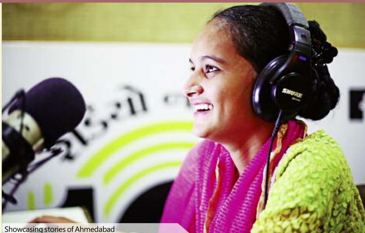
Showcasing stories of Ahmedabad