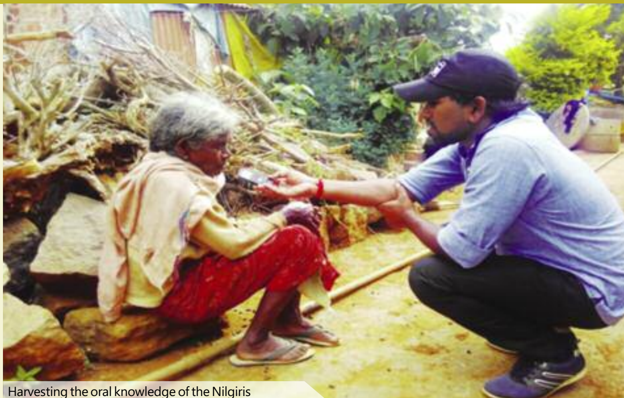
Harvesting the oral knowledge of the Nilgiris