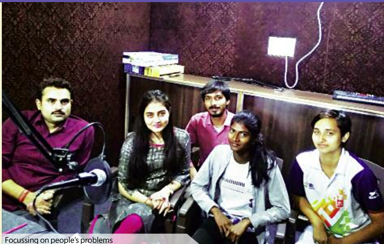
Focussing on people's problems

Languages Hindi, English, Urdu and local language Angia