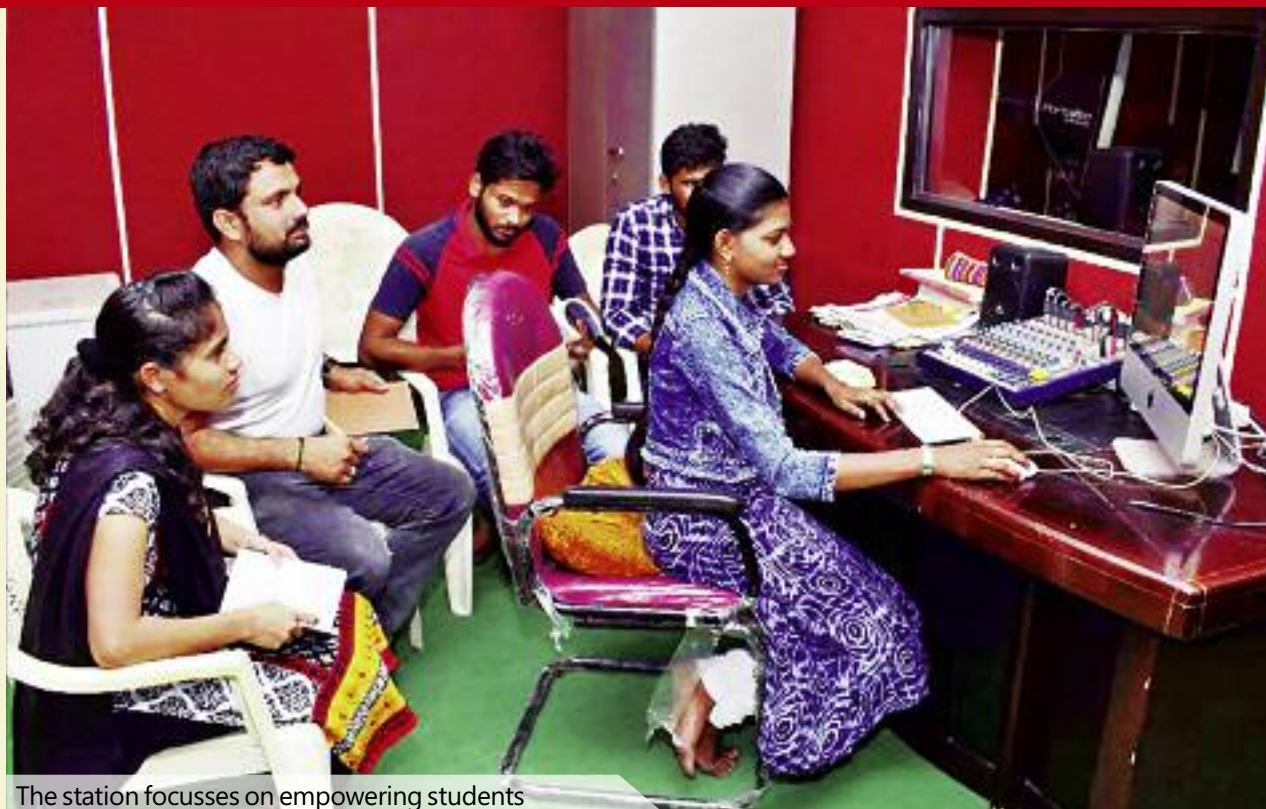
The station focusses on empowering students