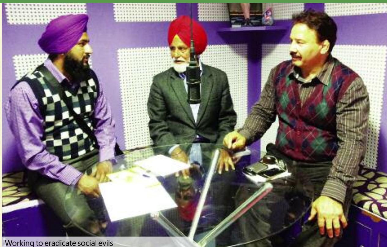
Working to eradicate social evils