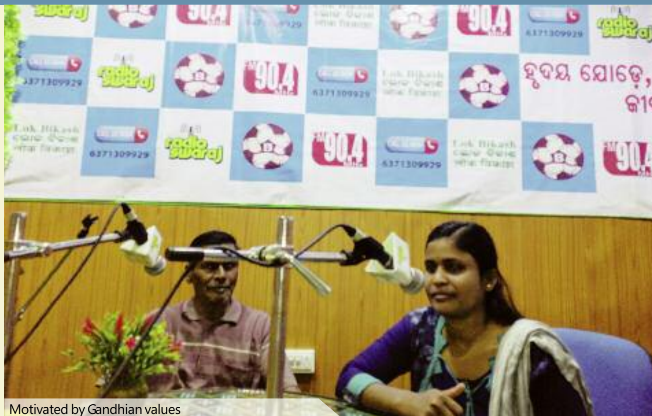
Motivated by Gandhian values