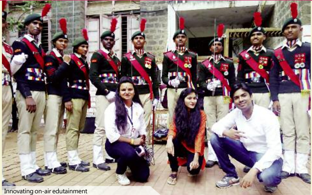
Innovating on-air edutainment