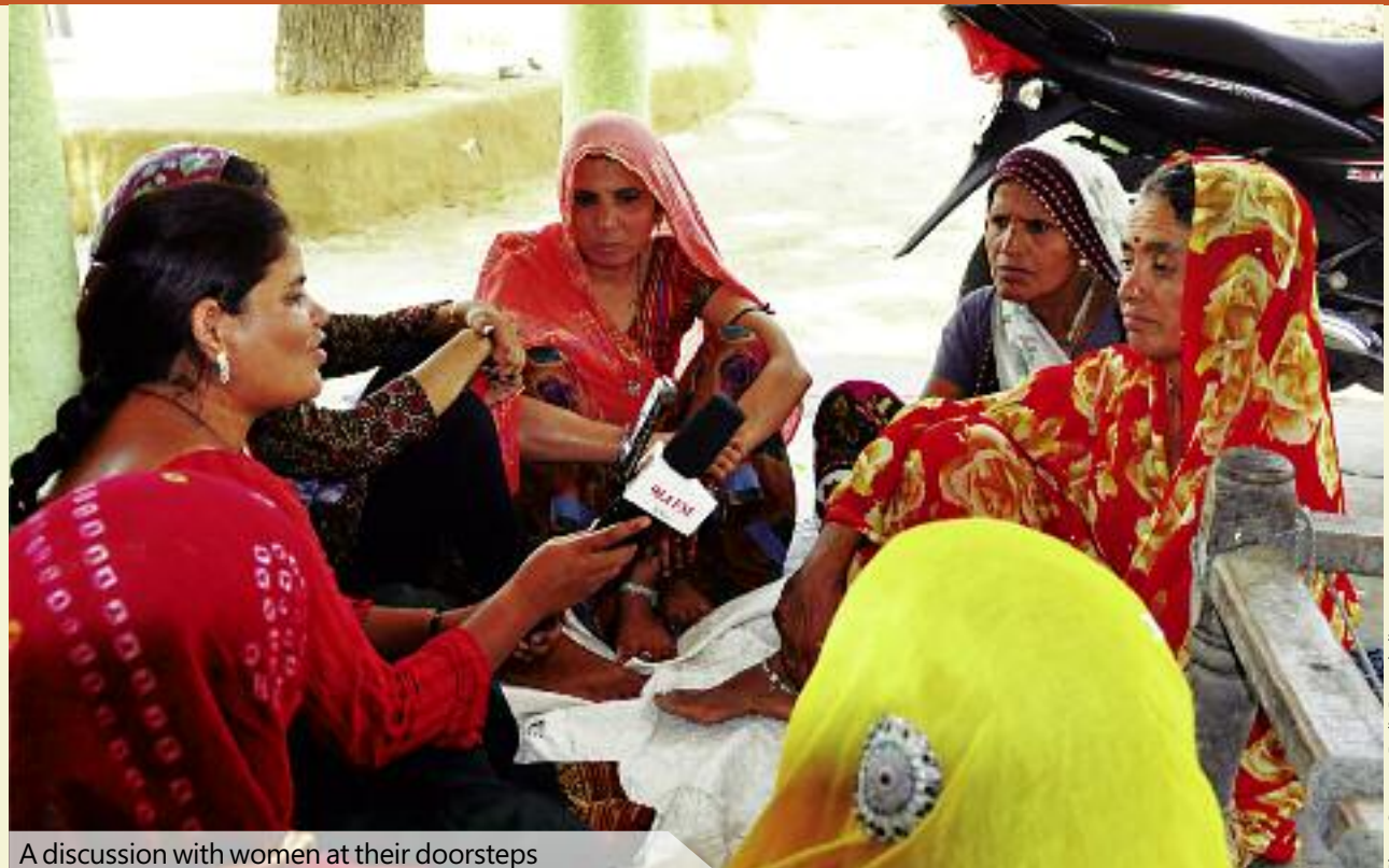
A discussion with women at their doorsteps