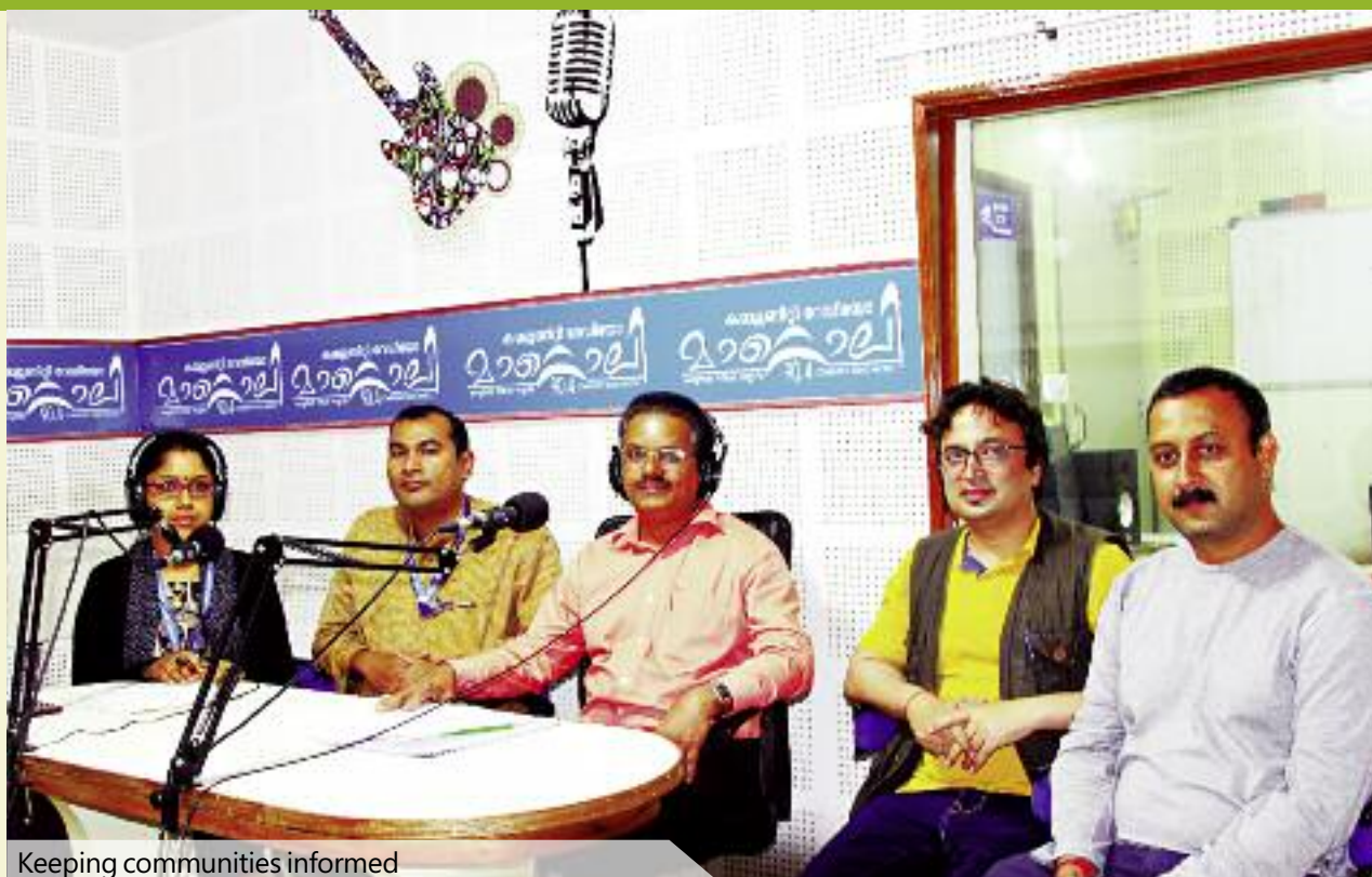
Keeping communities informed

Broadcast Hours 24 hours Languages Malayalam and tribal dialects