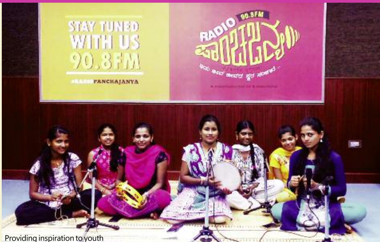
Providing inspiration to youth