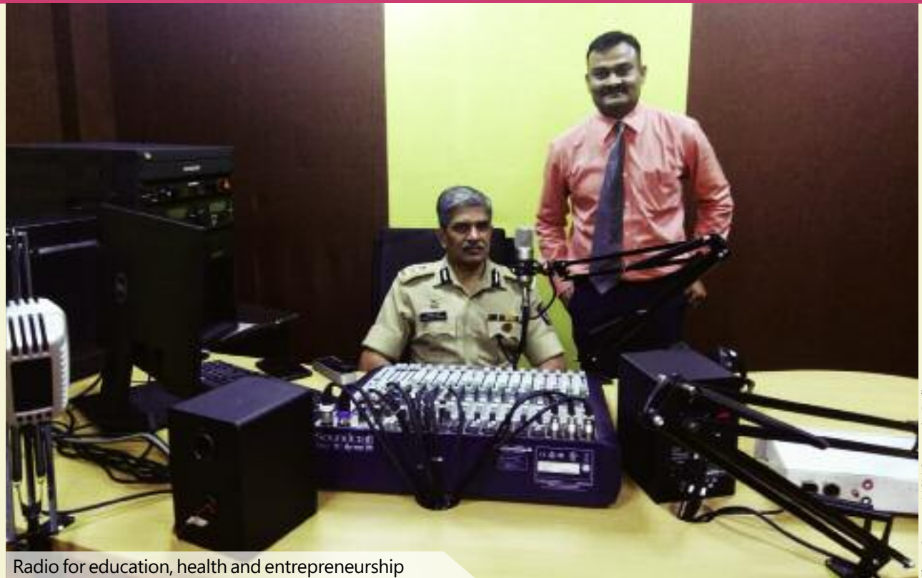
Radio for education, health and entrepreneurship