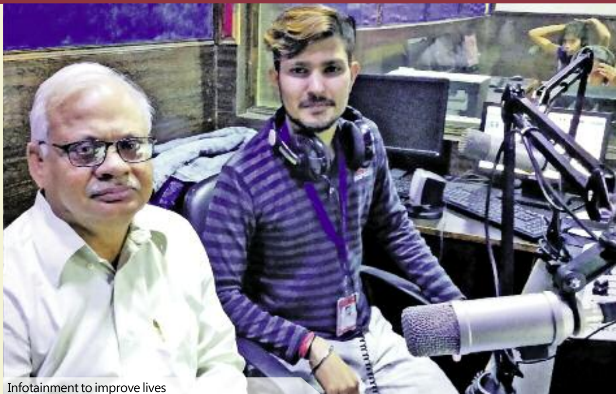
Infotainment to improve lives

Broadcast Hours | Languages 24 hours | Hindi