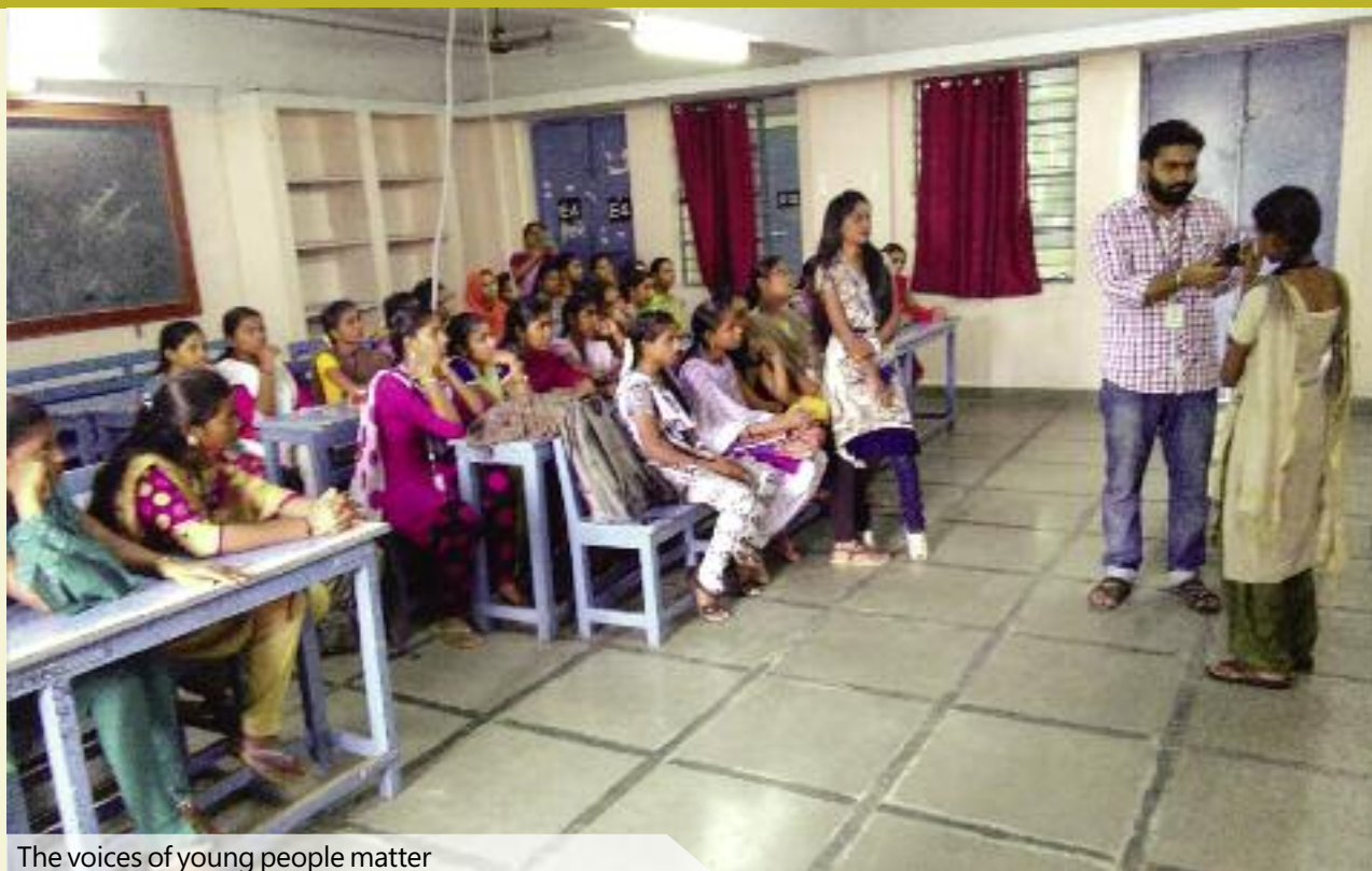
The voices of young people matter