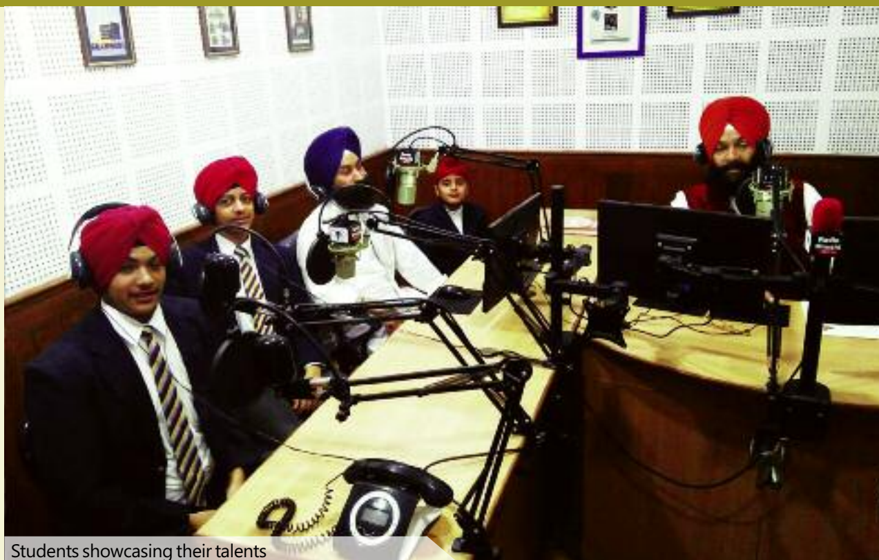
Students showcasing their talents