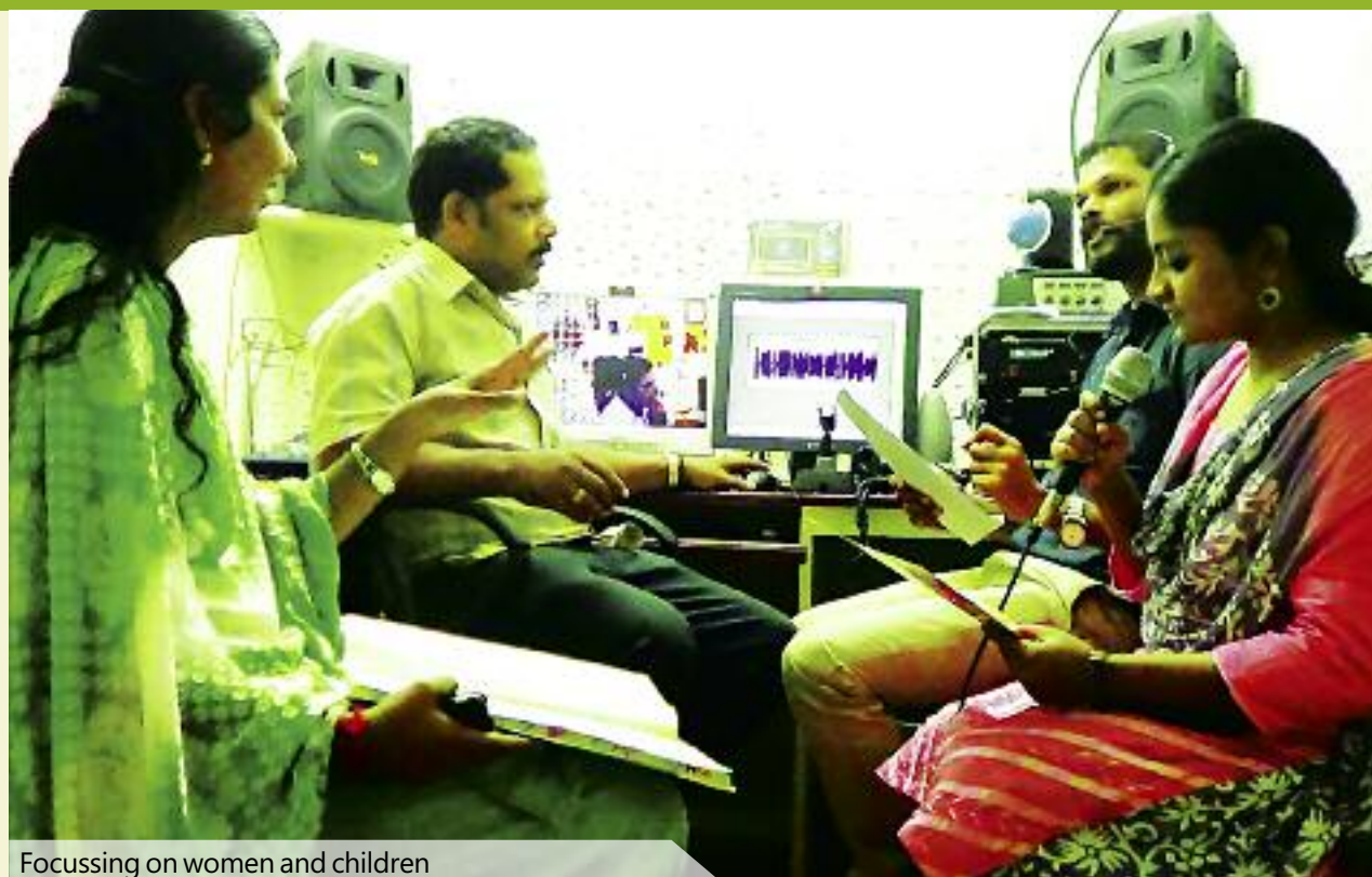
Focussing on women and children

Broadcast Hours Languages 24 hours Malayalam