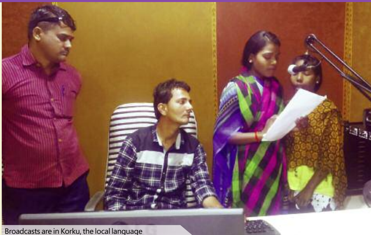
Broadcasts are in Korku, the local language