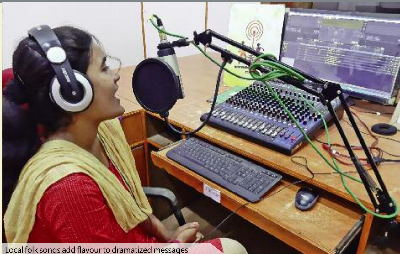
Local folk songs add flavour to dramatized messages