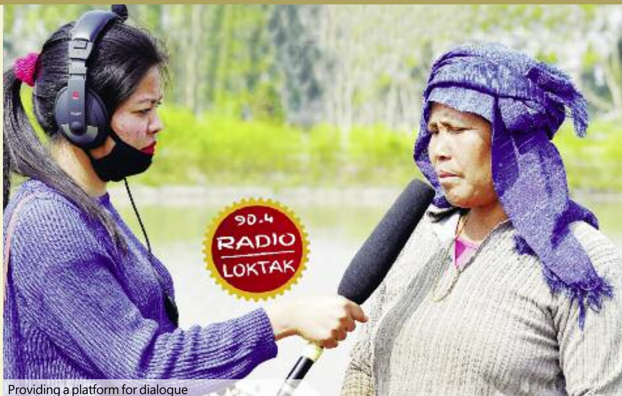
Providing a platform for dialogue