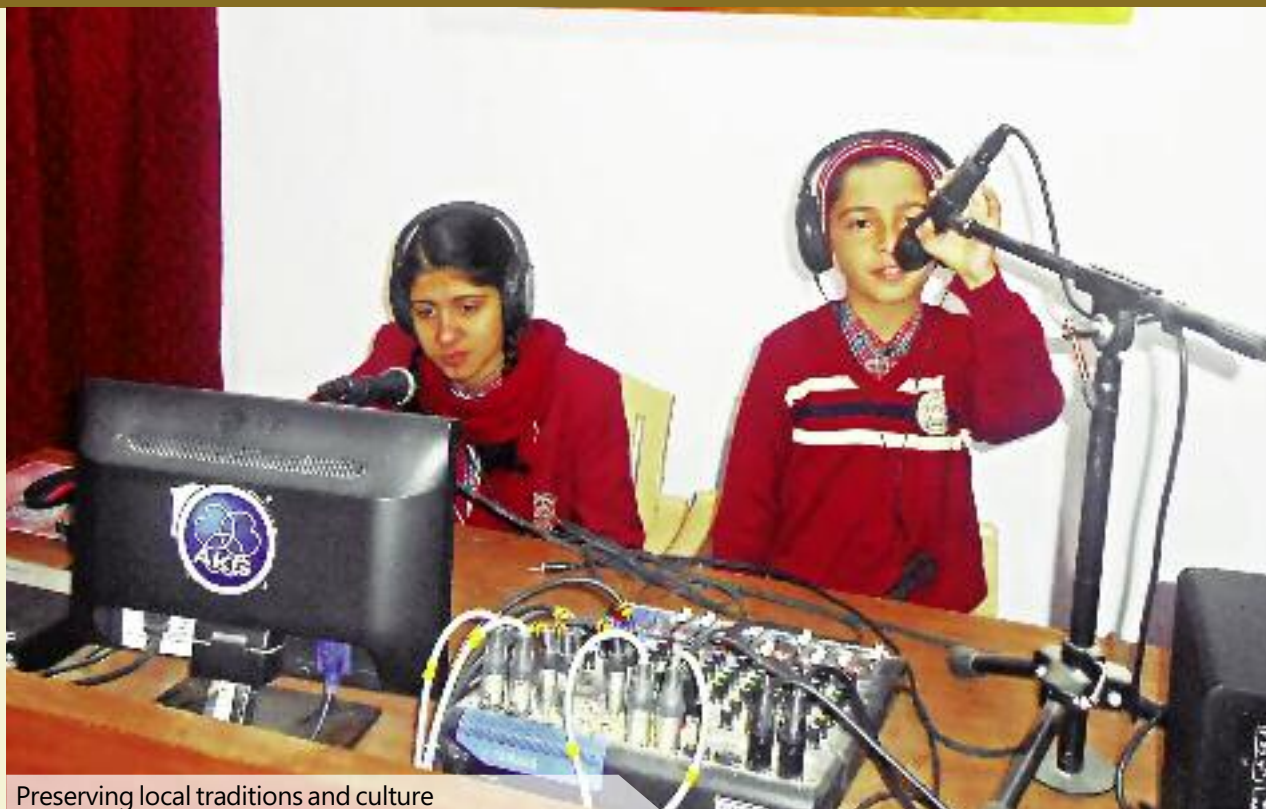
Preserving local traditions and culture

Broadcast Hours Languages 7 hours Hindi, Sargujhia and Chhattisgarhi