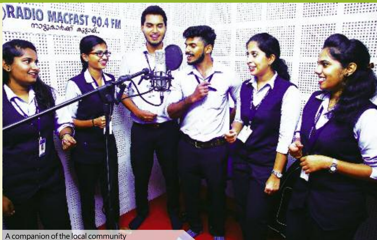
A companion of the local community