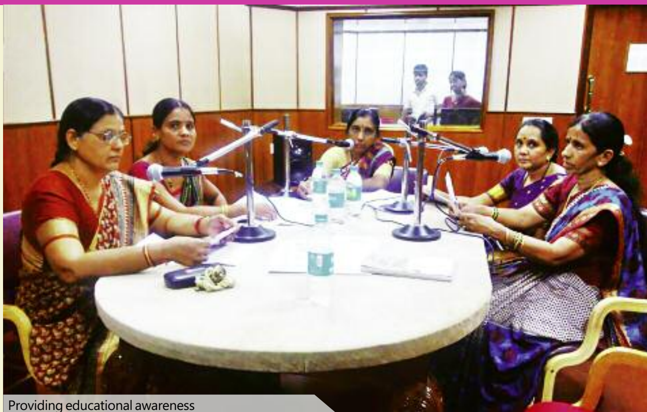
Providing educational awareness