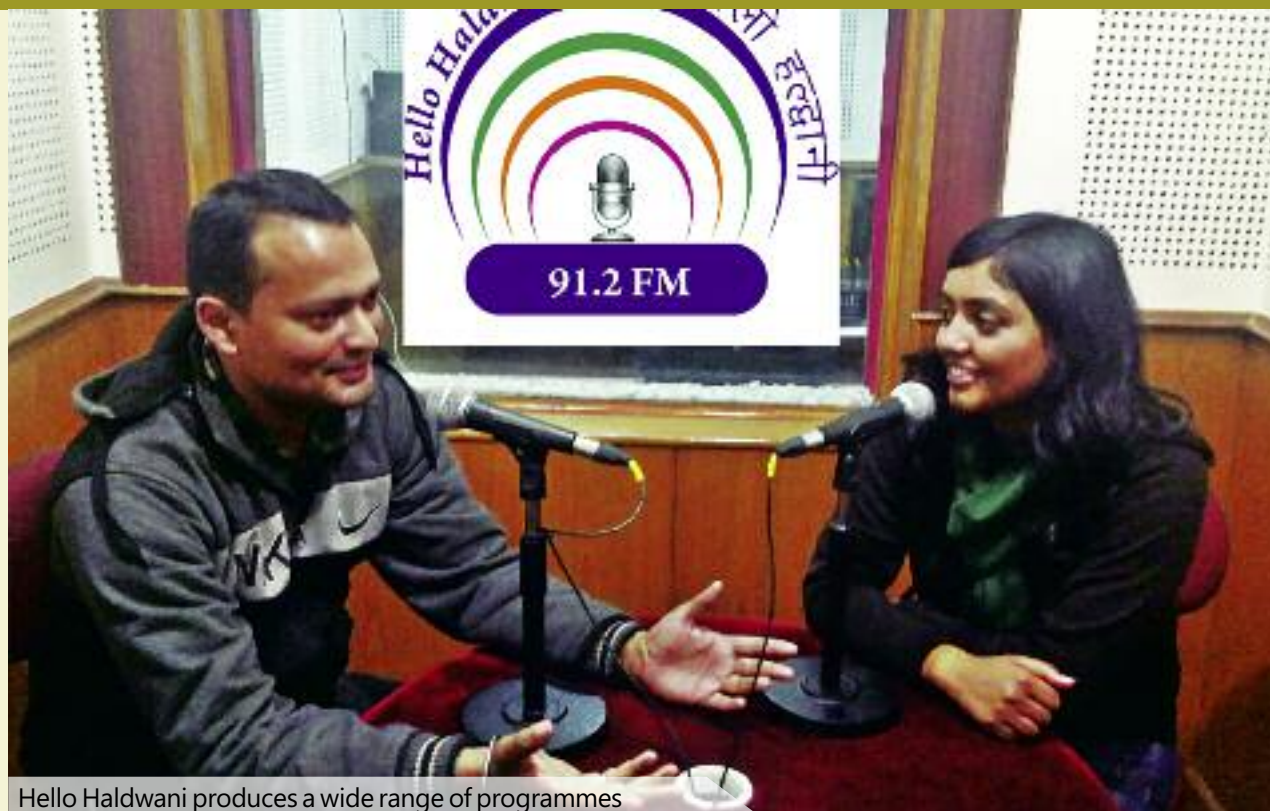
Hello Haldwani produces a wide range of programmes