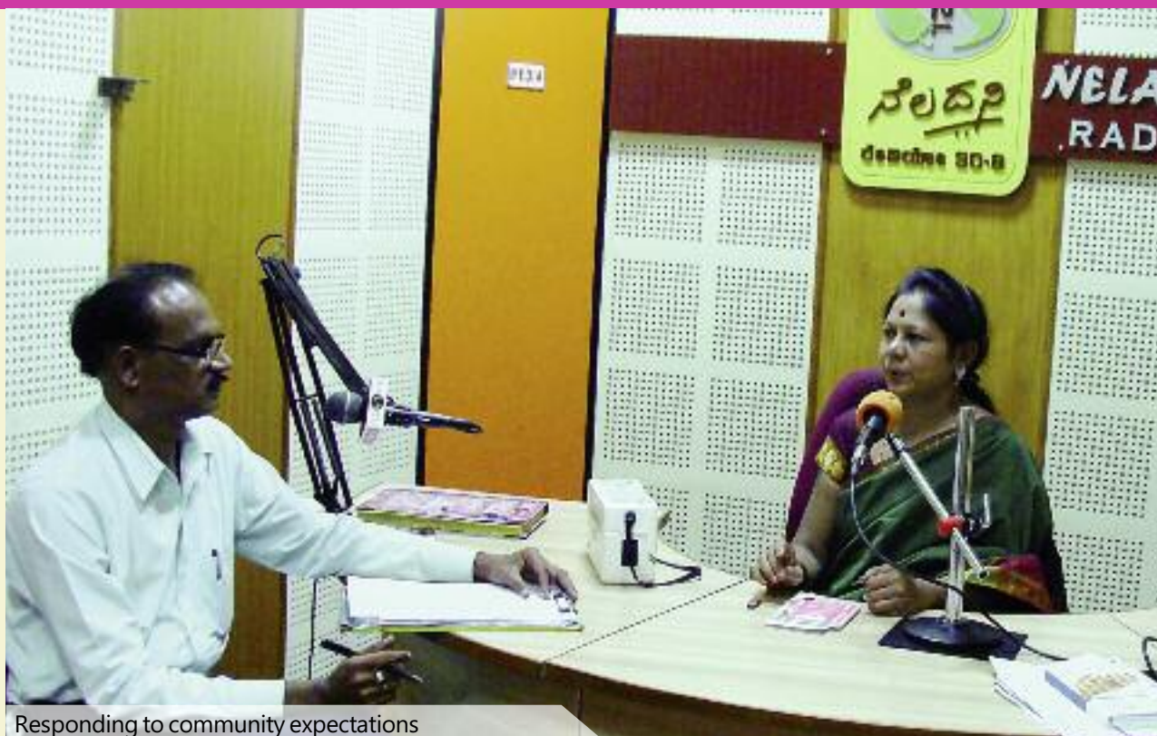
Responding to community expectations