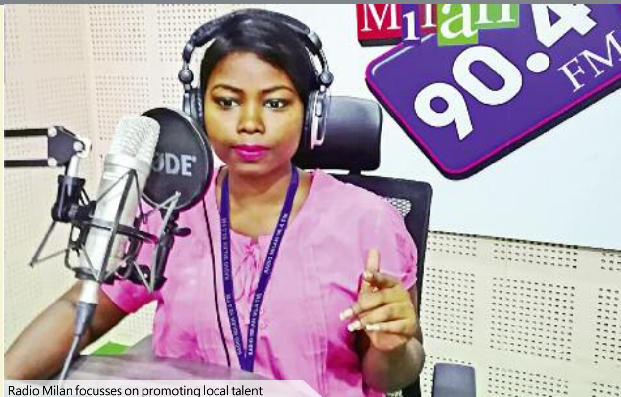
Radio Milan focusses on promoting local talent