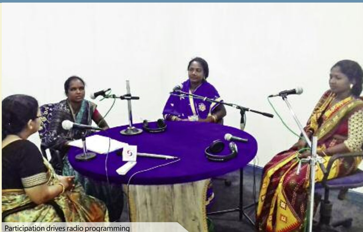
Participation drives radio programming

Broadcast Hours | Languages 5 hours | Odia, Hindi and English