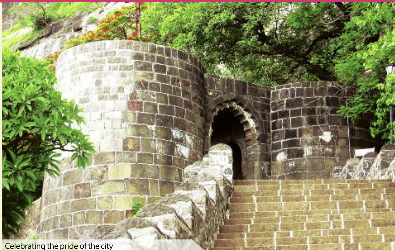
Celebrating the pride of the city