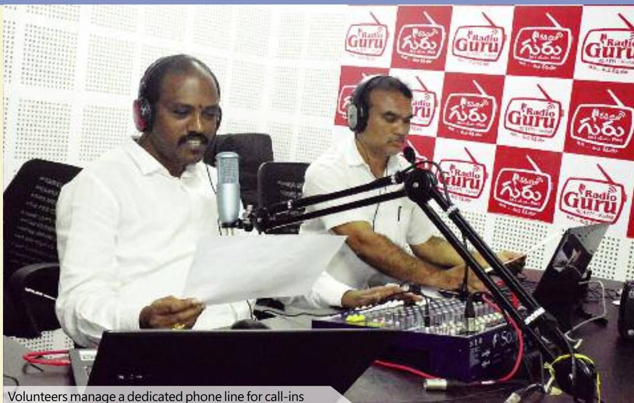
Volunteers manage a dedicated phone line for call-ins