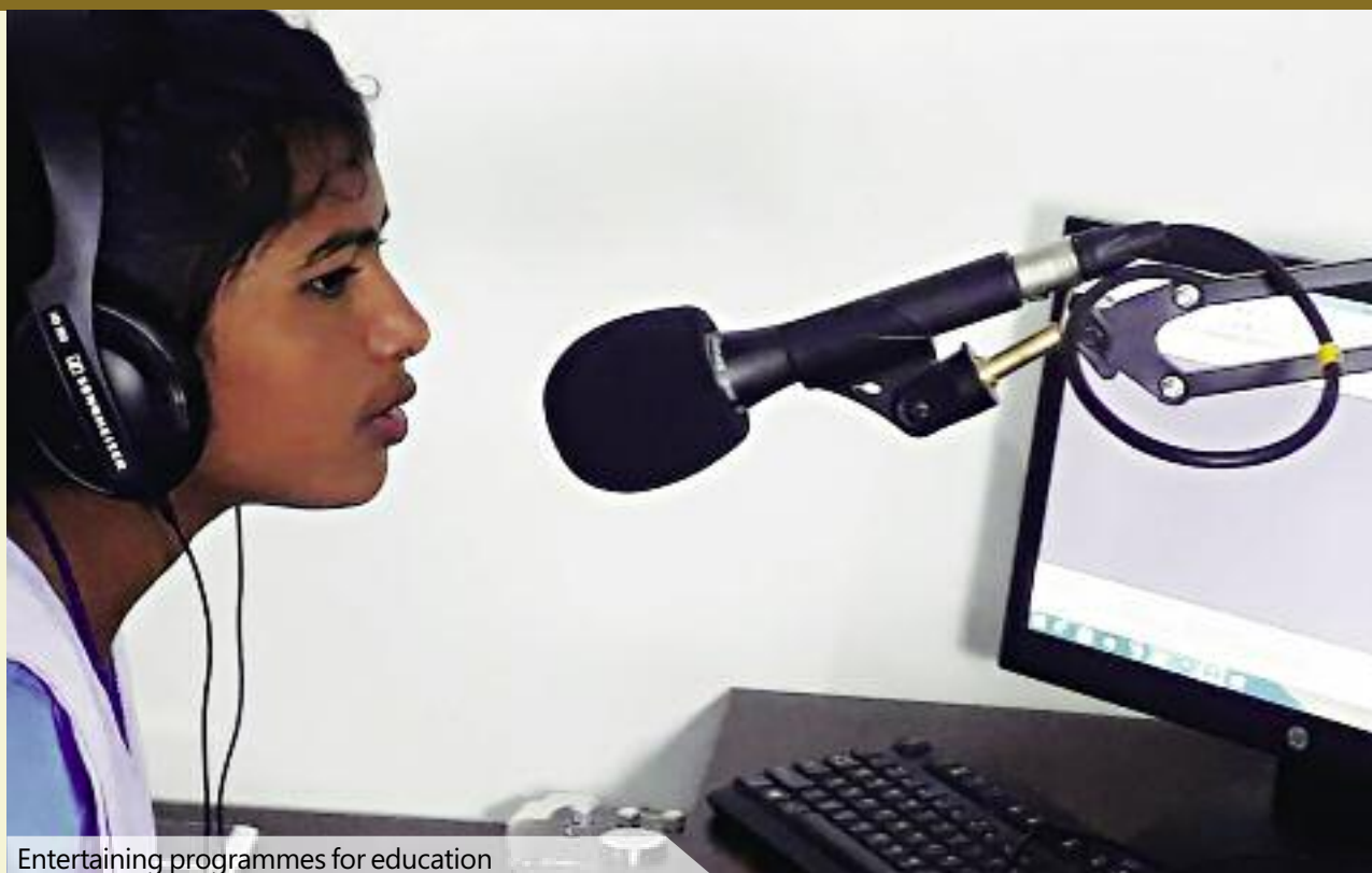
Entertaining programmes for education