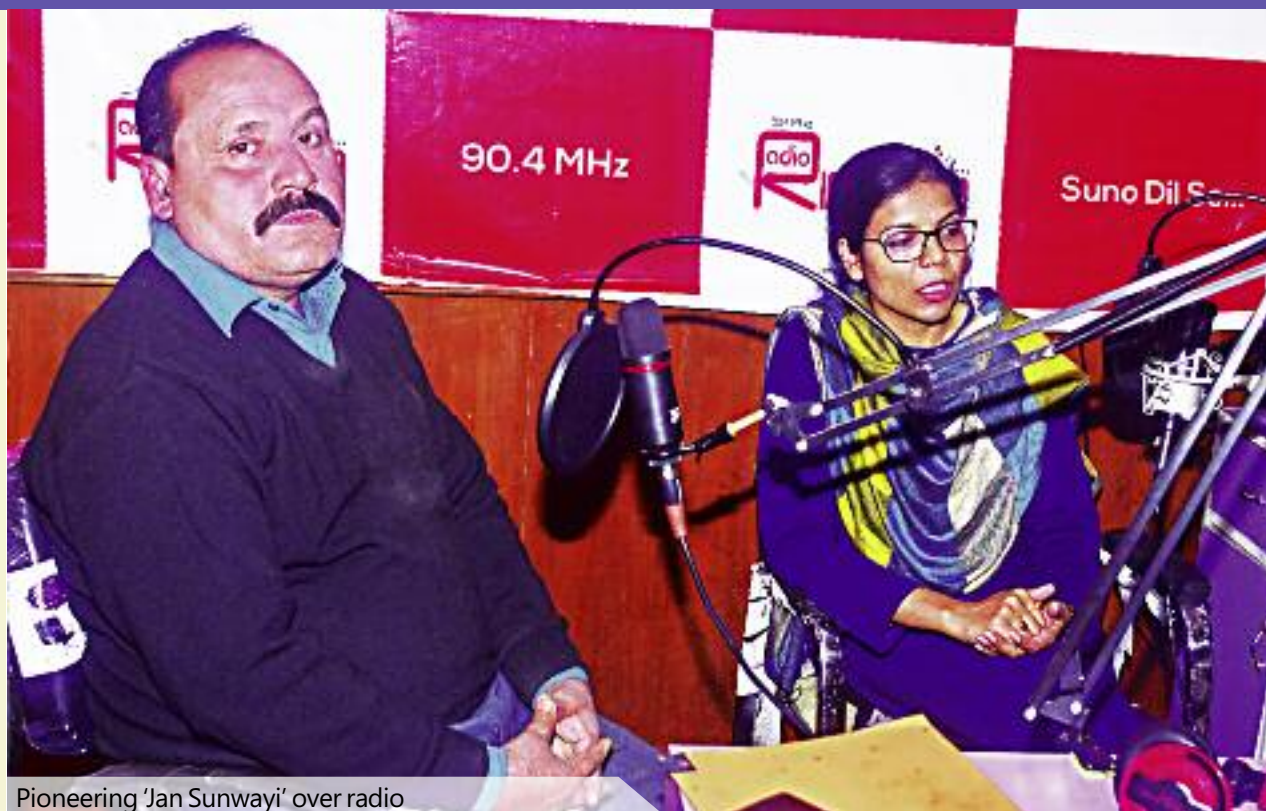
Pioneering 'Jan Sunwayi' over radio

Broadcast Hours 18:15 hours Languages Bhojपुरi and Hindi