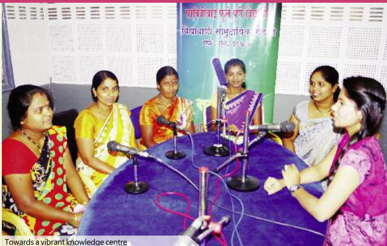
Towards a vibrant knowledge centre