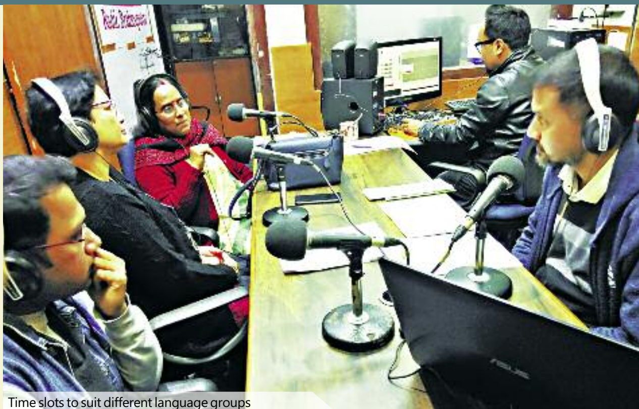
Time slots to suit different language groups