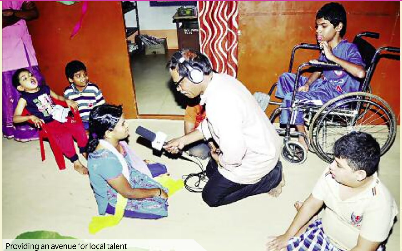
Providing an avenue for local talent