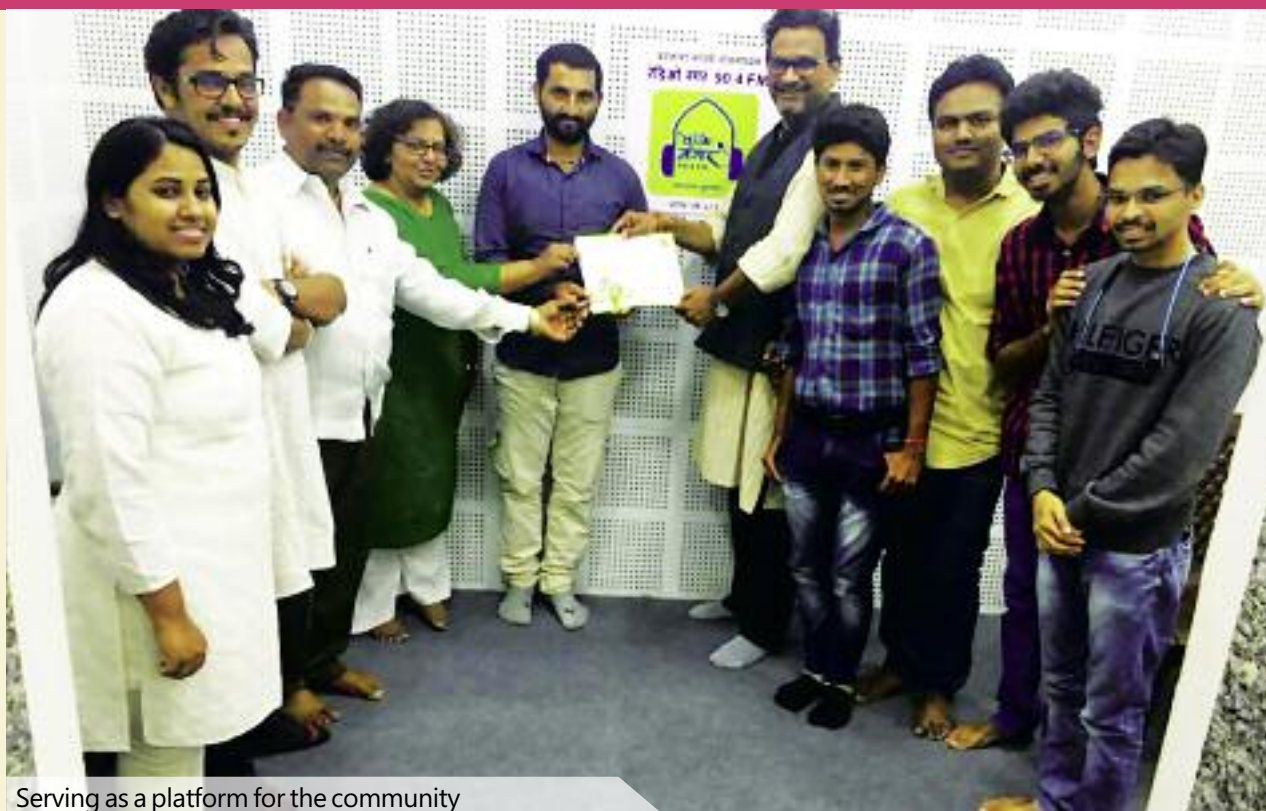
Serving as a platform for the community