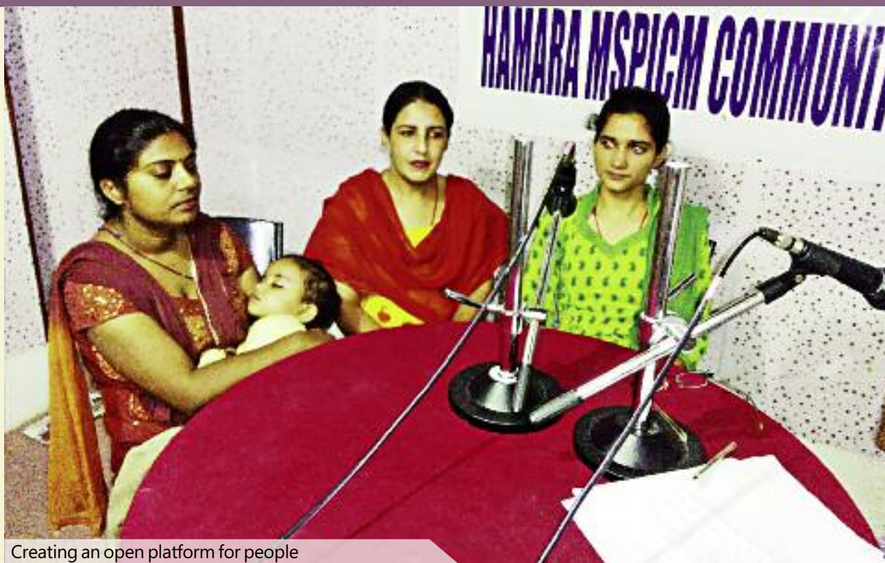
Creating an open platform for people