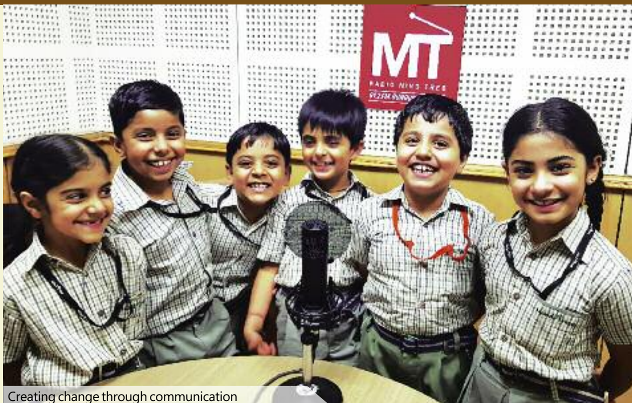
Creating change through communication