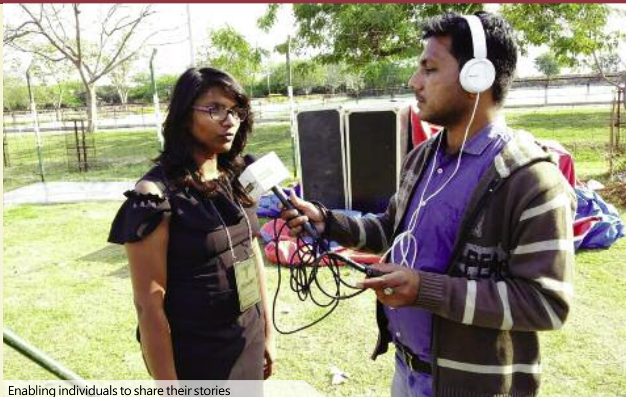
Enabling individuals to share their stories