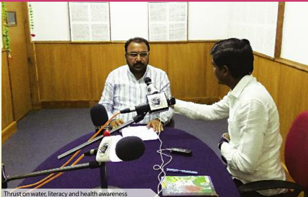
Thrust on water, literacy and health awareness