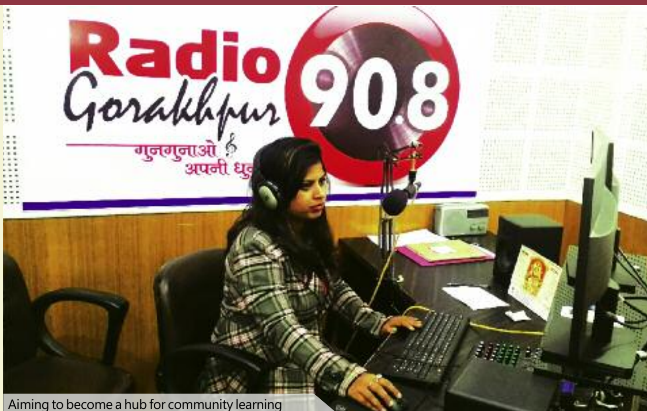
Aiming to become a hub for community learning