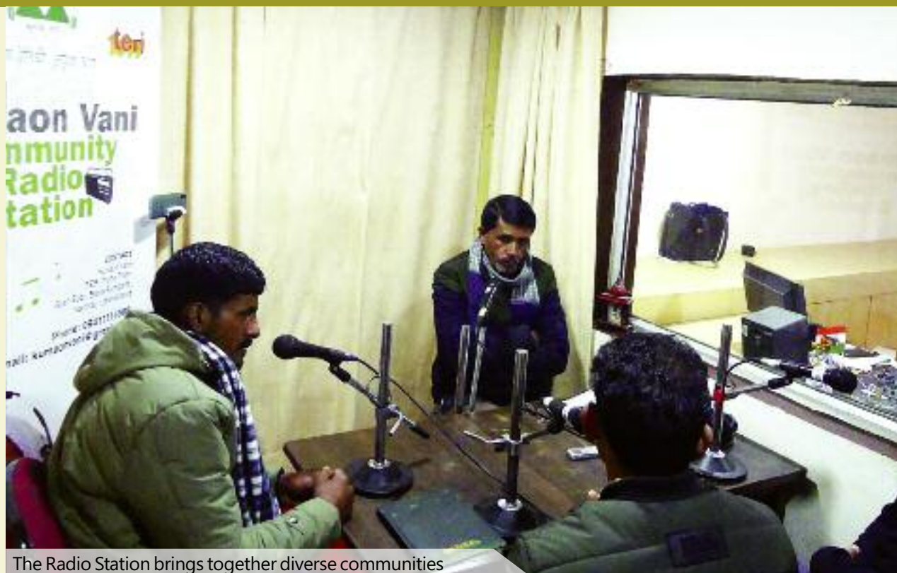
The Radio Station brings together diverse communities