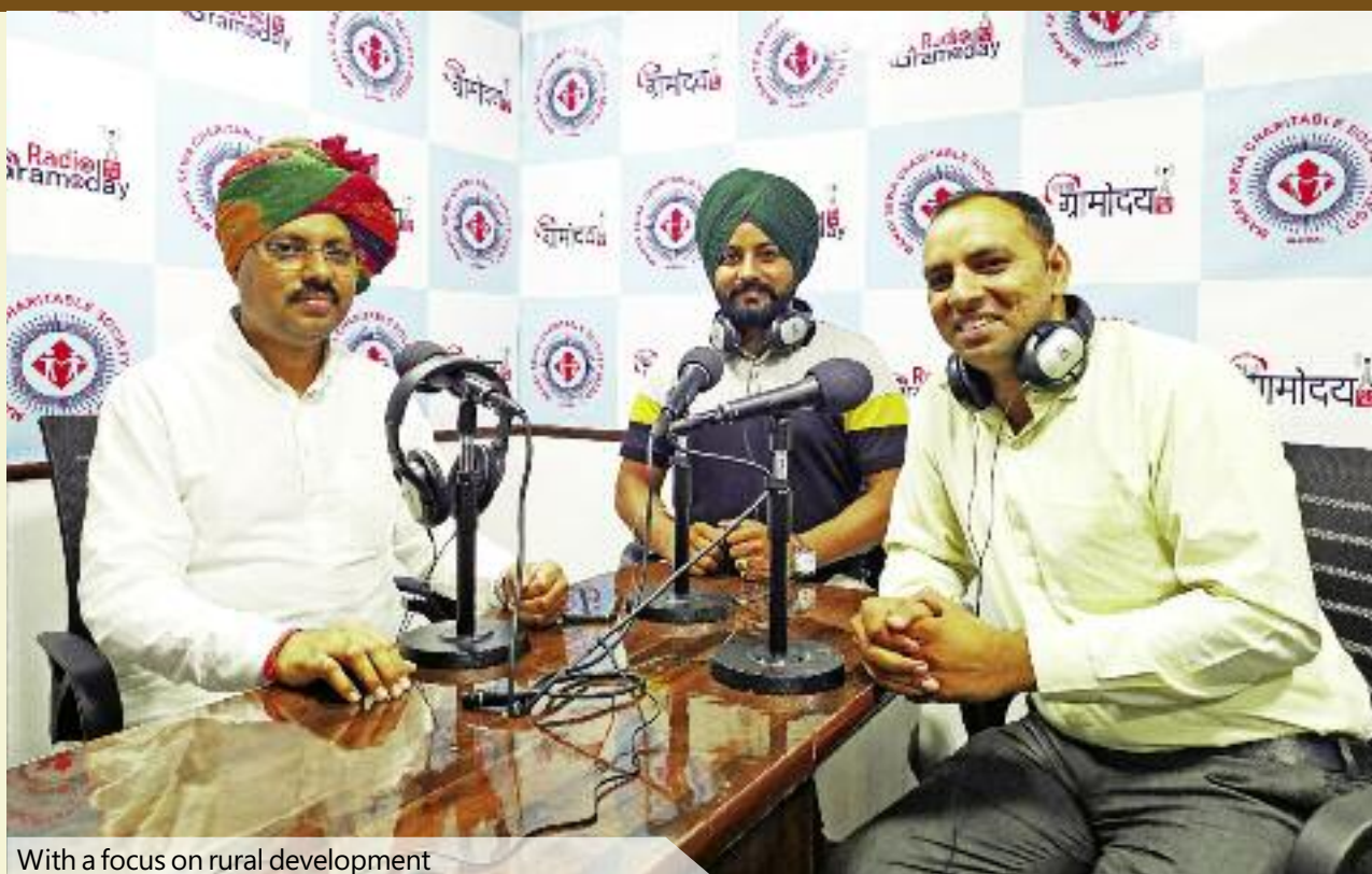
With a focus on rural development