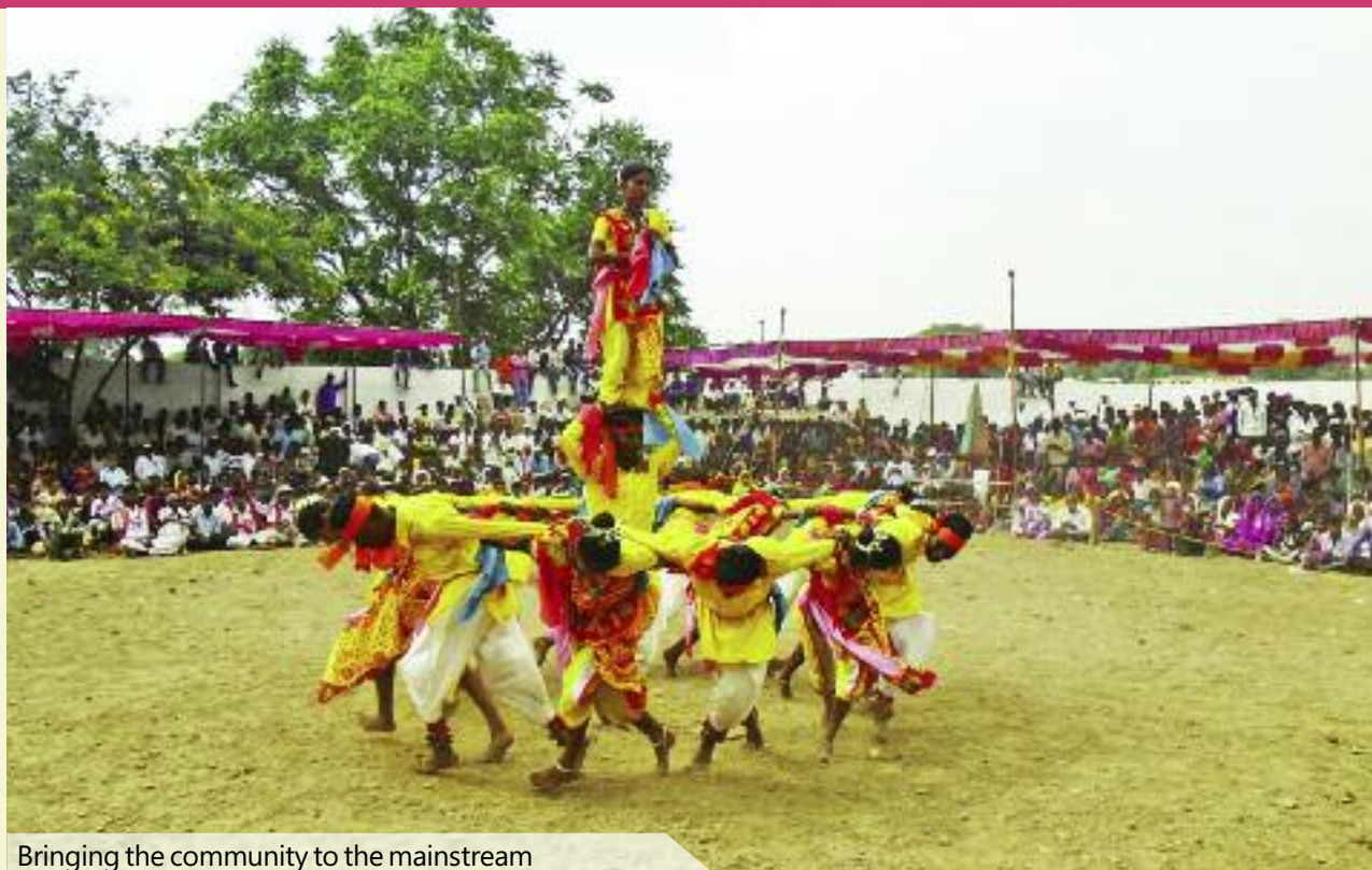
Bringing the community to the mainstream