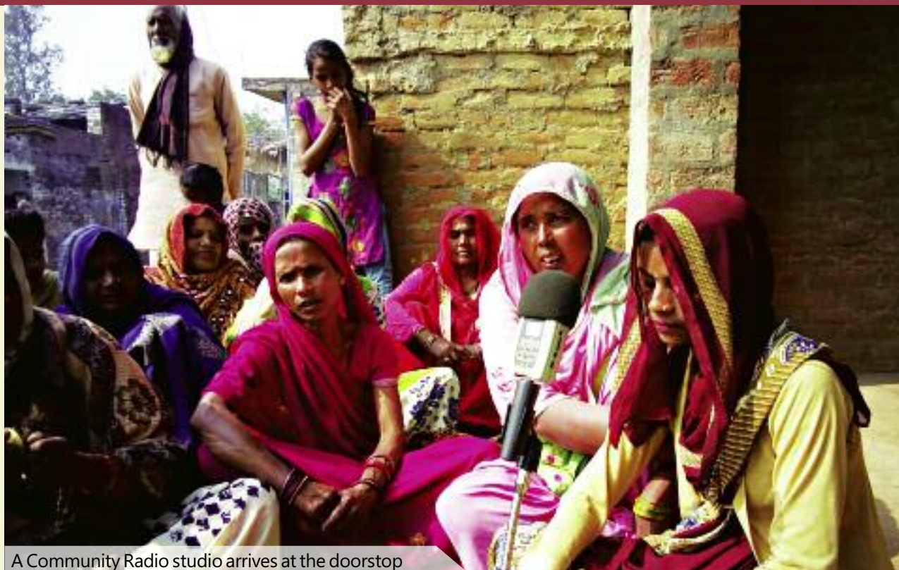
A Community Radio studio arrives at the doorstep