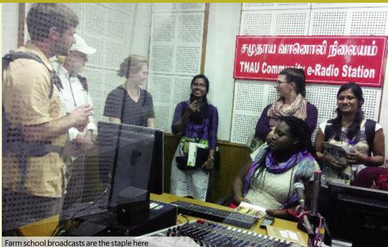
Farm school broadcasts are the staple here