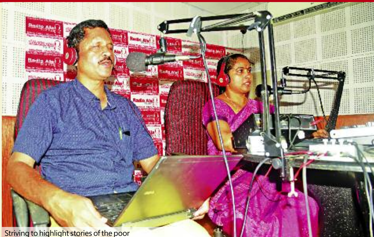
Striving to highlight stories of the poor