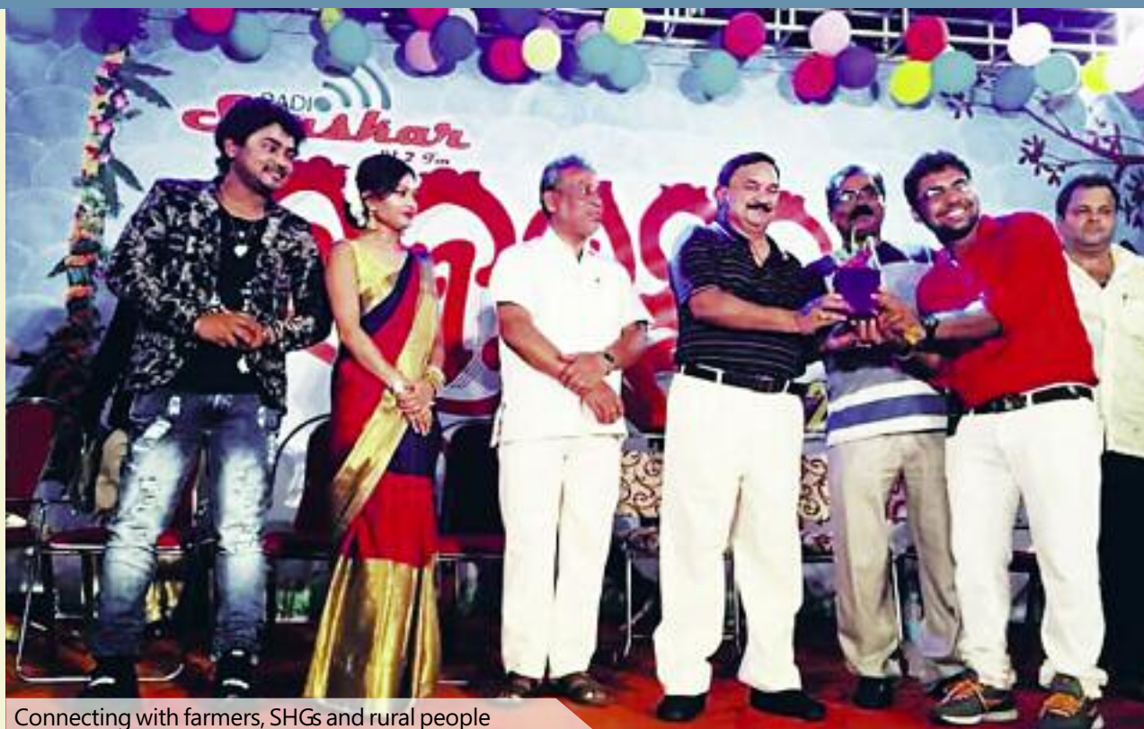
Connecting with farmers, SHGs and rural people