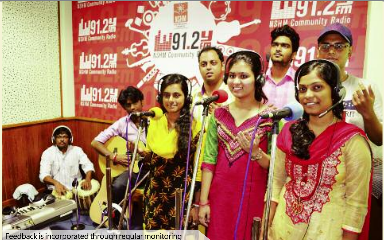
Feedback is incorporated through regular monitoring