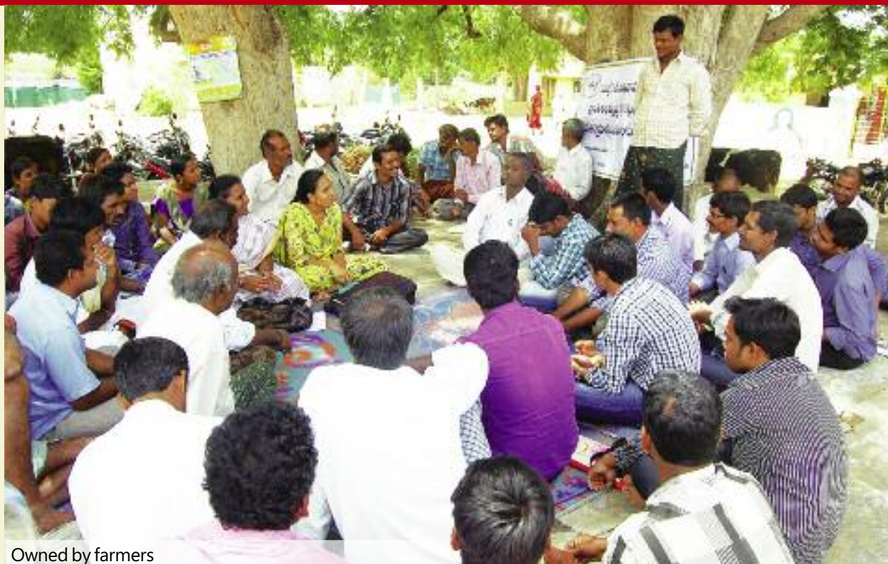
Owned by farmers

Broadcast Hours Languages 6 hours Telugu