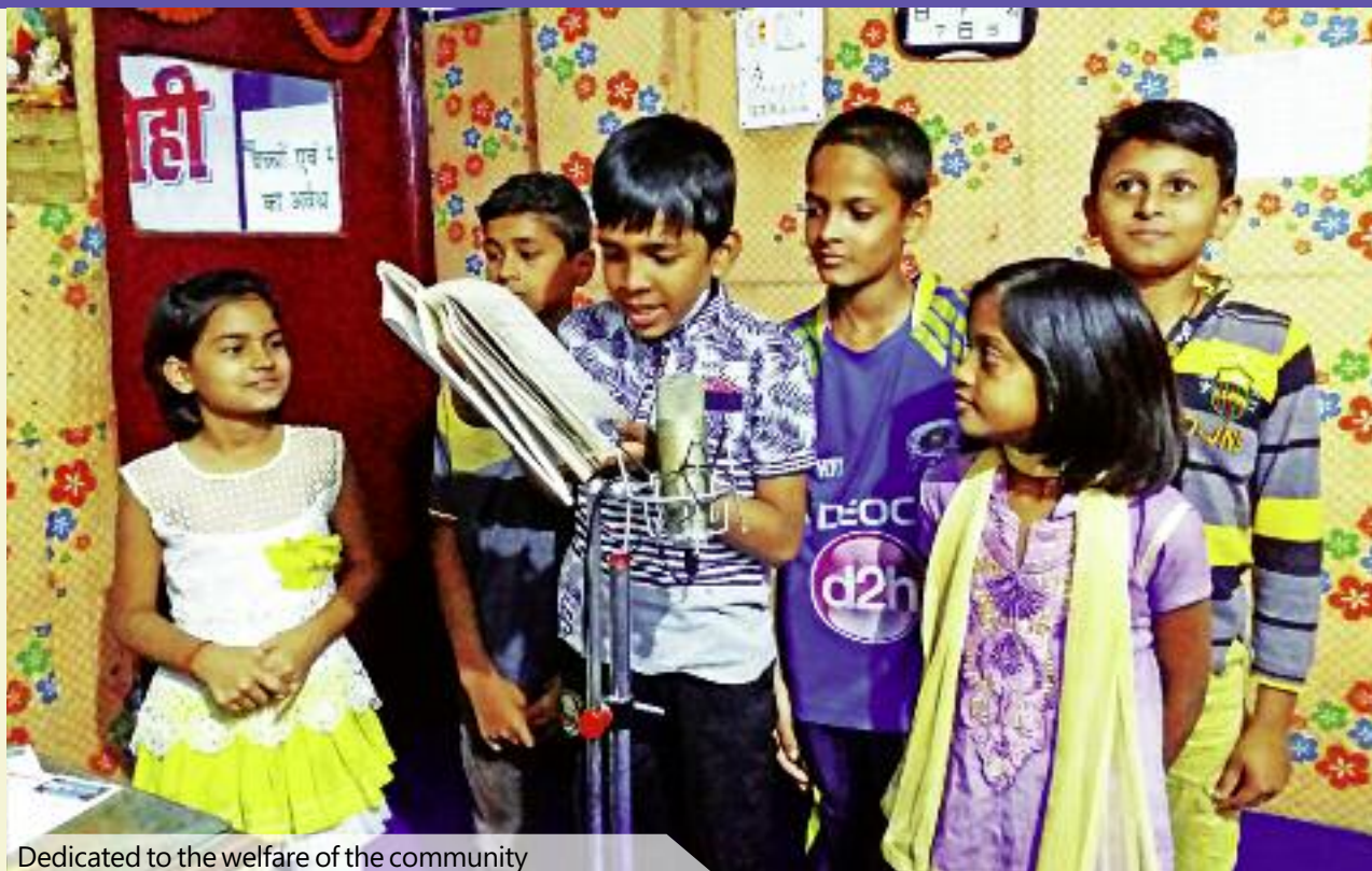
Dedicated to the welfare of the community

Languages Hindi, Bhojpuri, English and local dialects