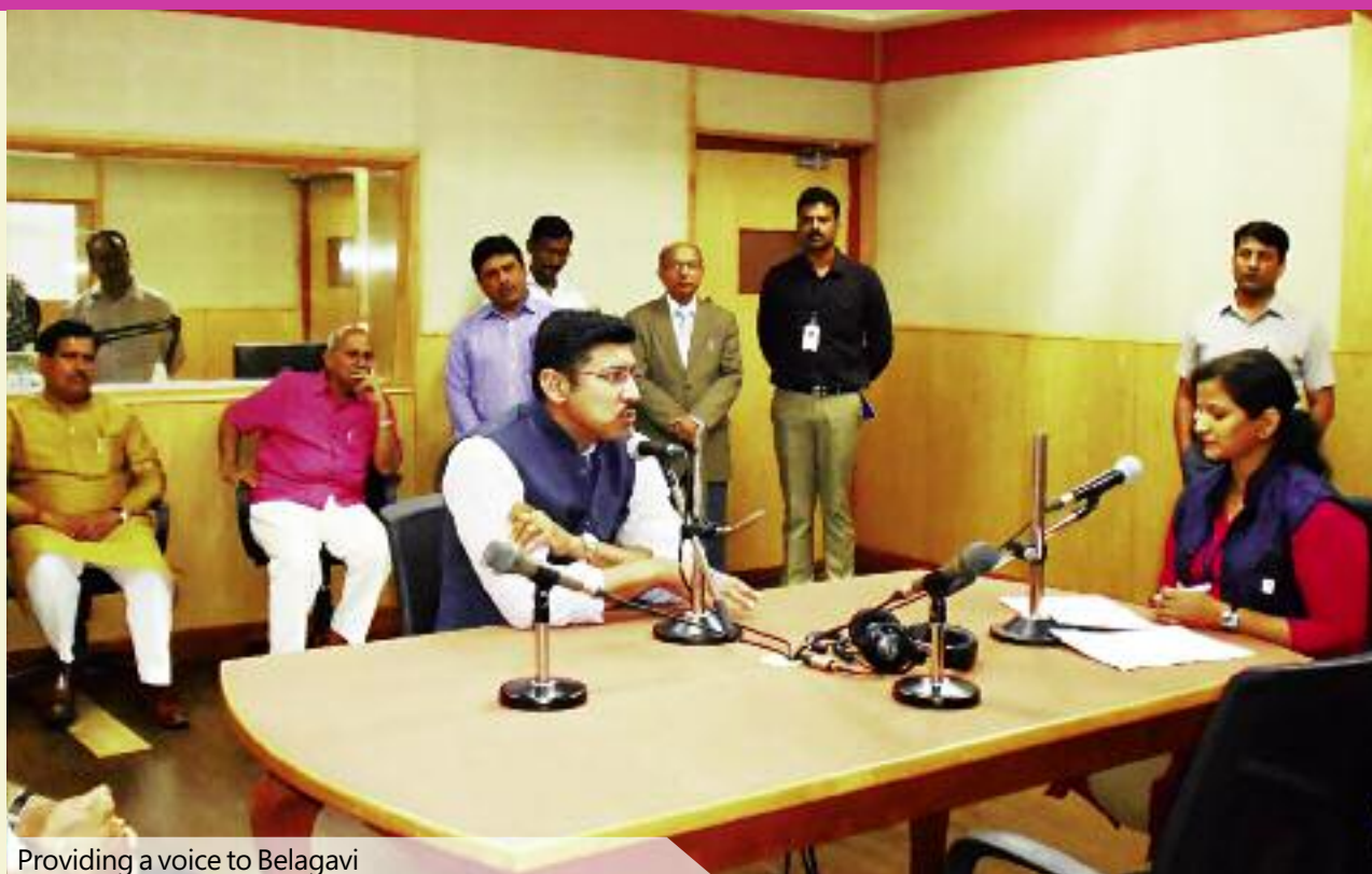
Providing a voice to Belagavi