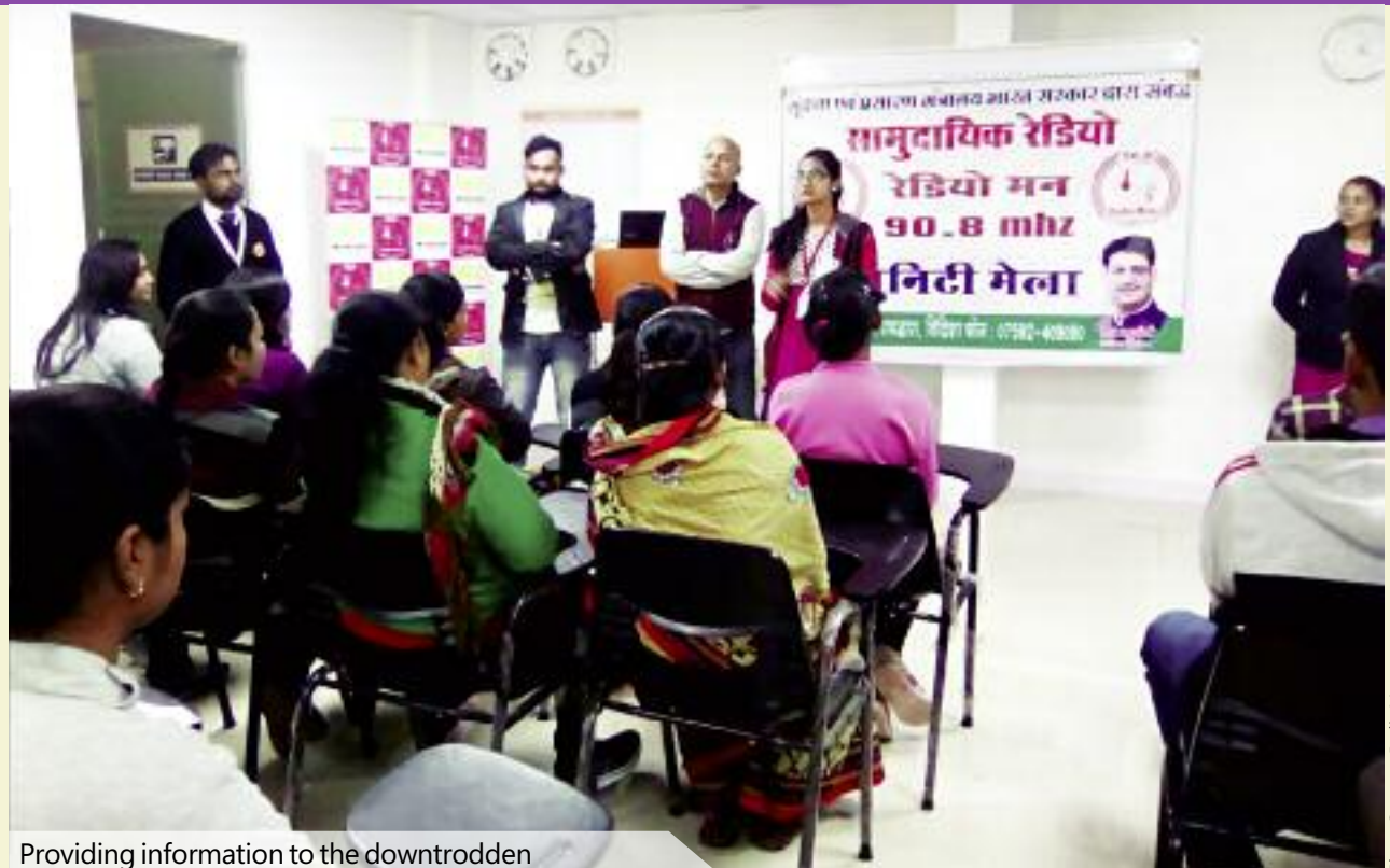
Providing information to the downtrodden

Broadcast Hours 18 hours Languages Hindi and local dialects