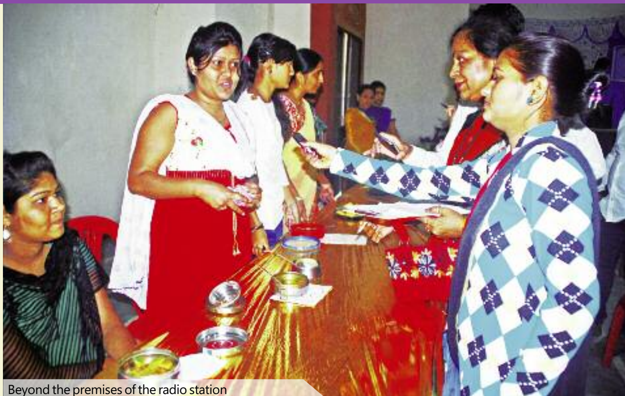
Beyond the premises of the radio station