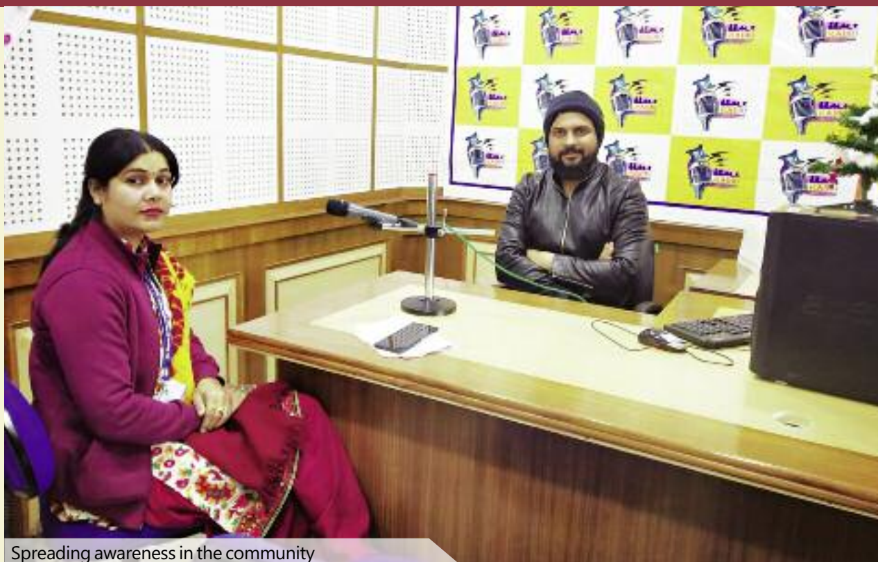
Spreading awareness in the community