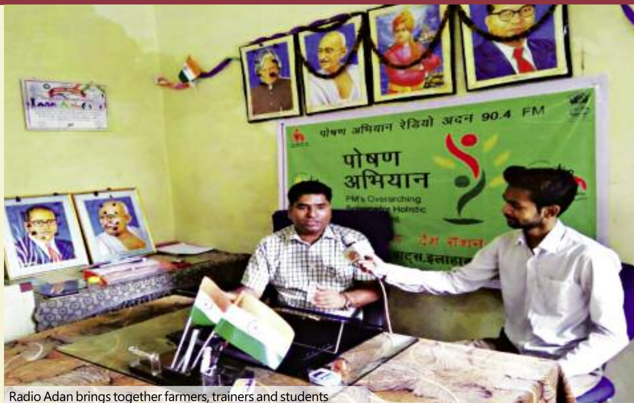
Radio Adan brings together farmers, trainers and students