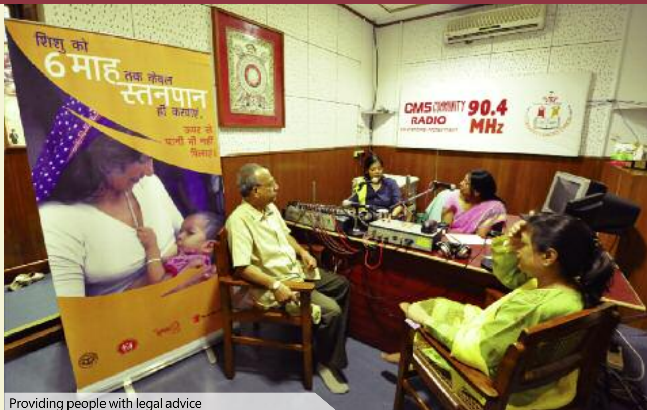
Providing people with legal advice