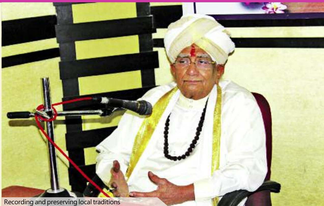
Recording and preserving local traditions