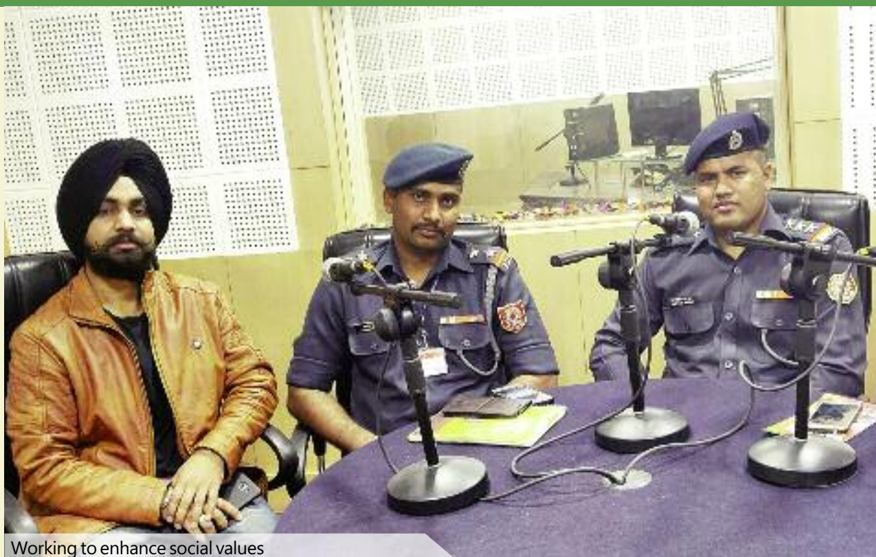
Working to enhance social values