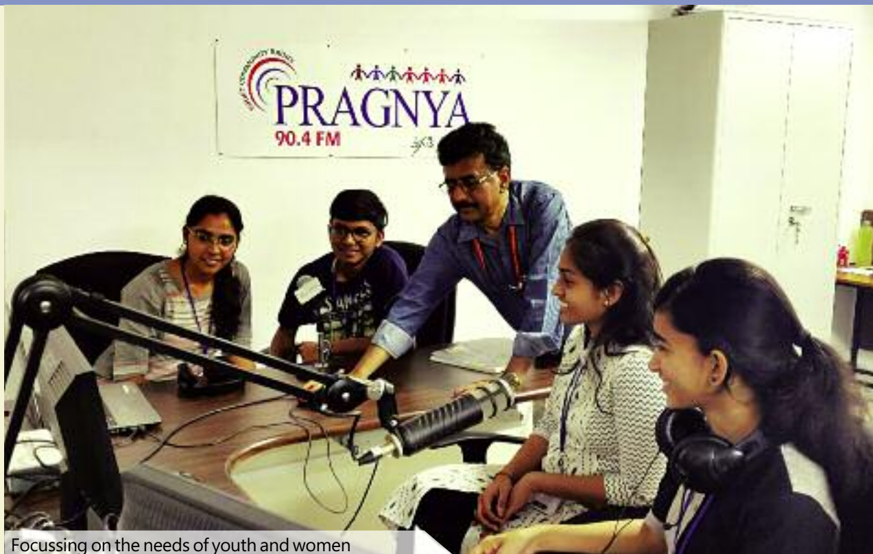
Focussing on the needs of youth and women