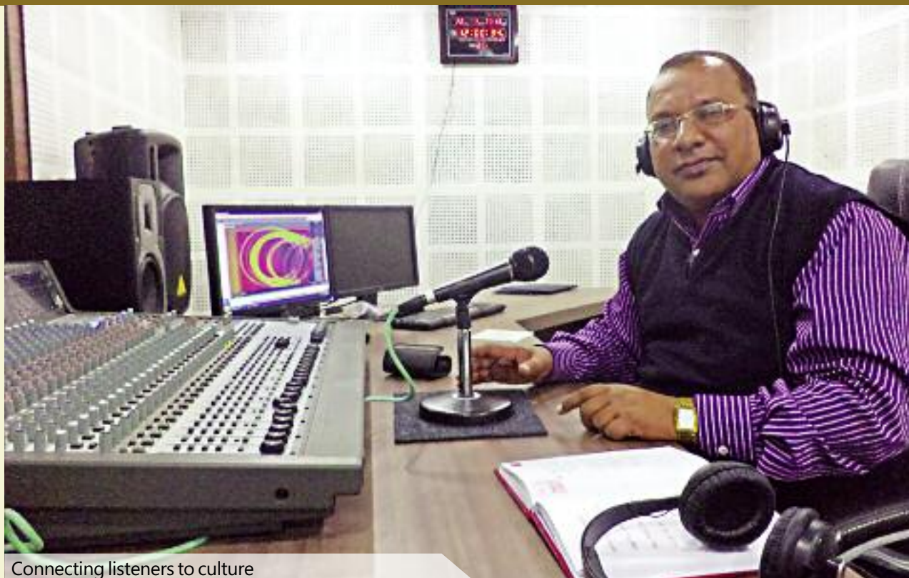
Connecting listeners to culture