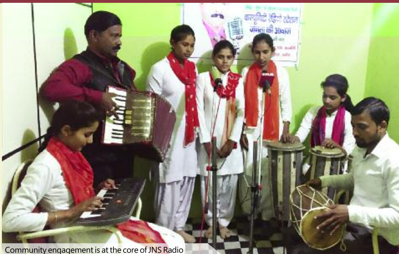
Community engagement is at the core of JNS Radio