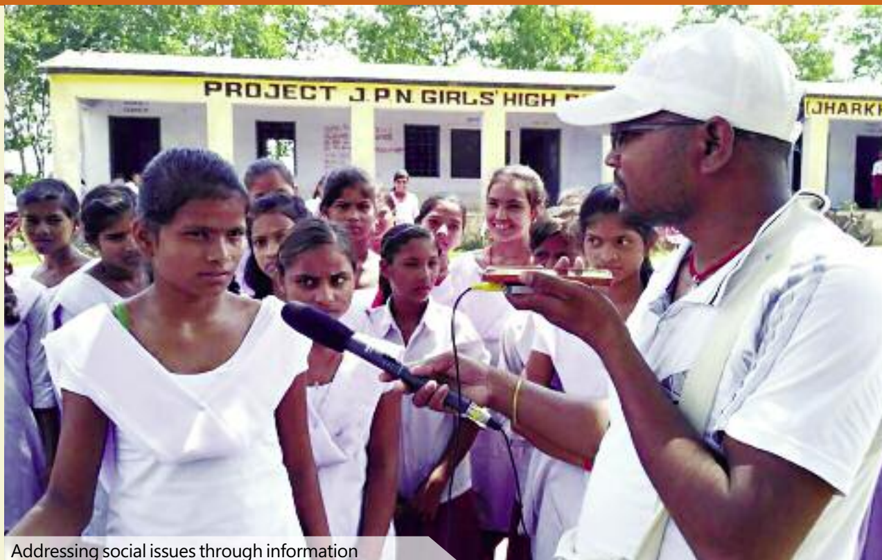
Addressing social issues through information

Languages Hindi, Khortha, Nagpuri, Mundari, Bhojpuri and Santhali