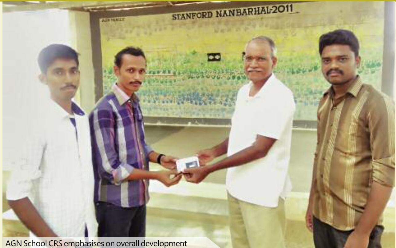
AGN School CRS emphasises on overall development