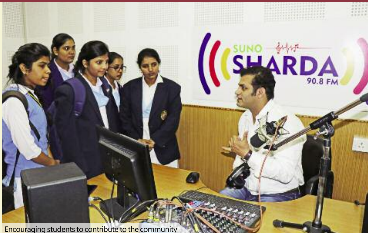
Encouraging students to contribute to the community