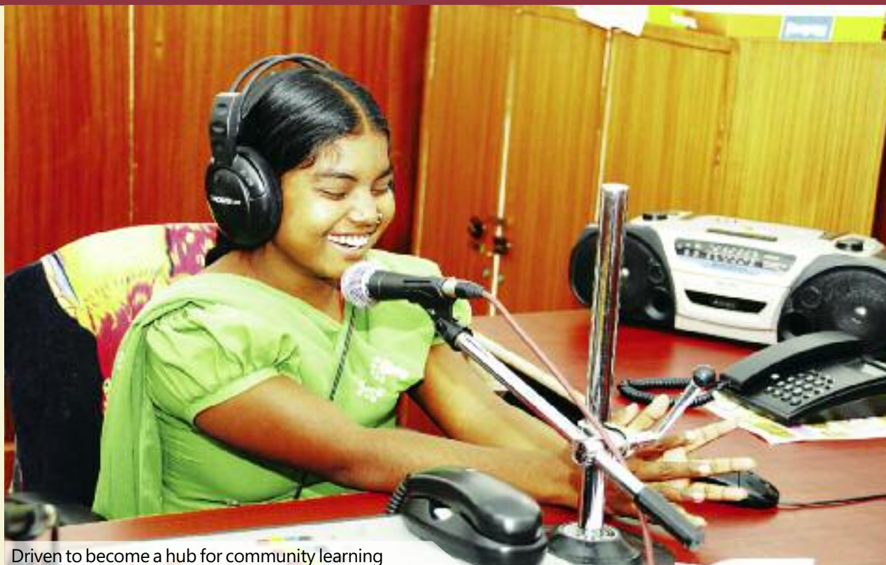
Driven to become a hub for community learning