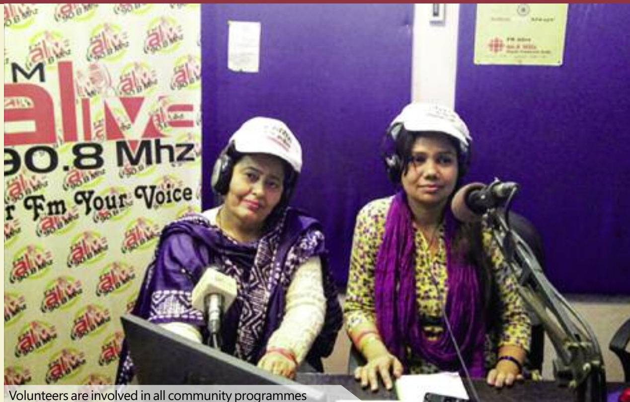
Volunteers are involved in all community programmes