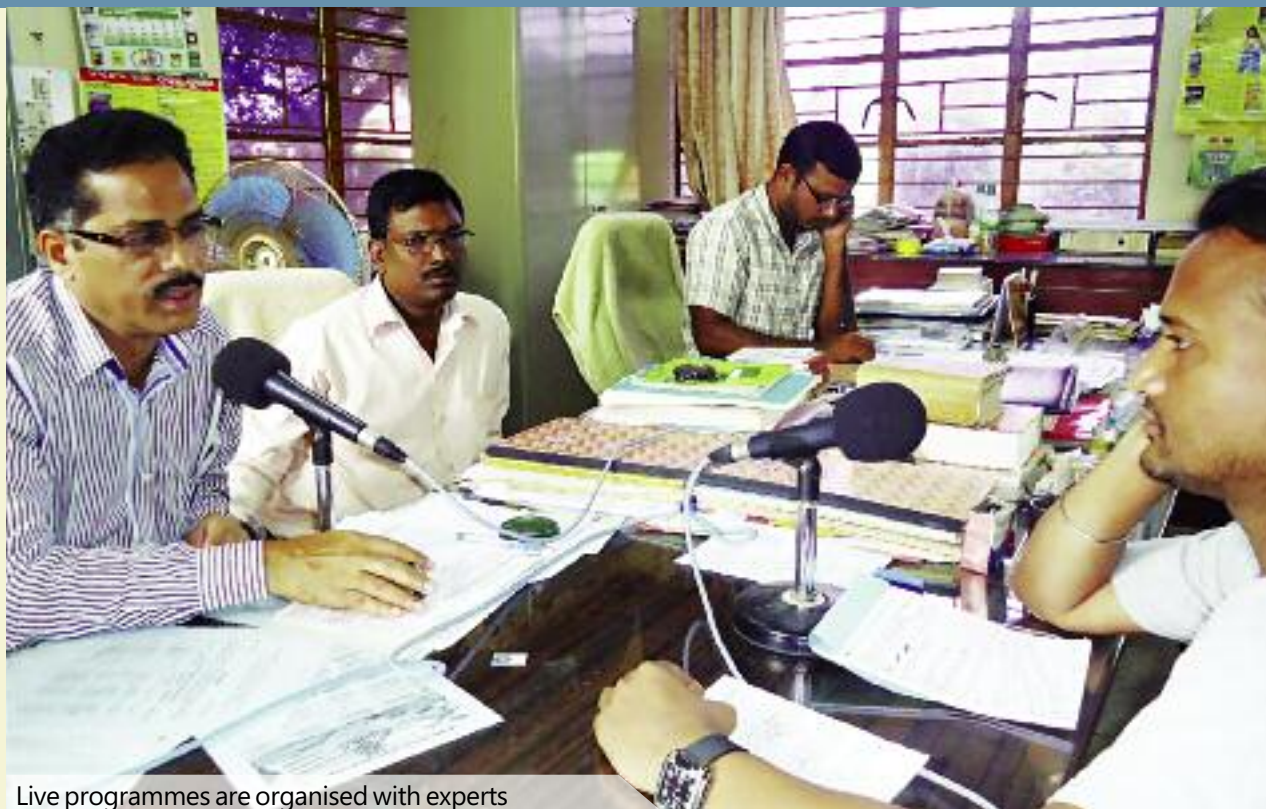
Live programmes are organised with experts