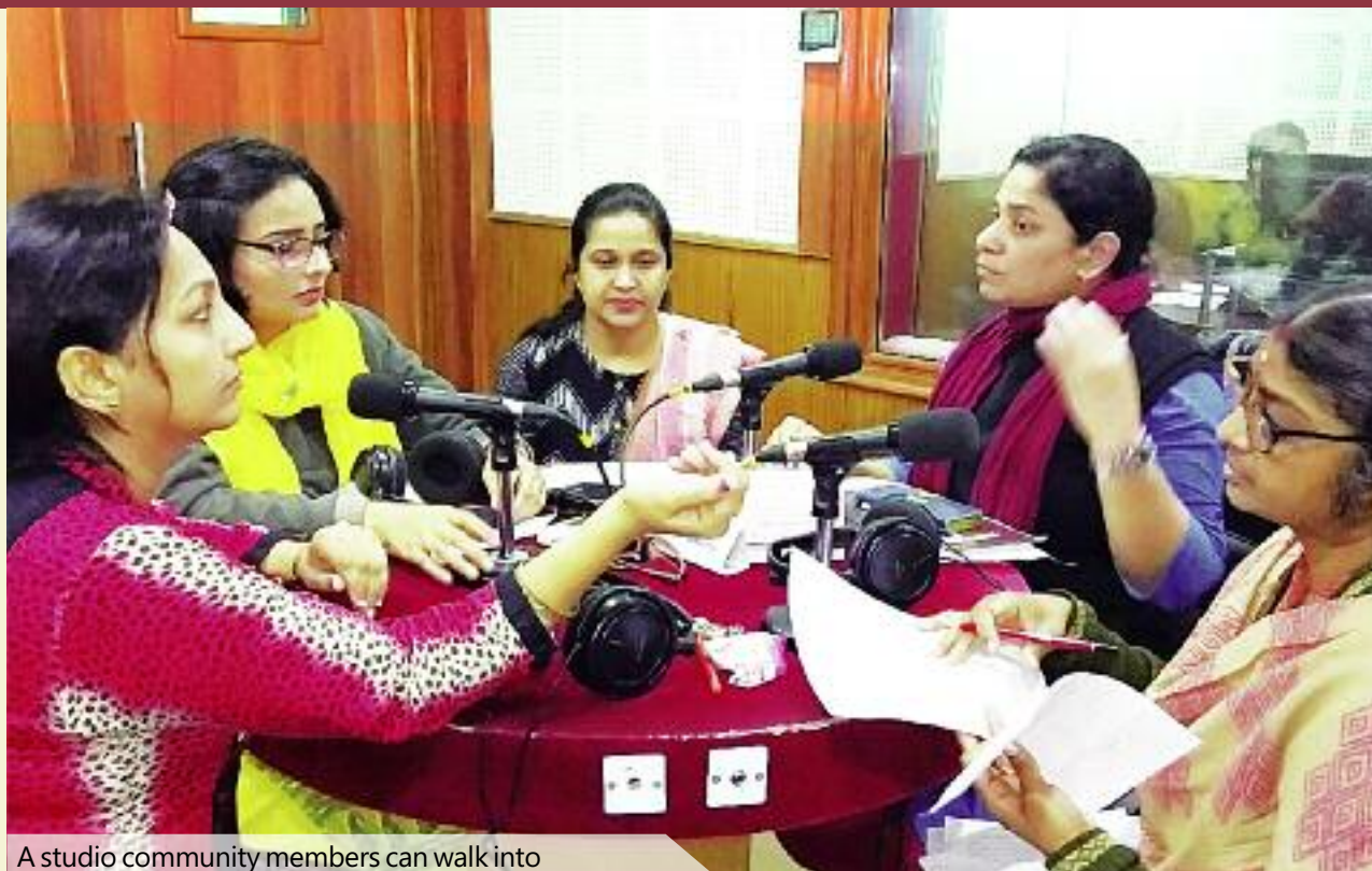
A studio community members can walk into