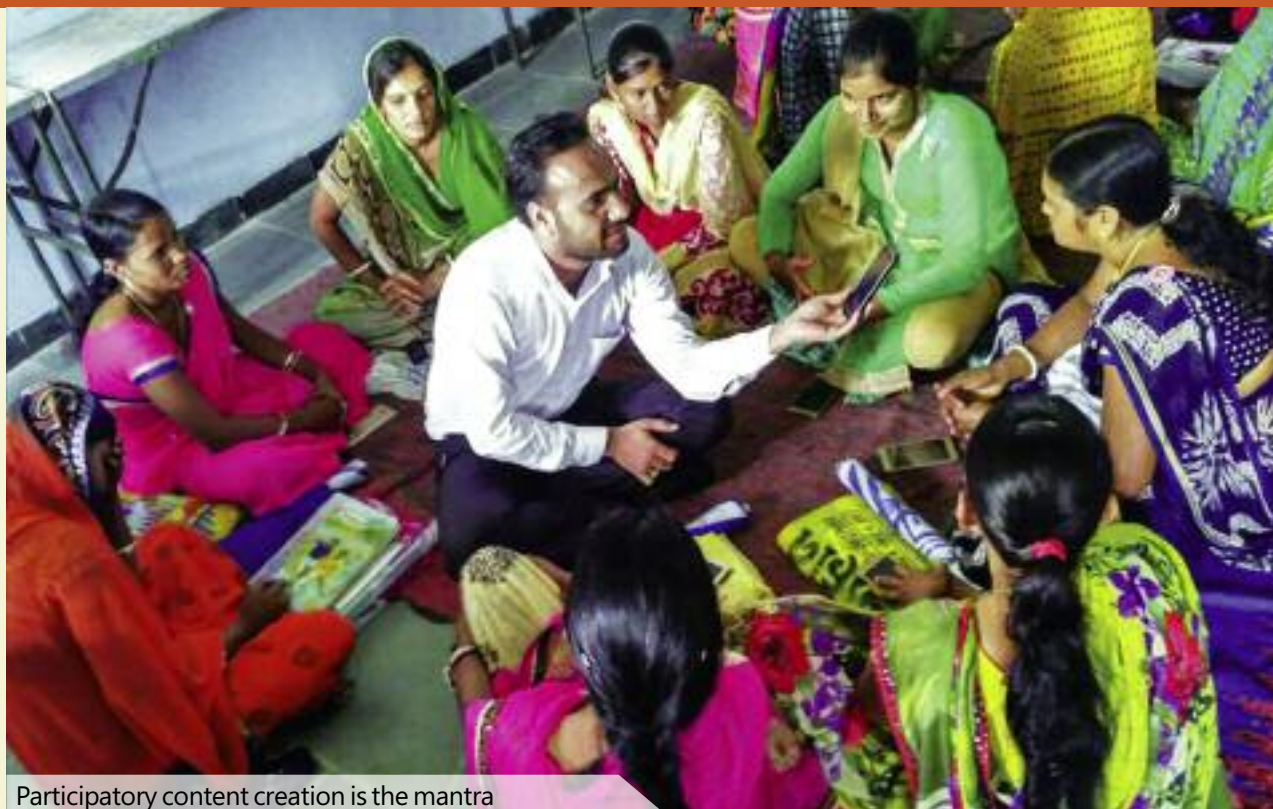
Participatory content creation is the mantra