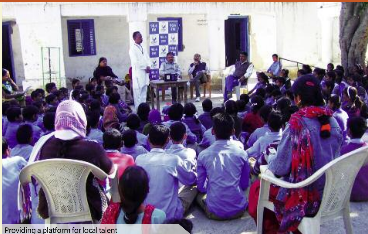
Providing a platform for local talent