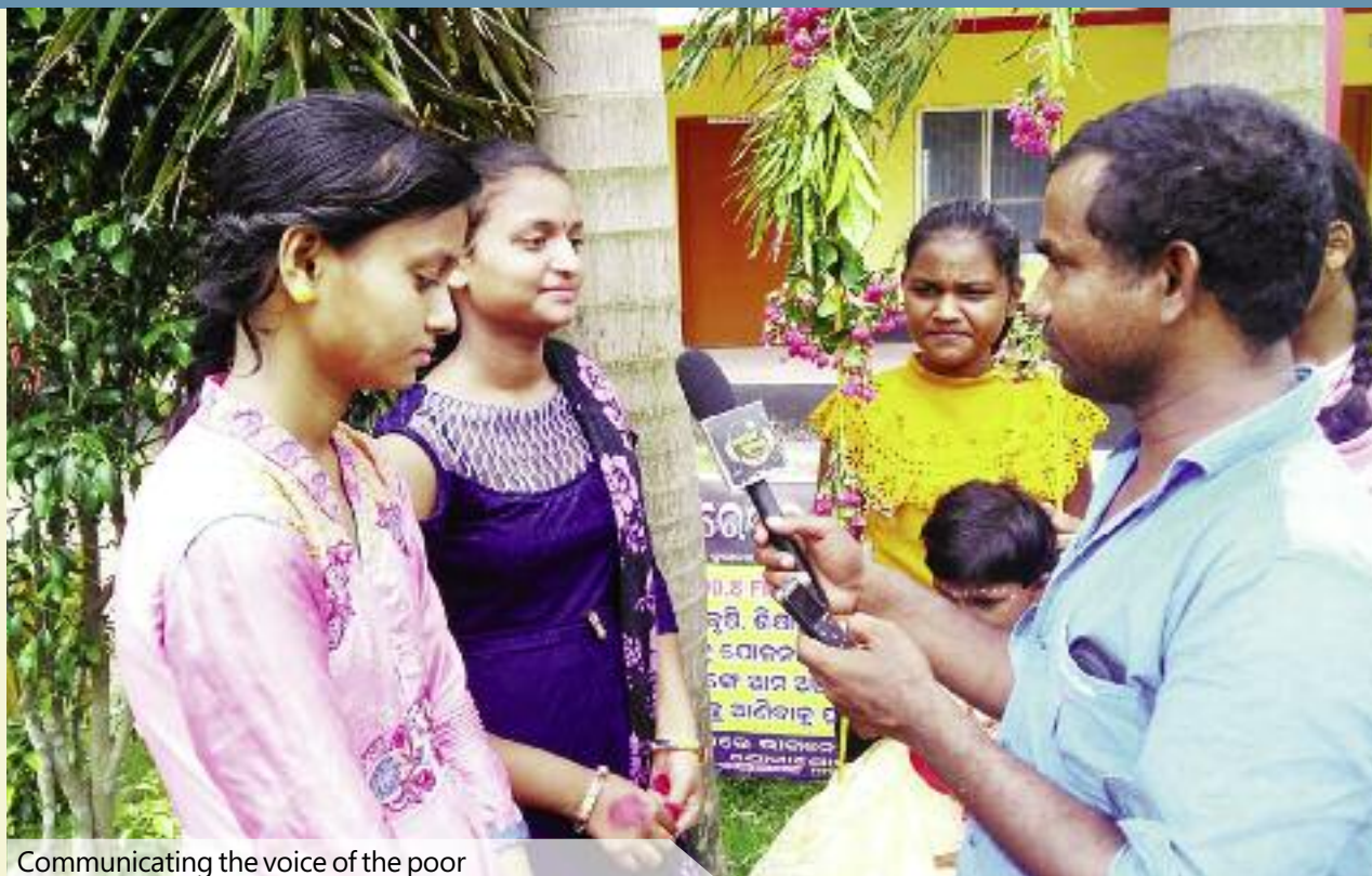
Communicating the voice of the poor