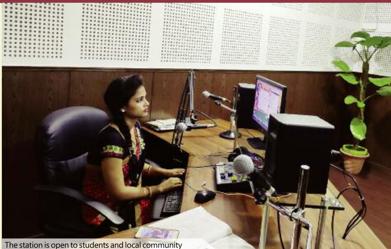
The station is open to students and local community