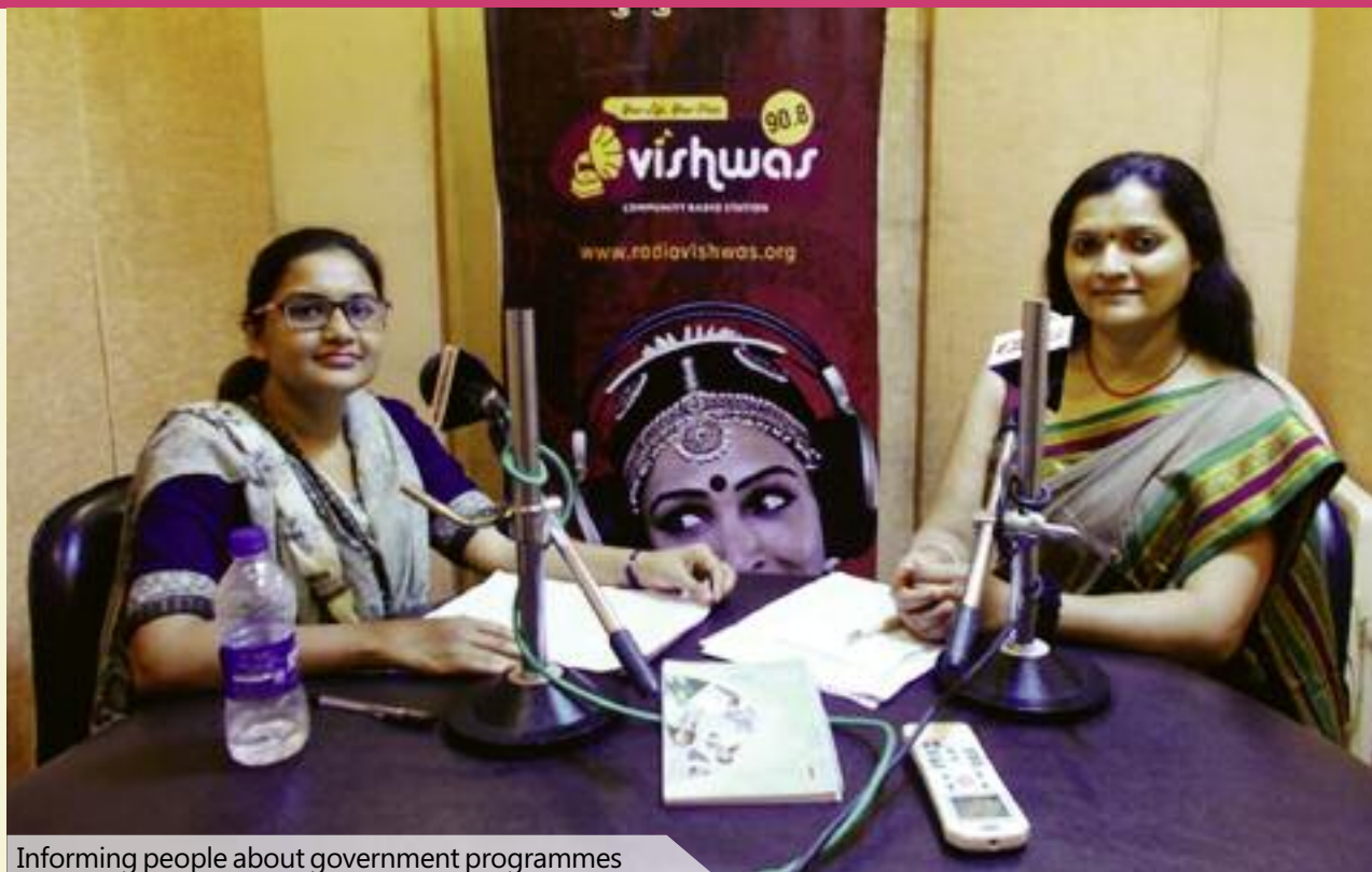
Informing people about government programmes