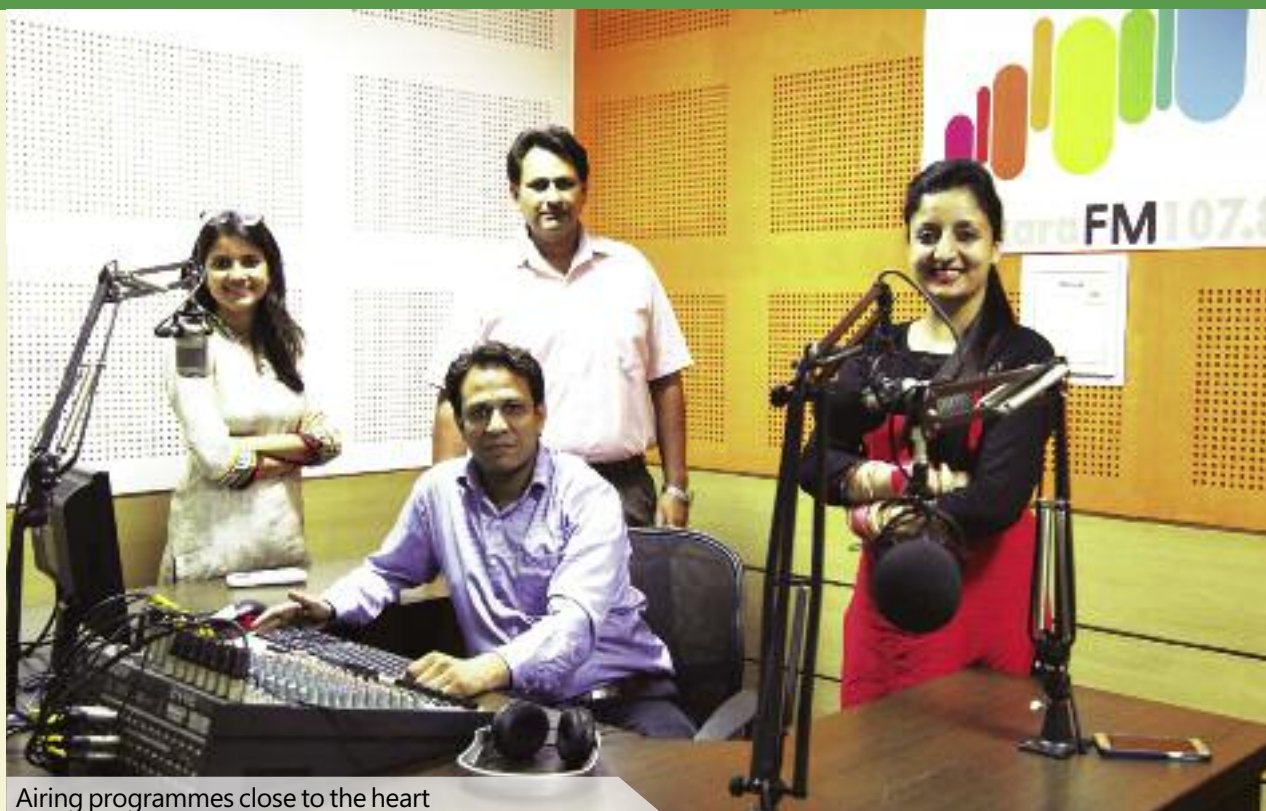
Airing programmes close to the heart