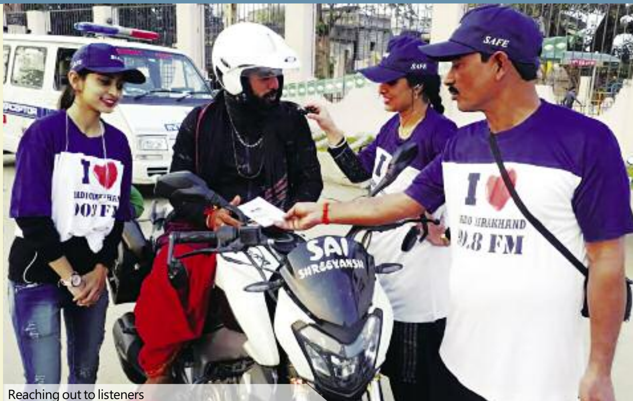
Reaching out to listeners