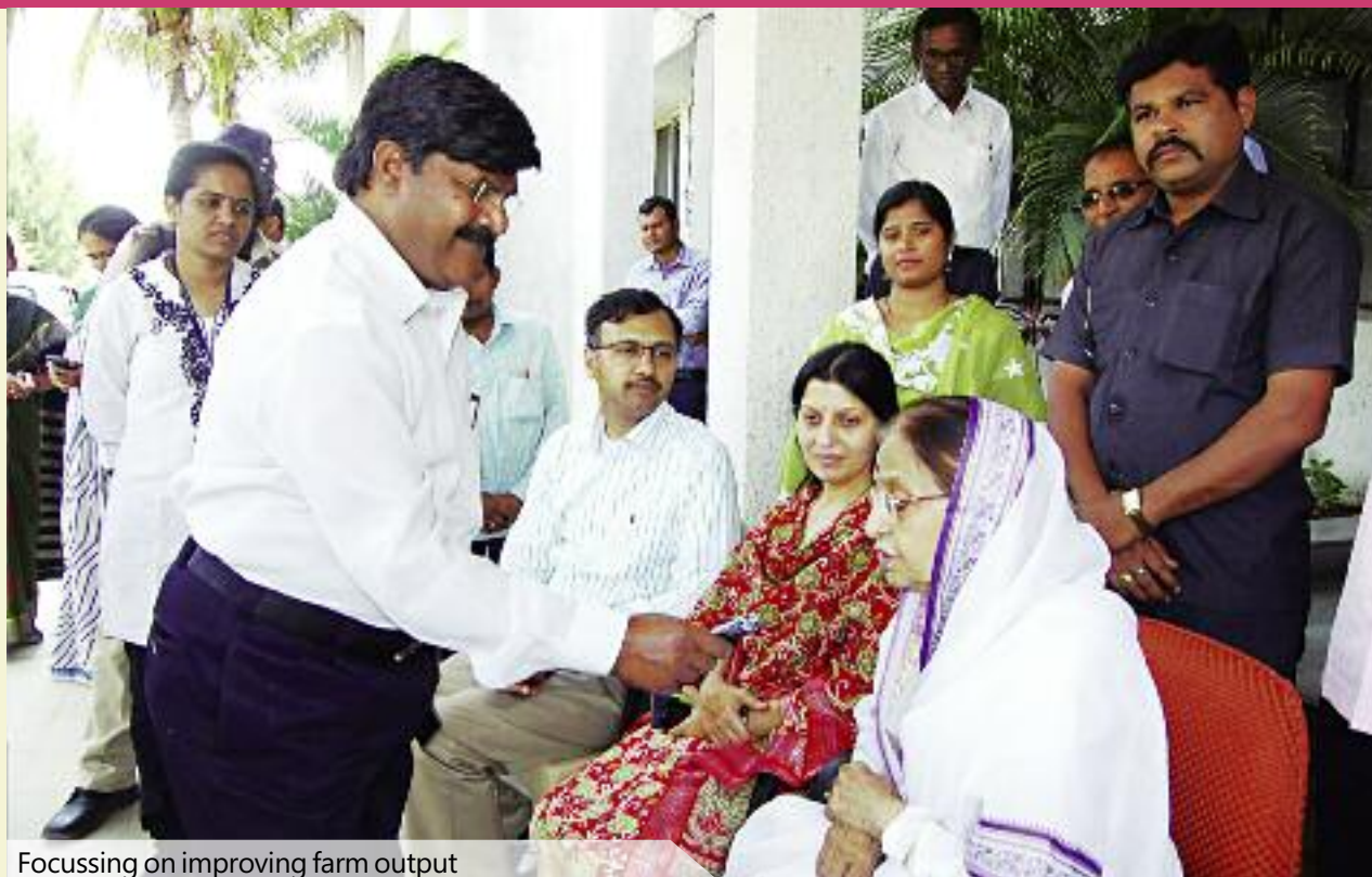
Focussing on improving farm output