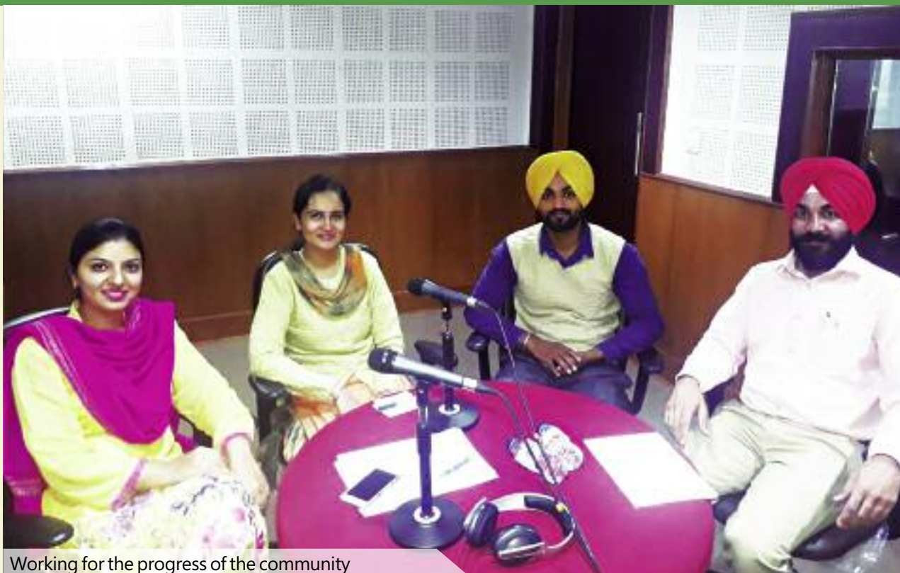
Working for the progress of the community