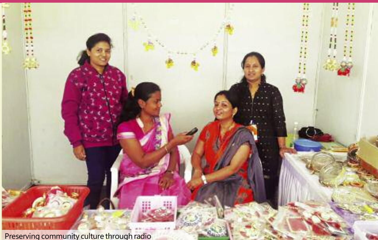
Preserving community culture through radio