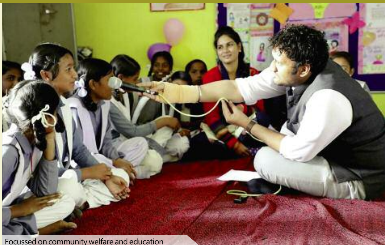
Focussed on community welfare and education