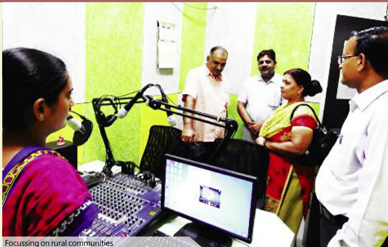
Focussing on rural communities