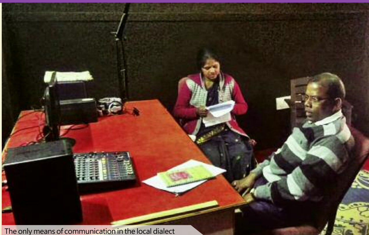
The only means of communication in the local dialect