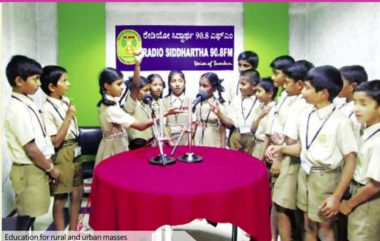
Education for rural and urban masses