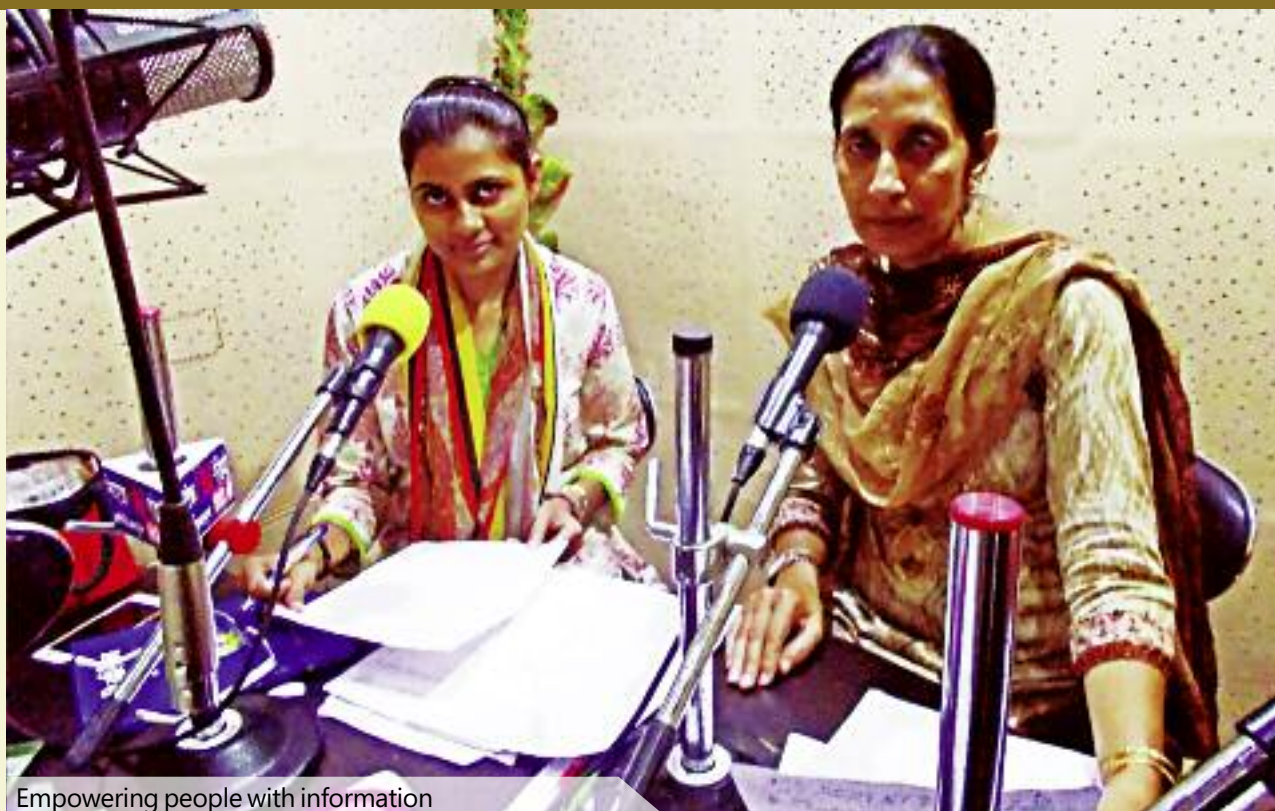
Empowering people with information