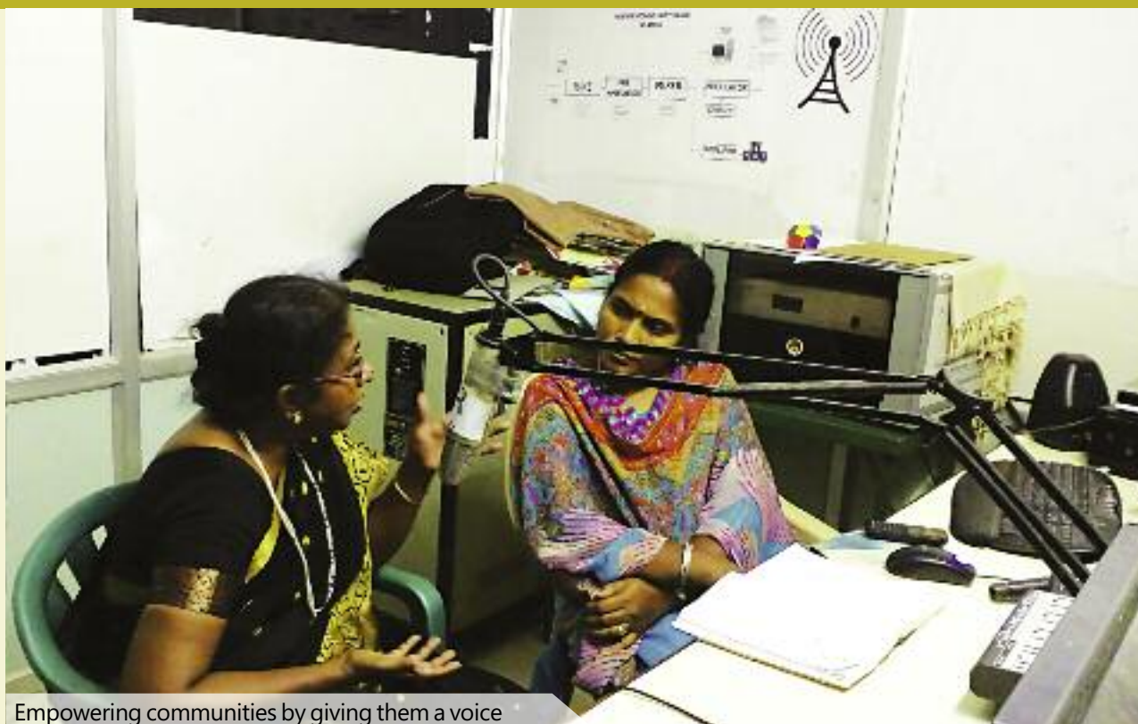
Empowering communities by giving them a voice