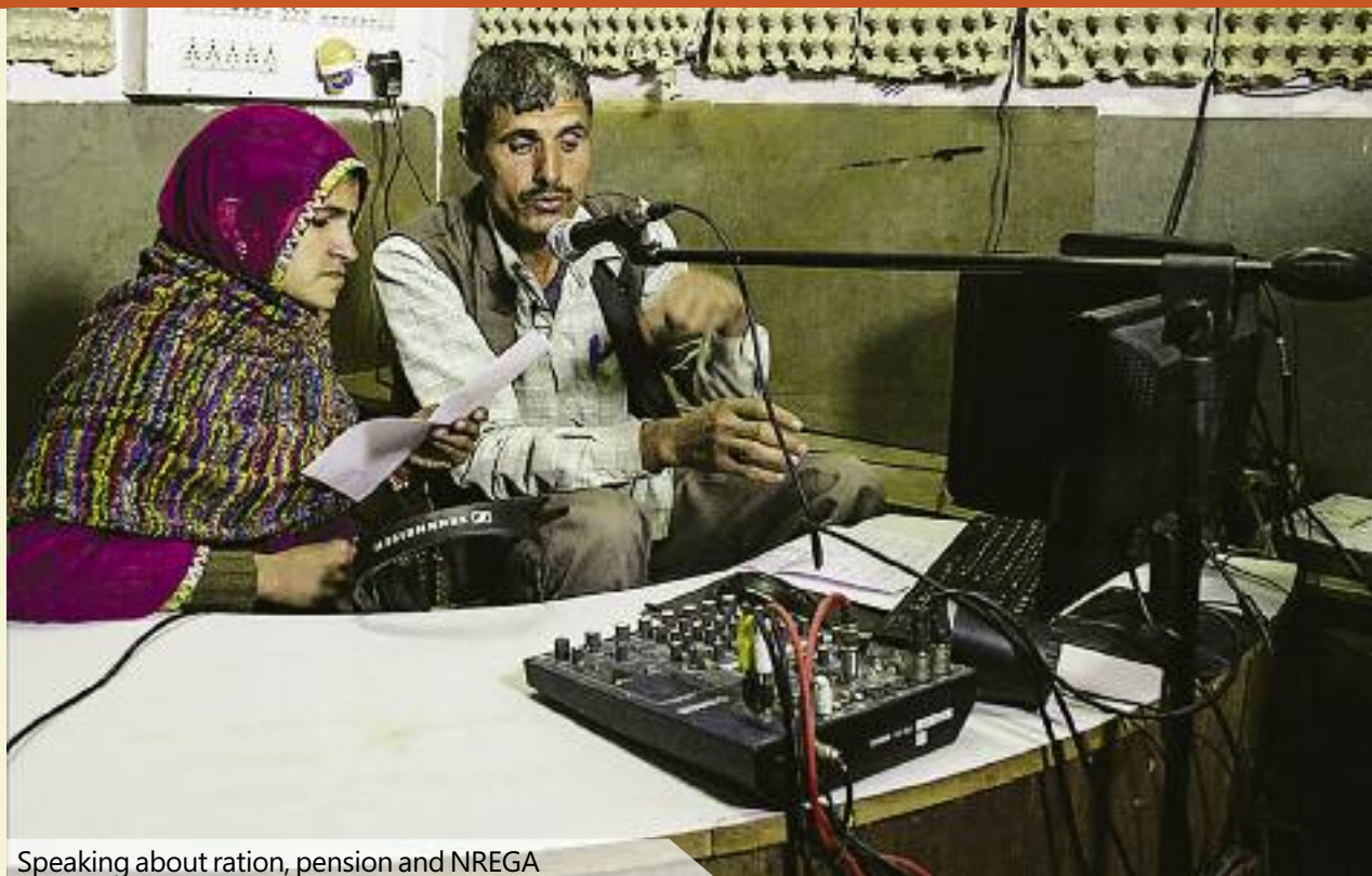
Speaking about ration, pension and NREGA