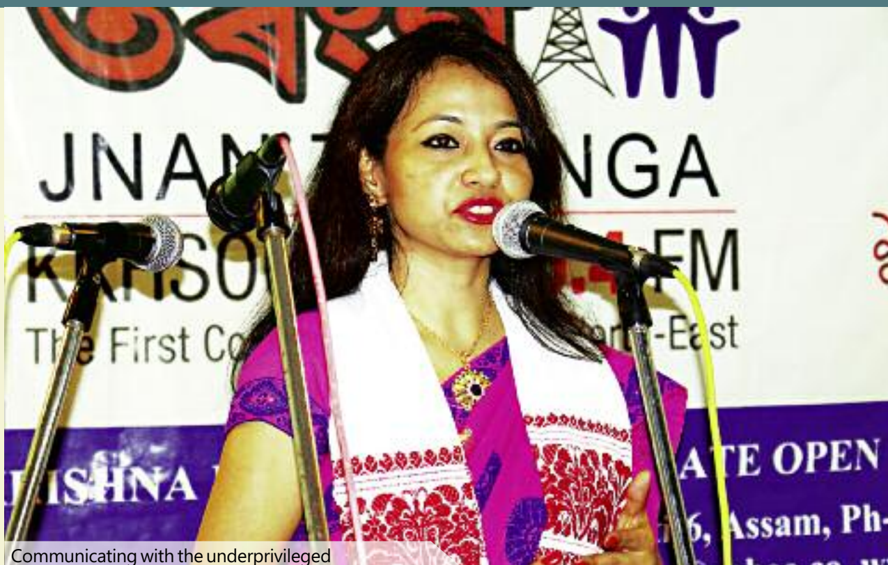
Communicating with the underprivileged