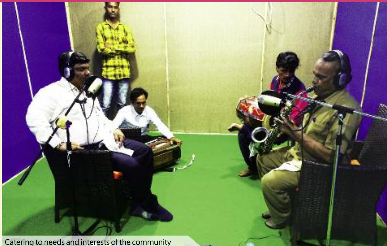
Catering to needs and interests of the community