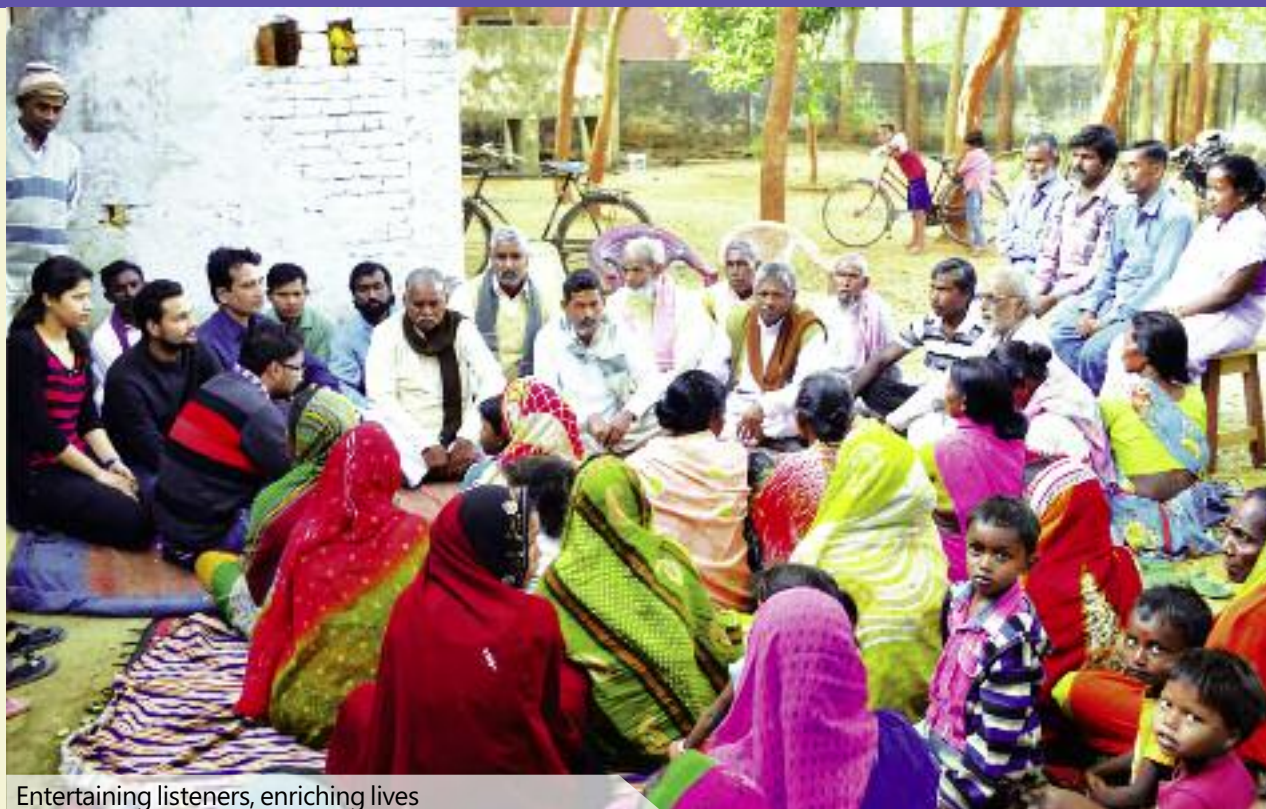
Entertaining listeners, enriching lives

Languages Hindi, English, Angika and Urdu