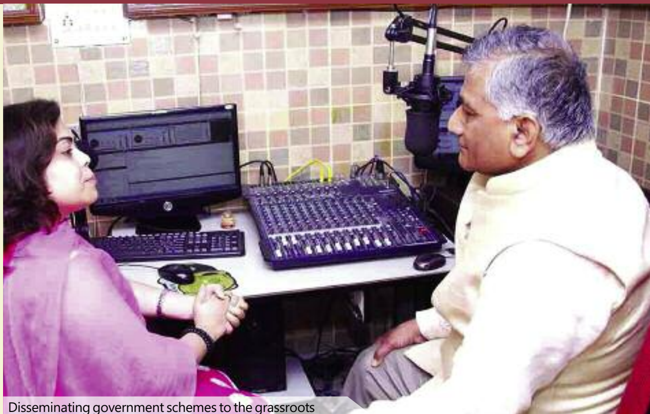
Disseminating government schemes to the grassroots