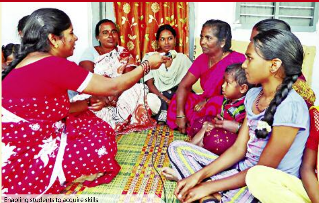
Enabling students to acquire skills