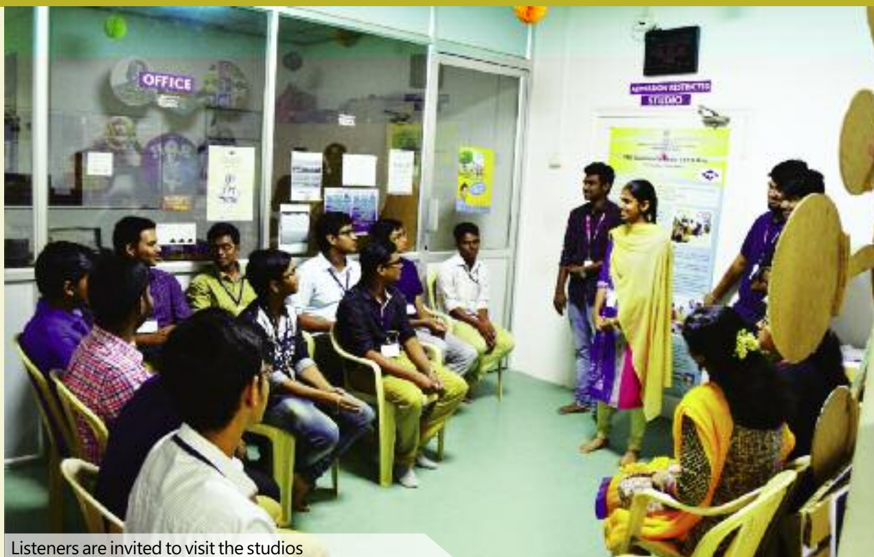
Listeners are invited to visit the studios