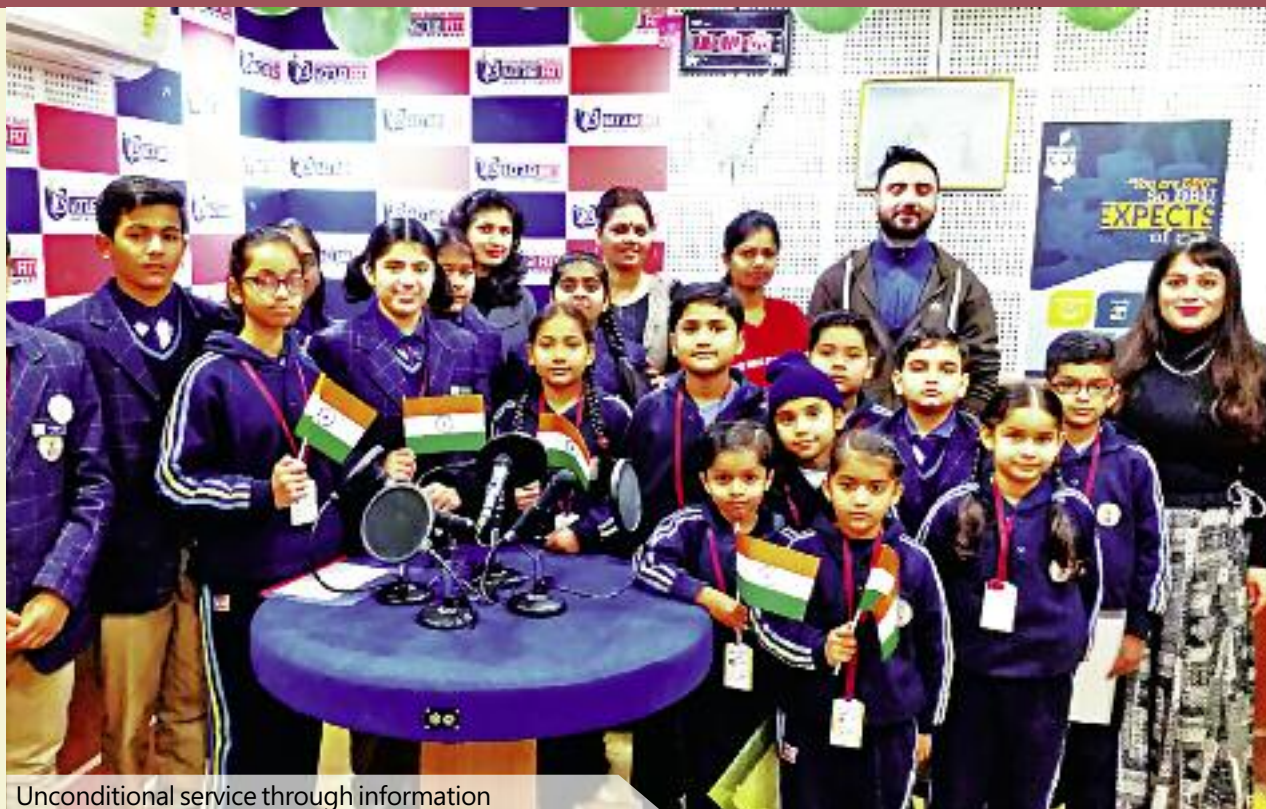
Unconditional service through information

Photo Courtesy: Desh Bhagat Community Radio