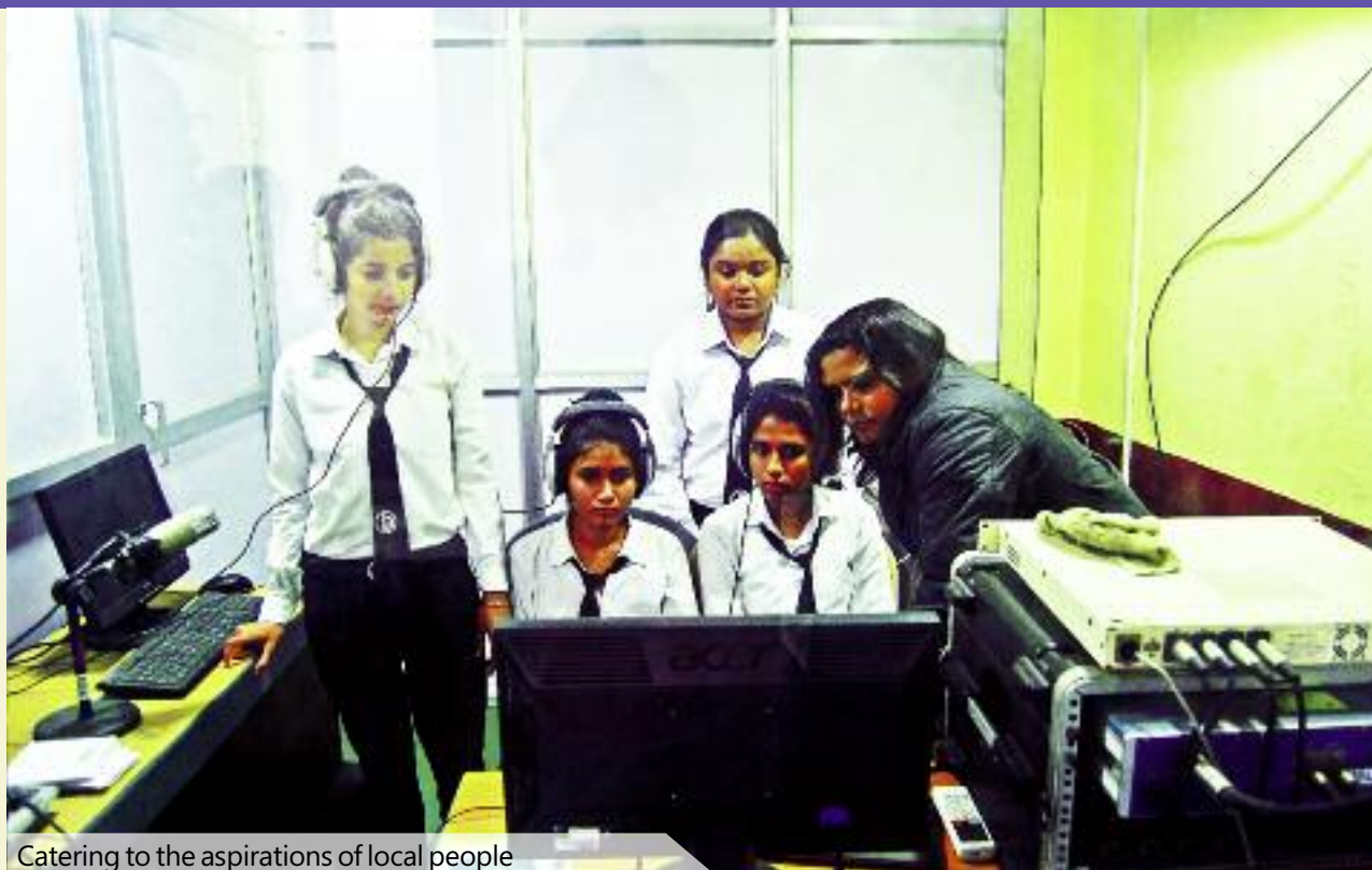
Catering to the aspirations of local people