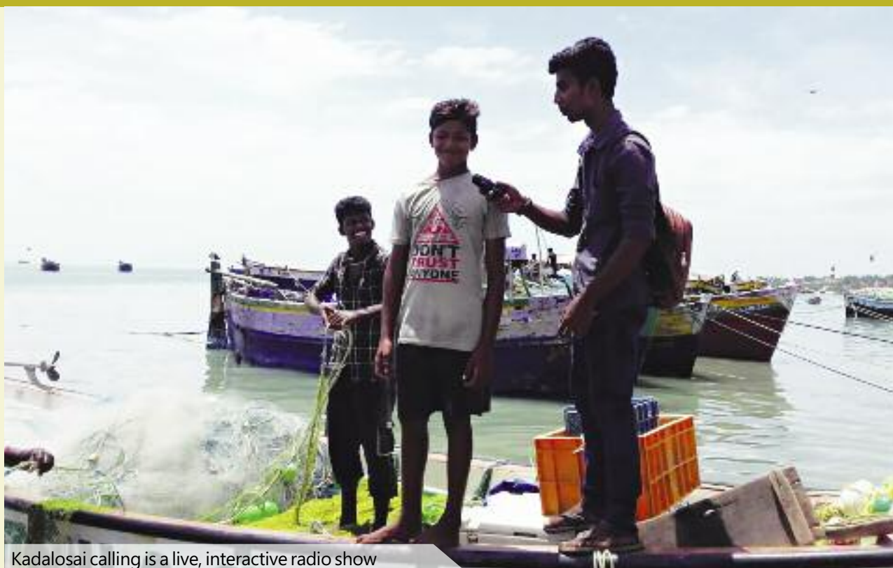
Kadalosai calling is a live, interactive radio show