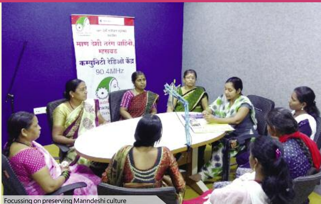
Focussing on preserving Manndeshi culture

Broadcast Hours Languages 8 hours Hindi and Marathi