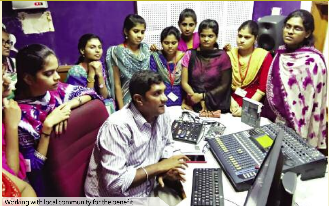
Working with local community for the benefit