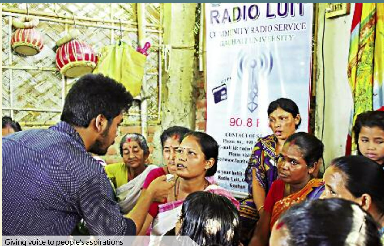
Giving voice to people's aspirations