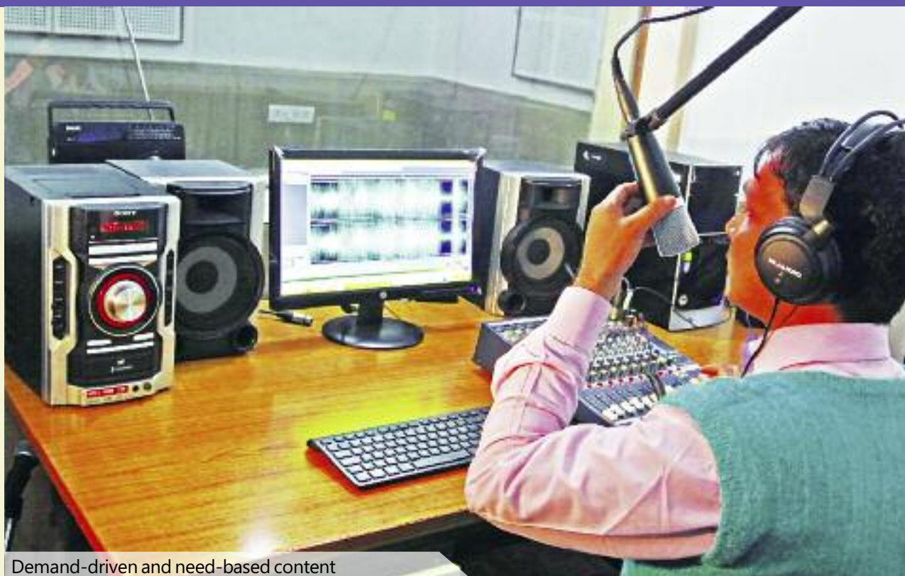
Demand-driven and need-based content