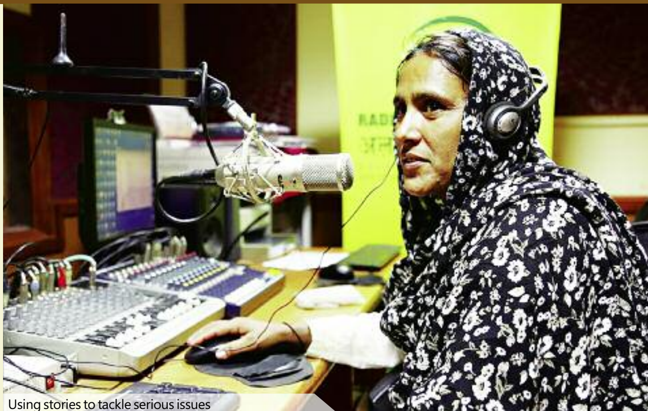
Using stories to tackle serious issues