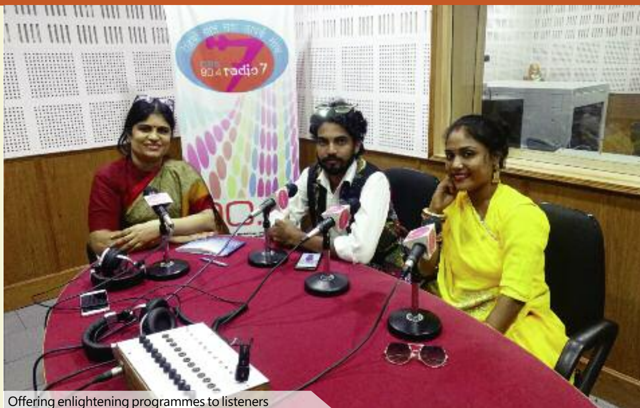
Offering enlightening programmes to listeners