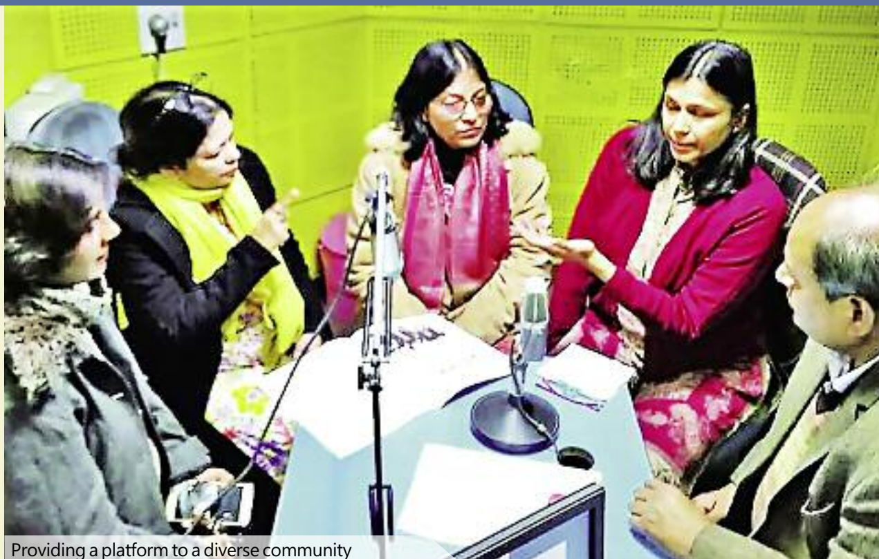
Providing a platform to a diverse community