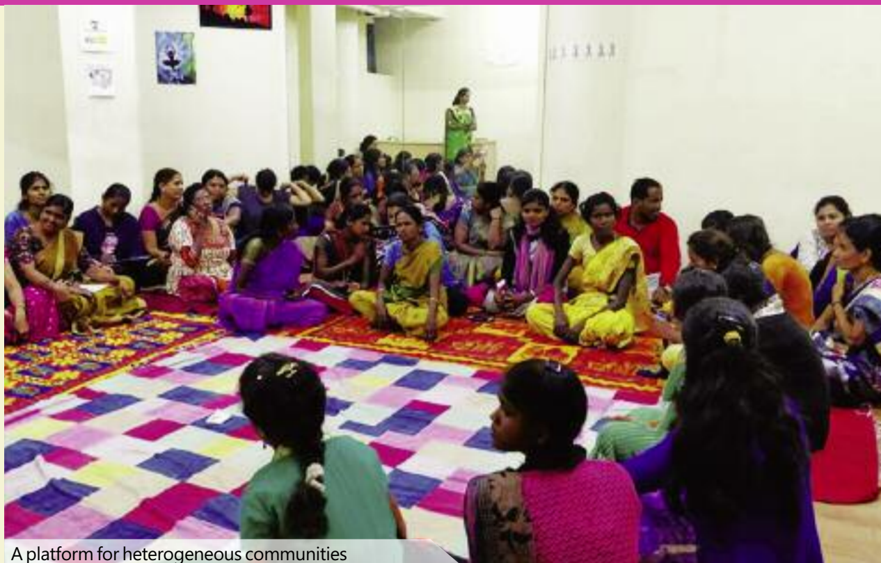
A platform for heterogeneous communities