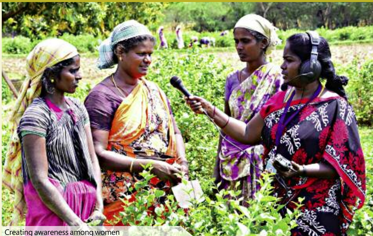
Creating awareness among women