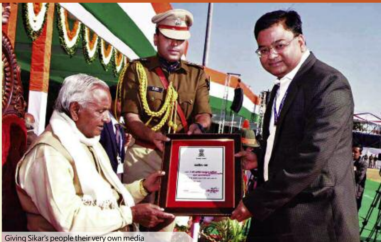
Giving Sikar's people their very own media