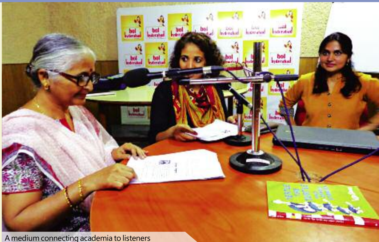
A medium connecting academia to listeners