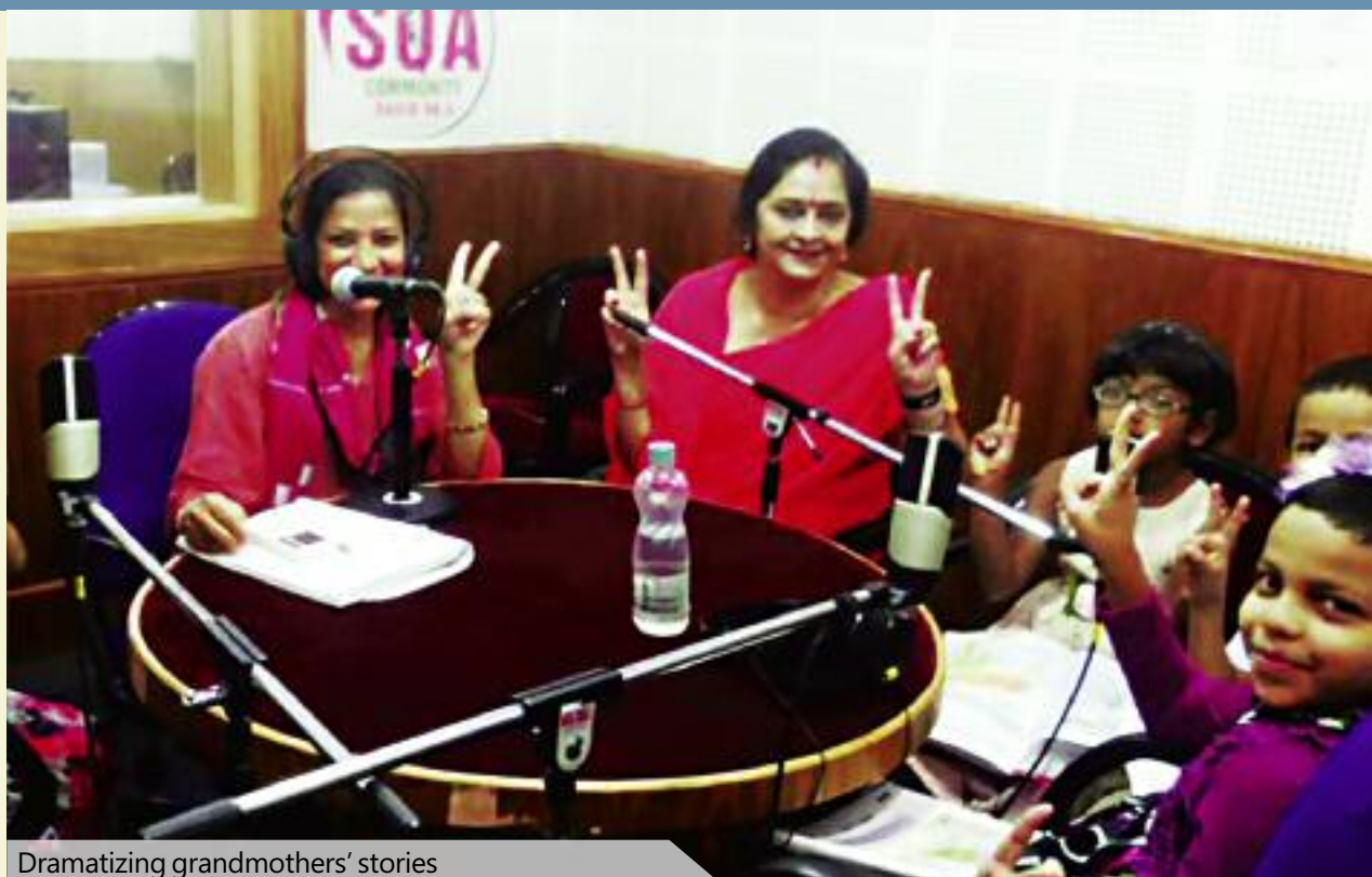
Dramatizing grandmothers' stories