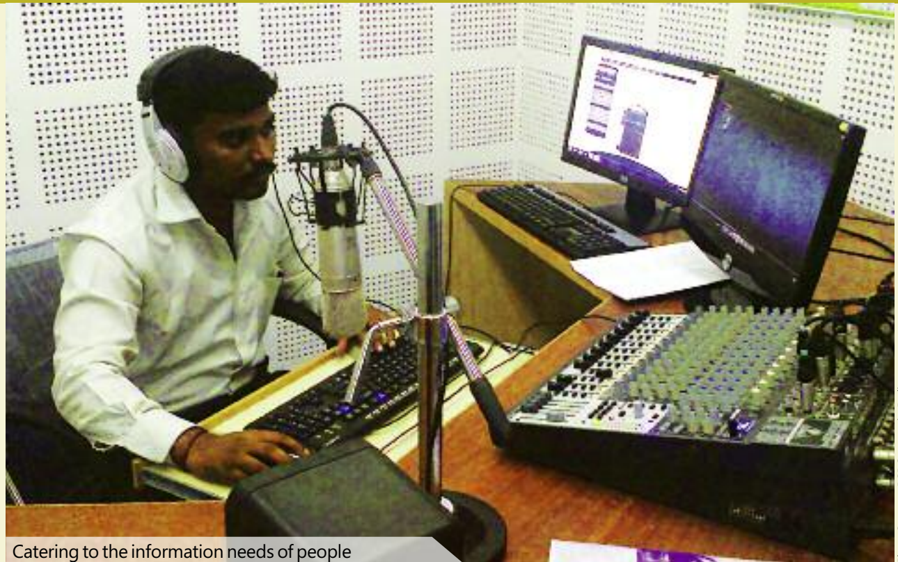
Catering to the information needs of people