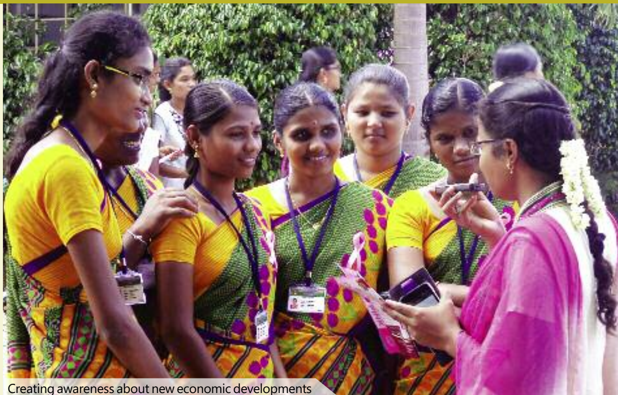
Creating awareness about new economic developments

Broadcast Hours Languages 17 hours Tamil and Saurashtra