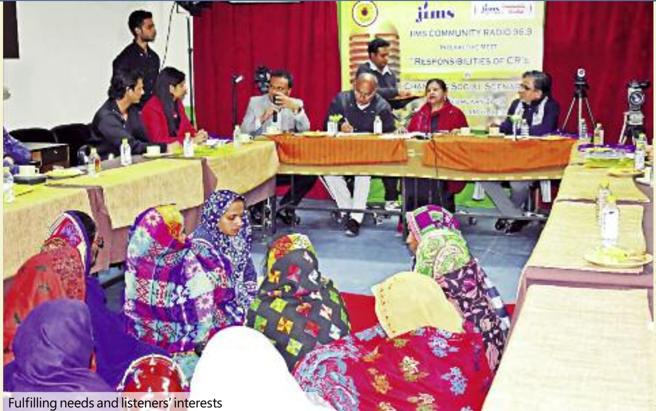
Fulfilling needs and listeners' interests

Hindi (Hindustani), English, Haryanvi and Punjabi