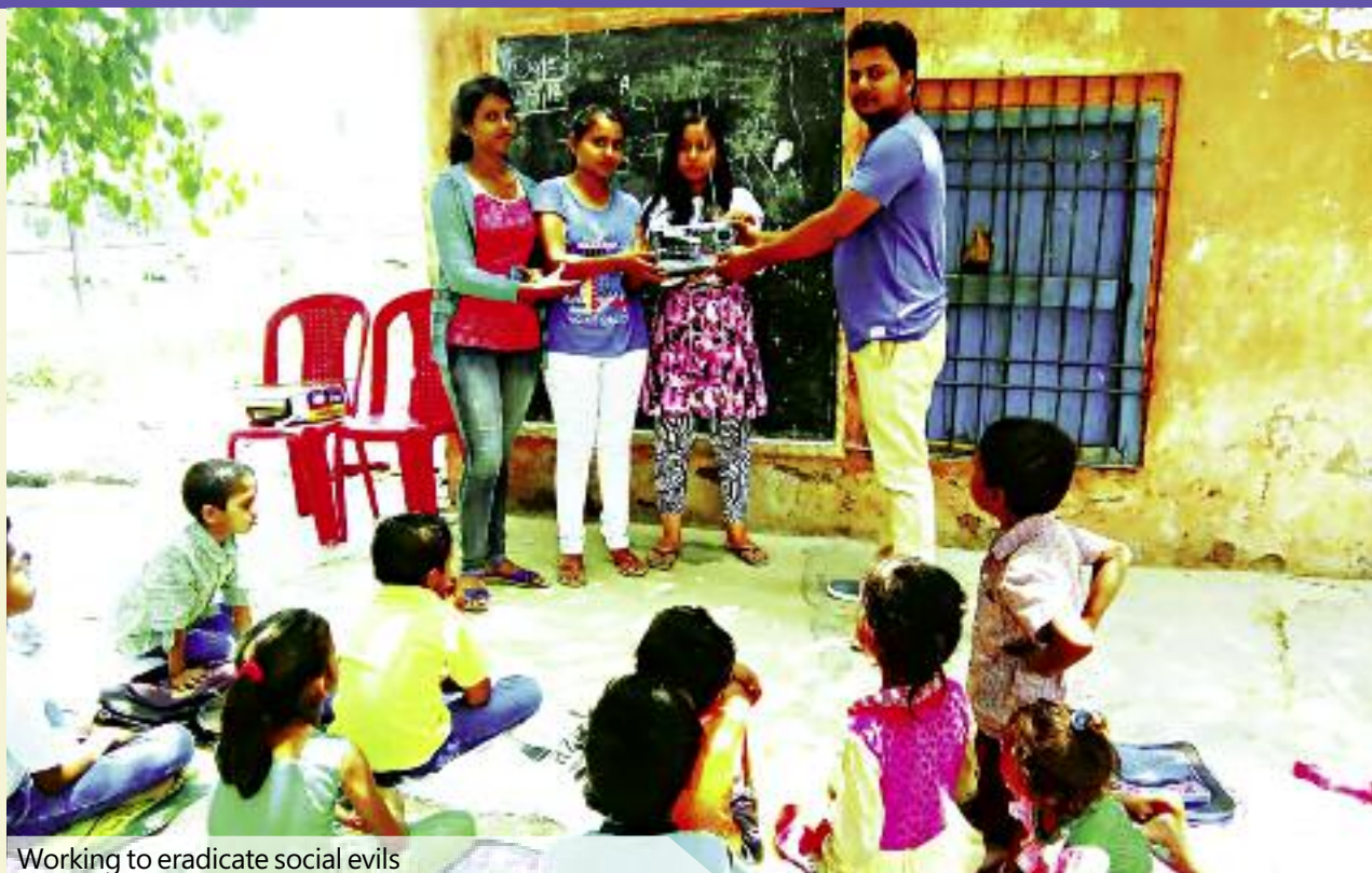
Working to eradicate social evils