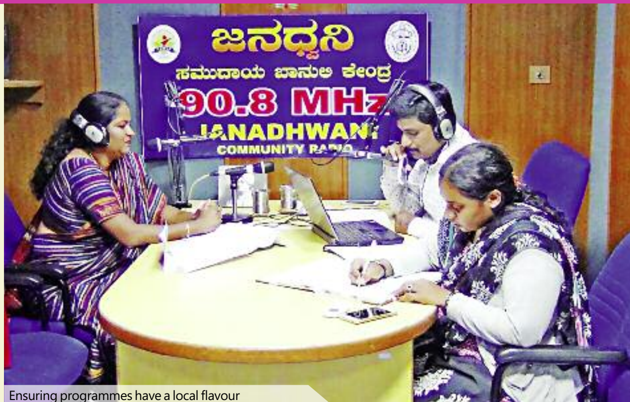
Ensuring programmes have a local flavour