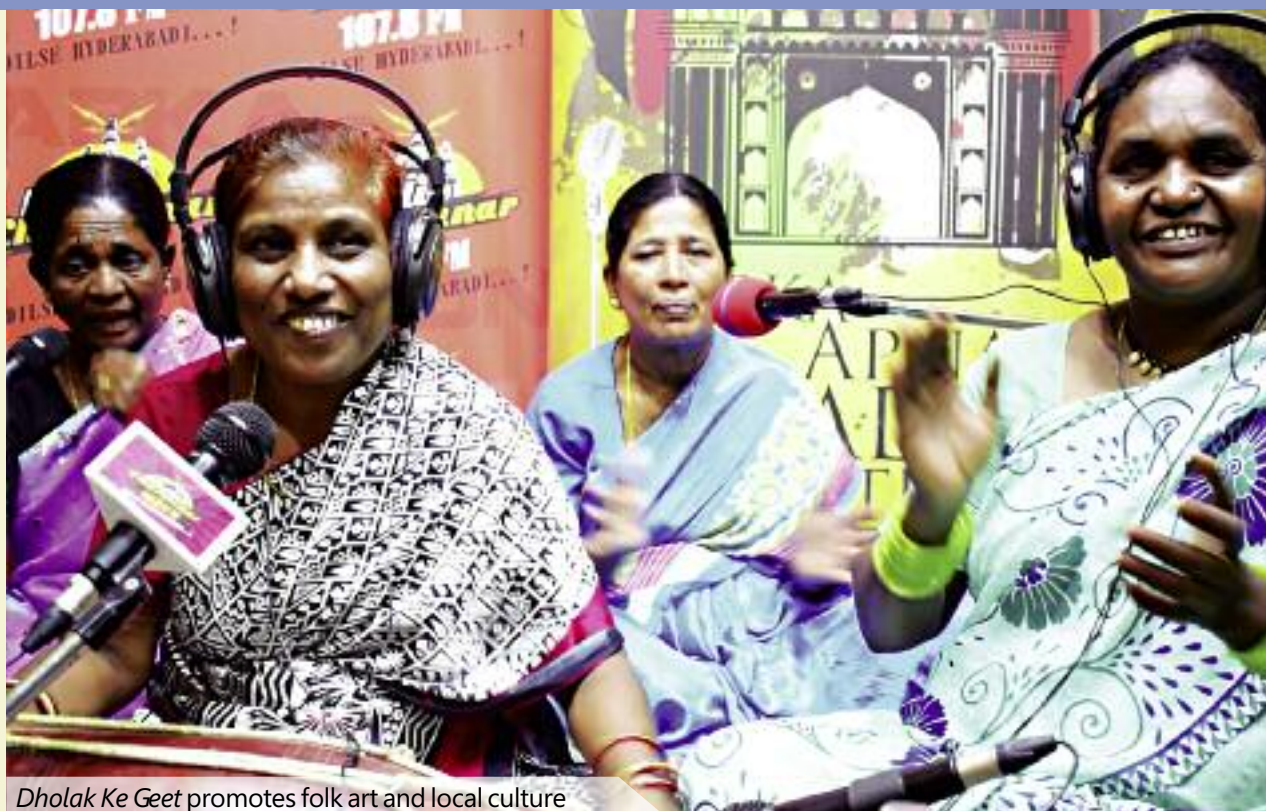
Dholak Ke Geet promotes folk art and local culture