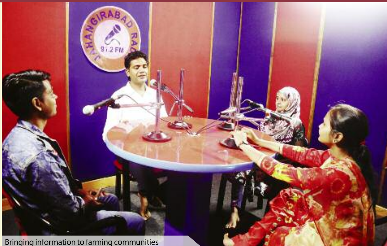
Bringing information to farming communities

Broadcast Hours Languages 6 hours Hindi, English and local dialects.