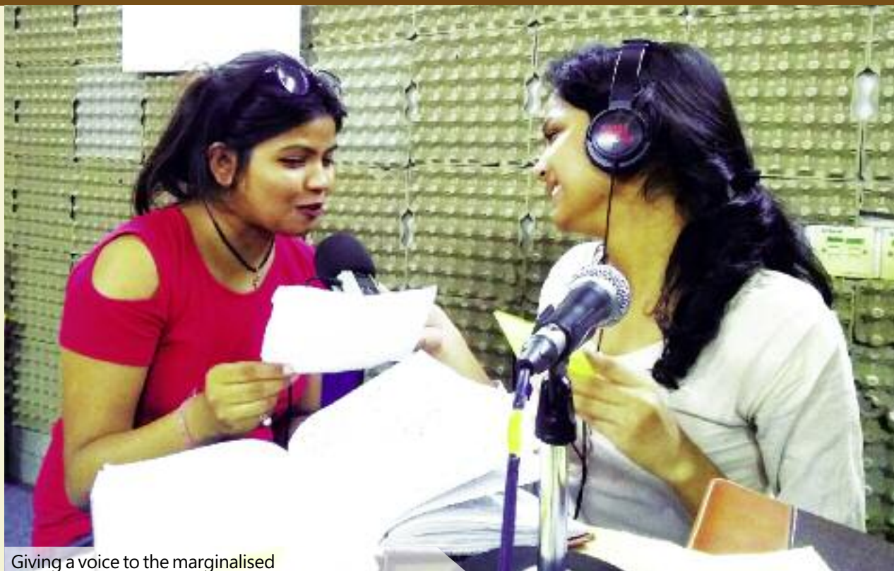
Giving a voice to the marginalised