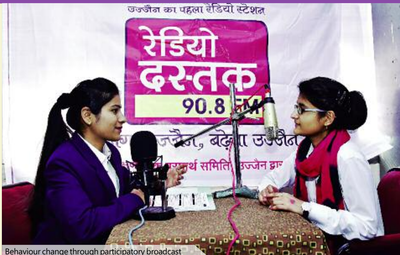
Behaviour change through participatory broadcast