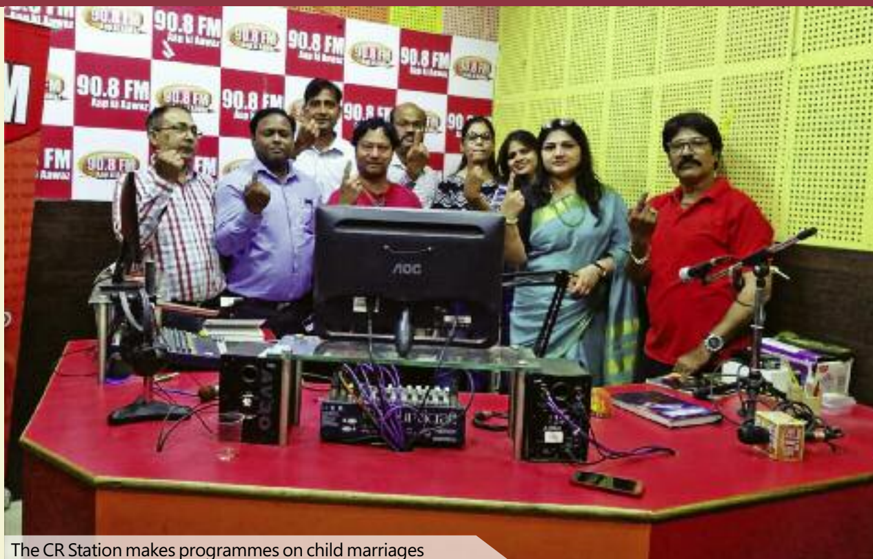
The CR Station makes programmes on child marriages