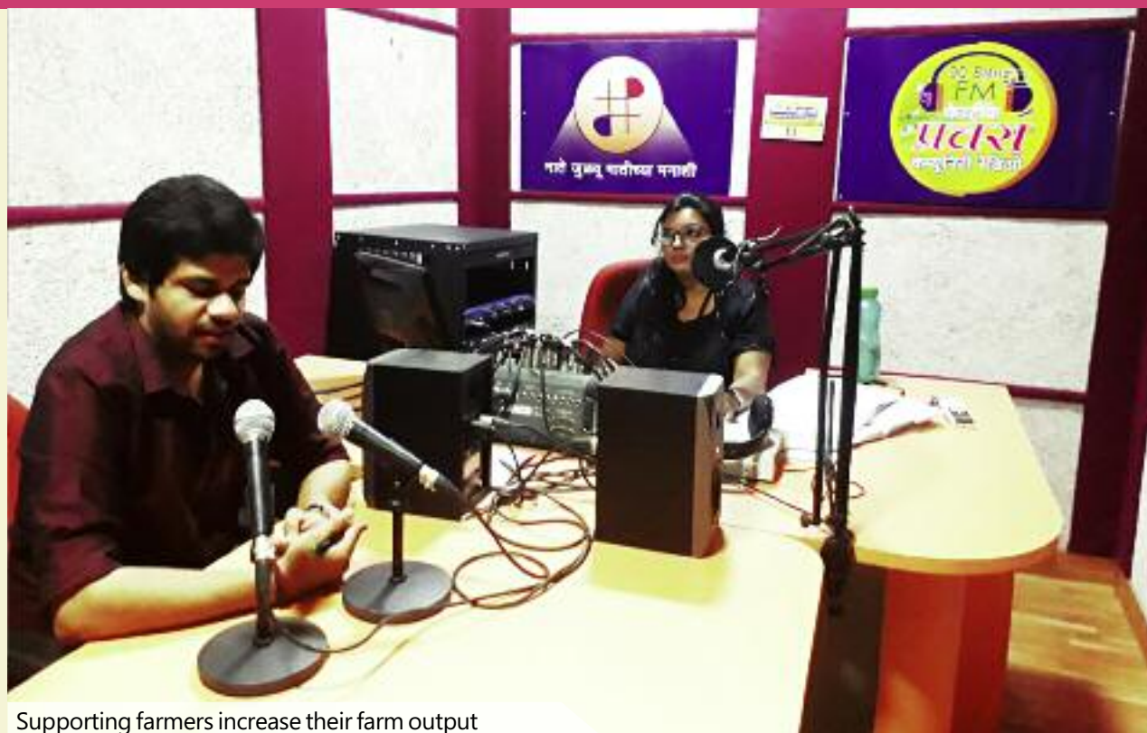
Supporting farmers increase their farm output