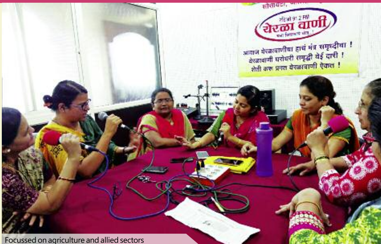
Focused on agriculture and allied sectors