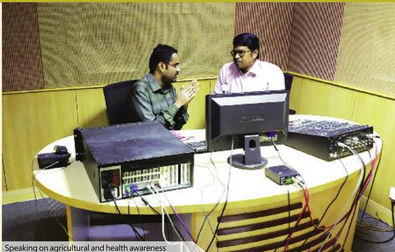
Speaking on agricultural and health awareness

Broadcast Hours Languages 10 hours Tamil and English