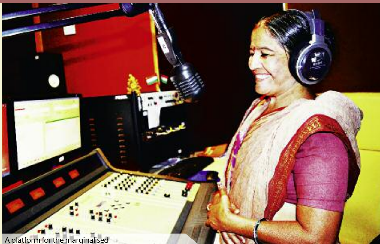
A platform for the marginalised