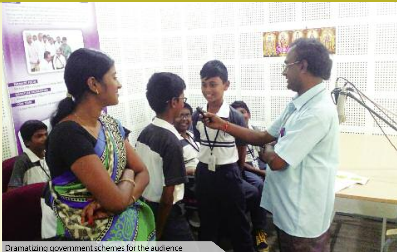
Dramatizing government schemes for the audience