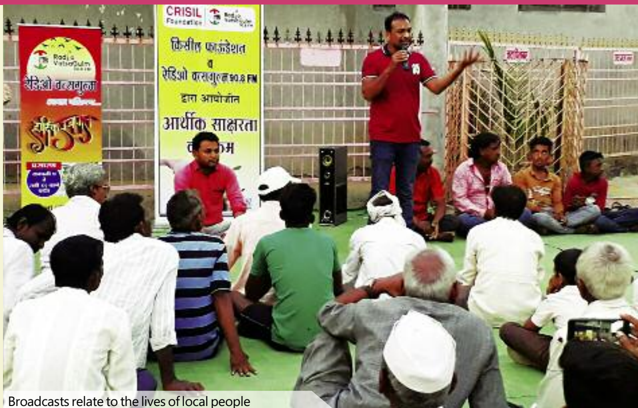
Broadcasts relate to the lives of local people