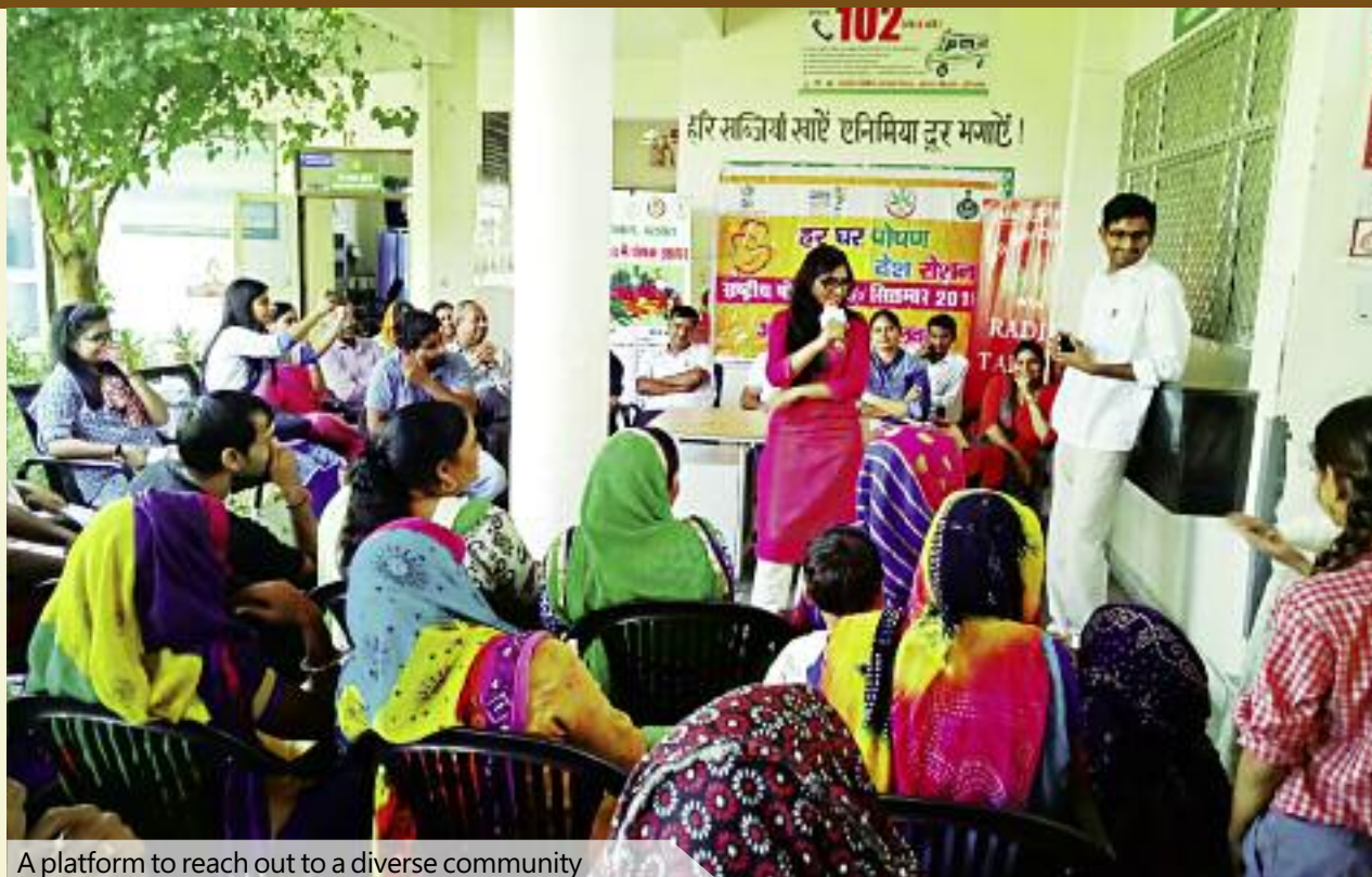
A platform to reach out to a diverse community