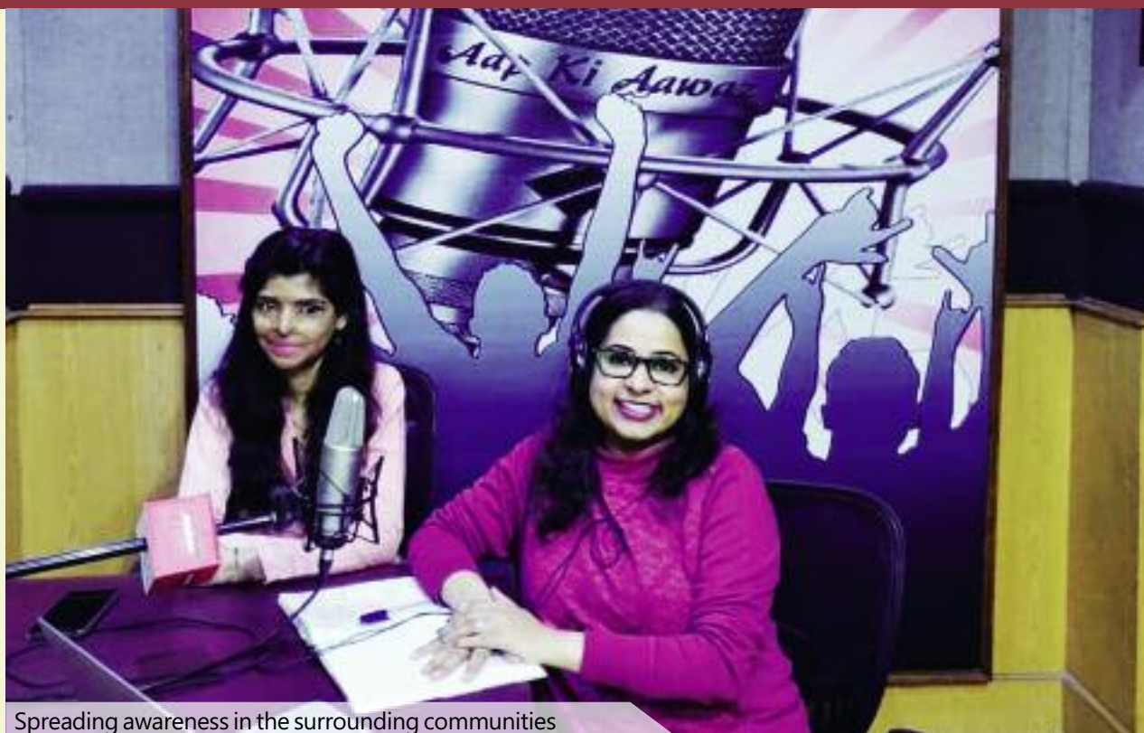
Spreading awareness in the surrounding communities