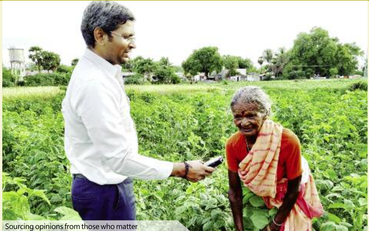
Sourcing opinions from those who matter