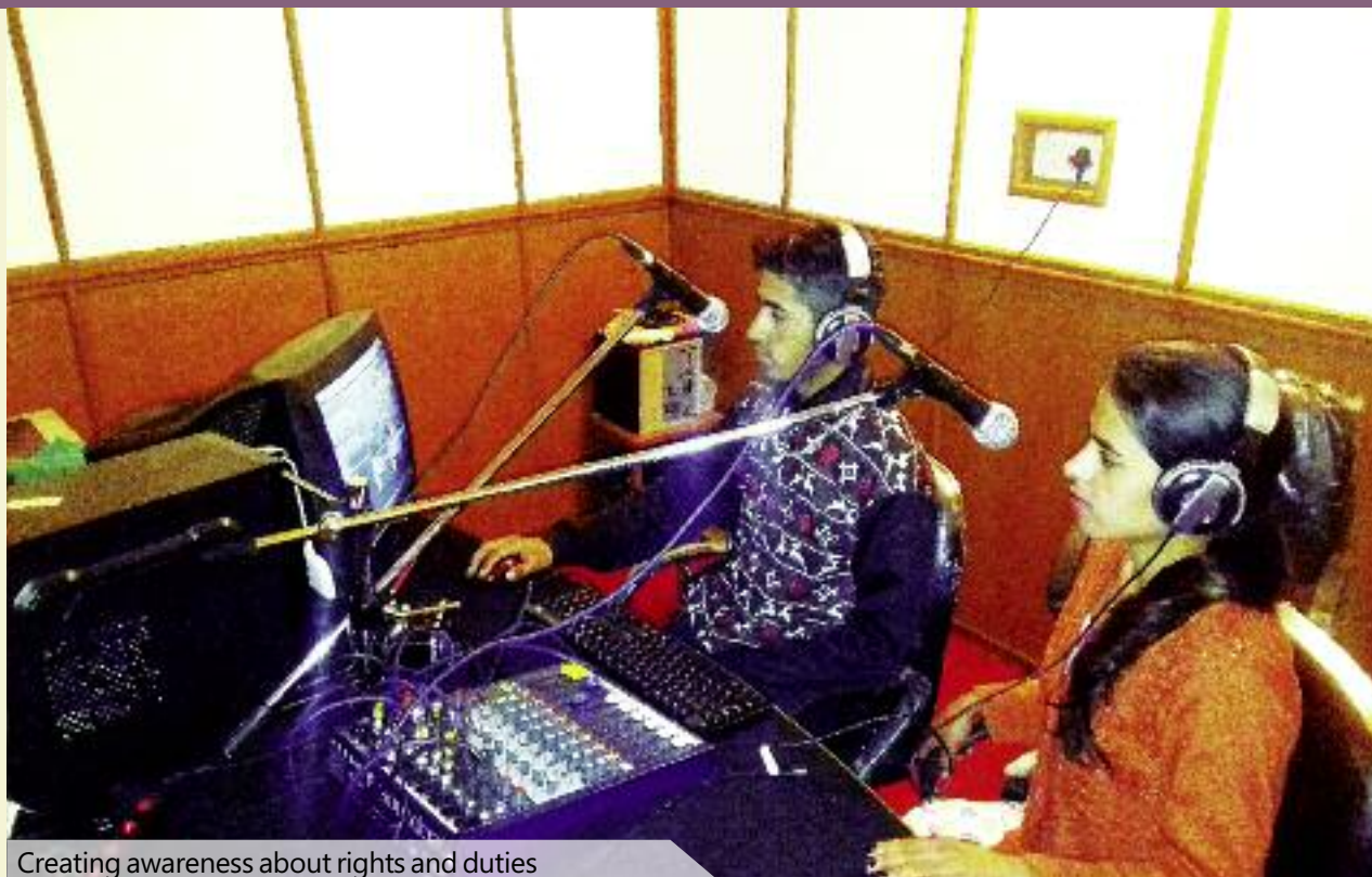
Creating awareness about rights and duties

Broadcast Hours Languages 10 hours Hindi and Pahari