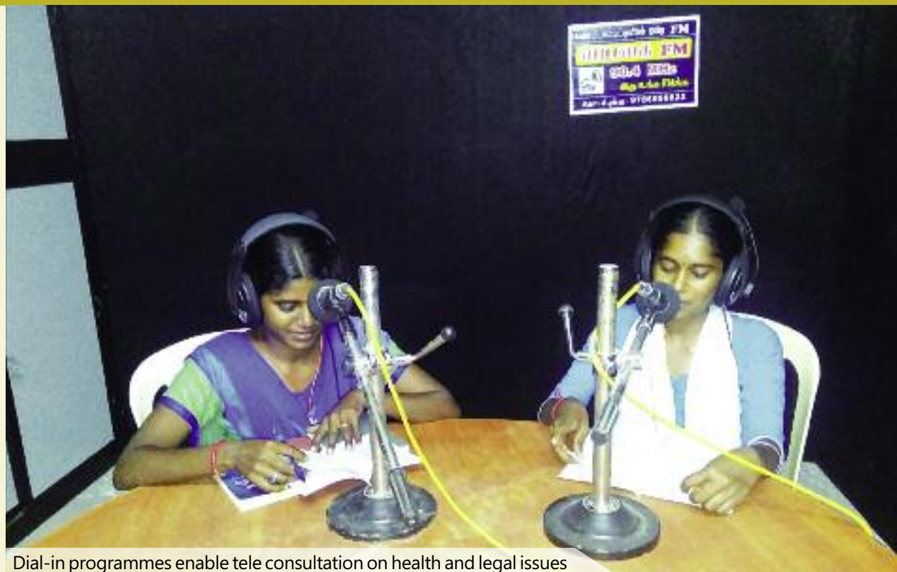
Dial-in programmes enable tele consultation on health and legal issues