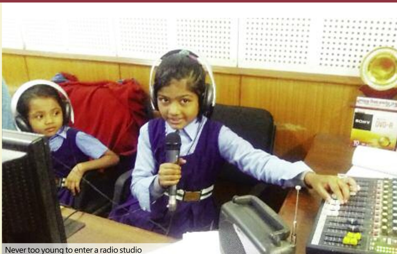
Never too young to enter a radio studio

Broadcast Hours Languages 10 hours Hindi, Urdu and Bhojpuri