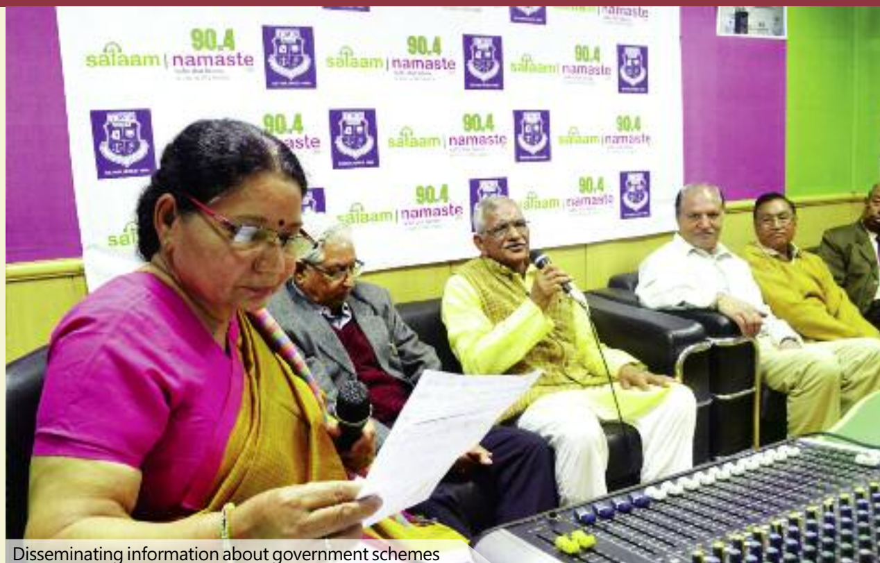
Disseminating information about government schemes