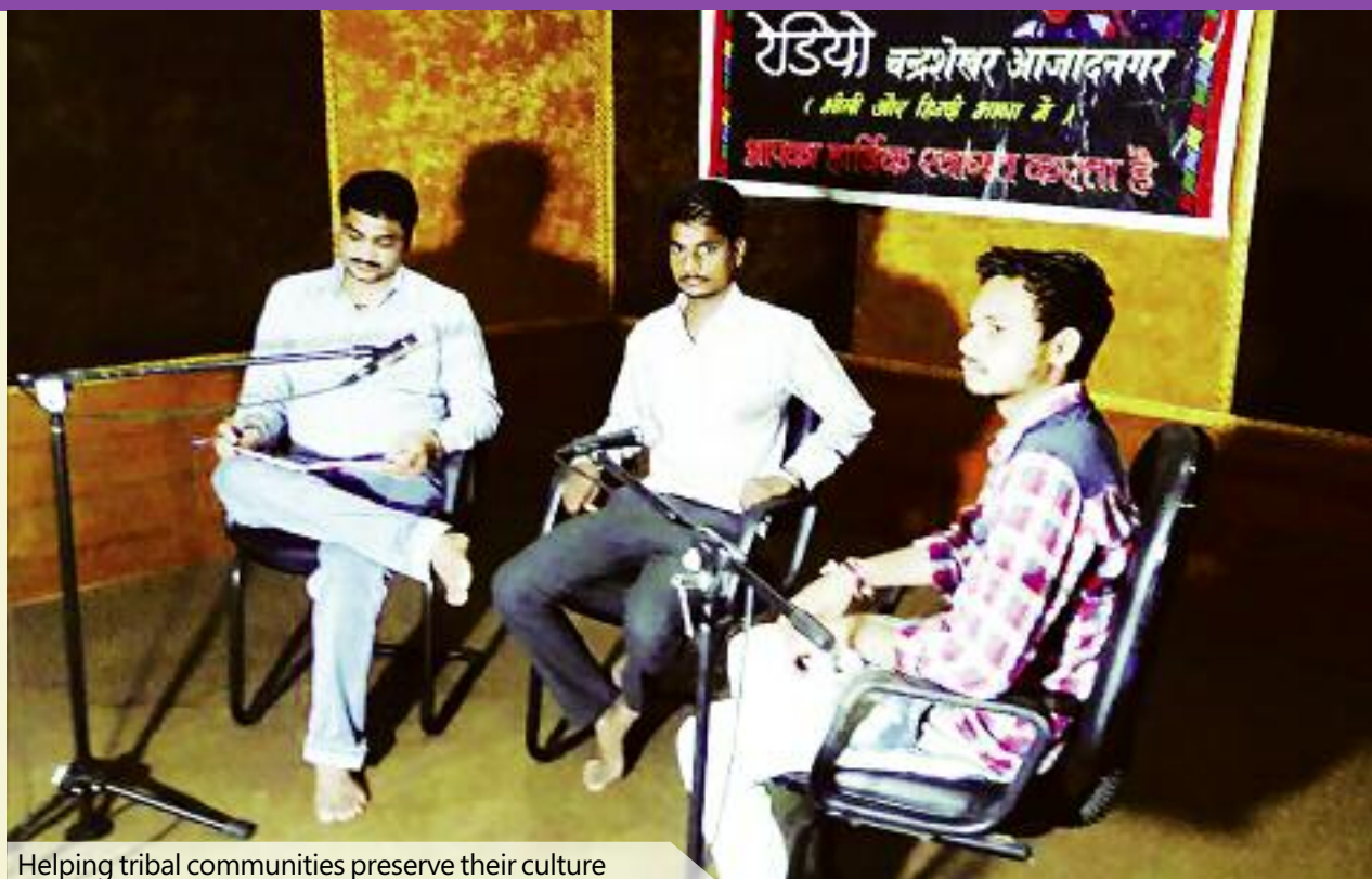
Helping tribal communities preserve their culture