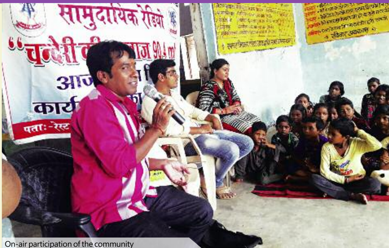
On-air participation of the community