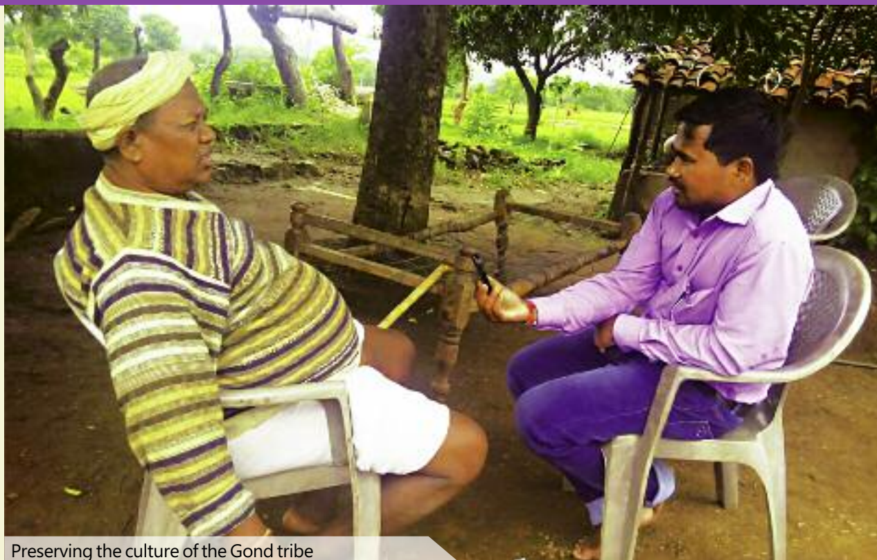
Preserving the culture of the Gond tribe

Broadcast Hours Languages 10 hours Gondi and Hindi