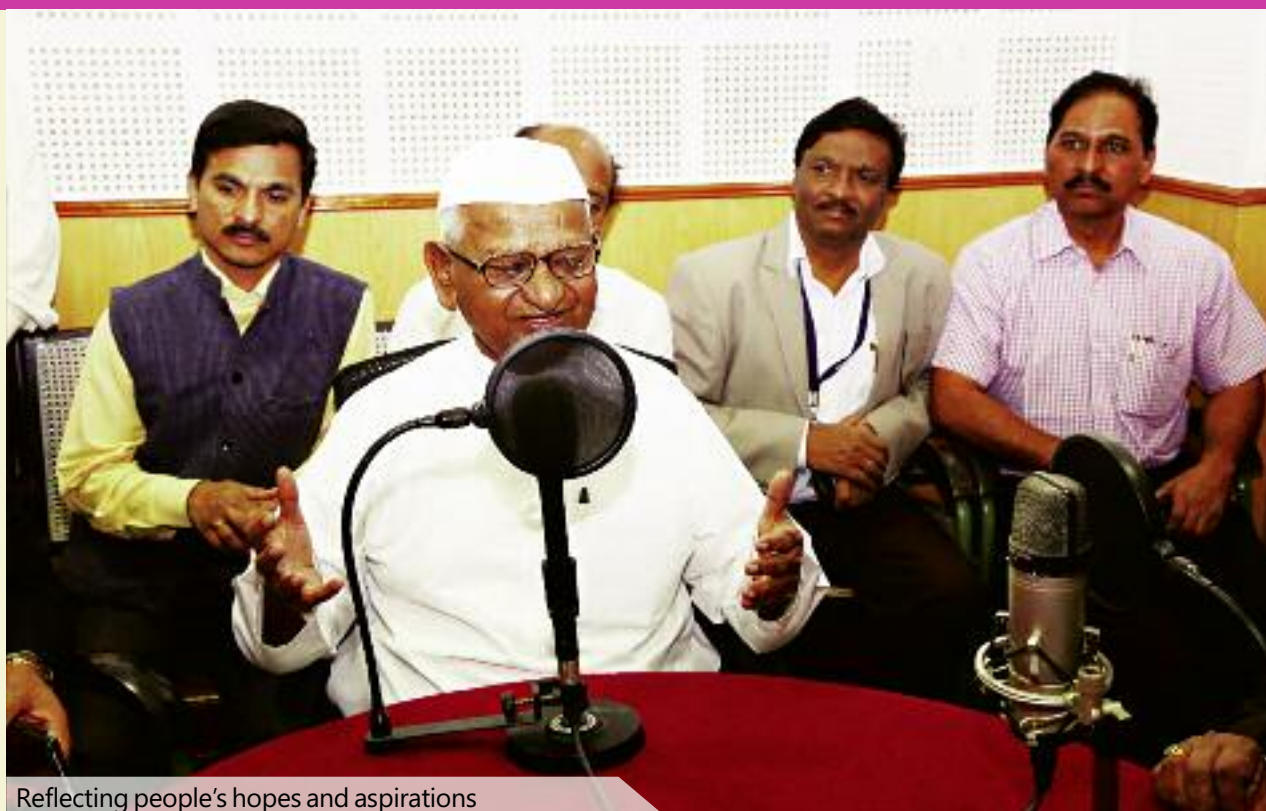
Reflecting people's hopes and aspirations