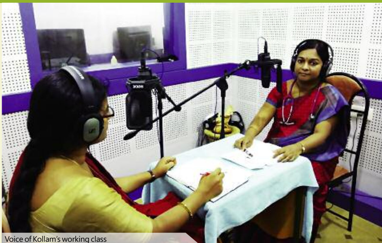
Voice of Kollam's working class