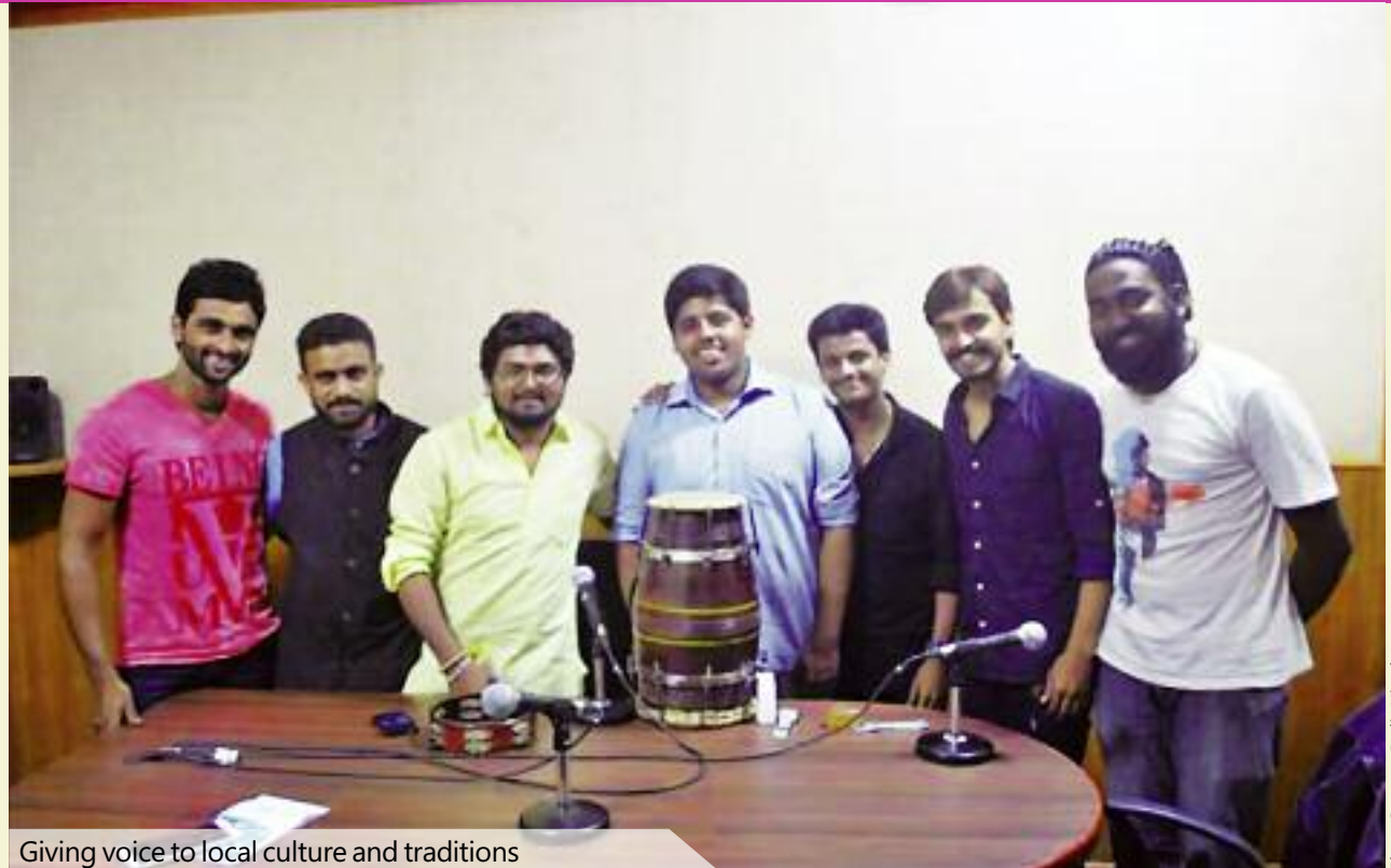
Giving voice to local culture and traditions

Broadcast Hours Languages 4 hours Kannada, Tulu and English.