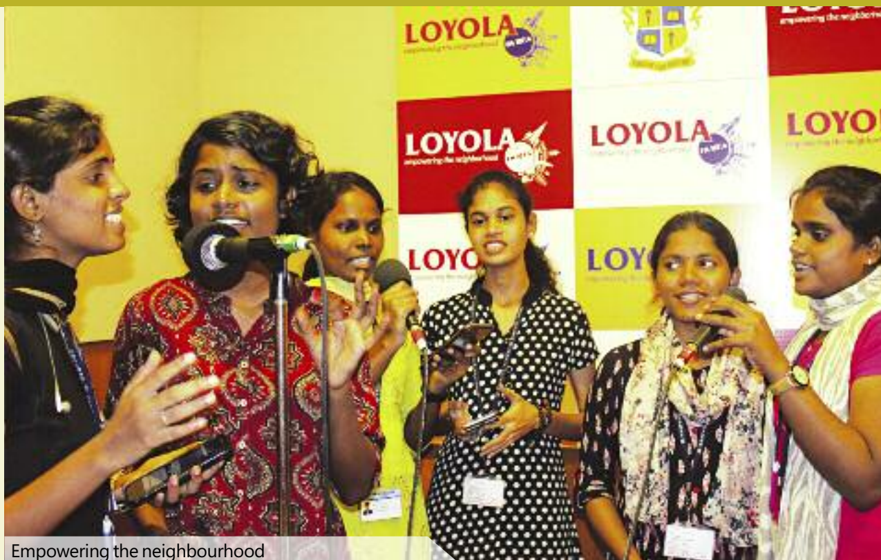
Empowering the neighbourhood