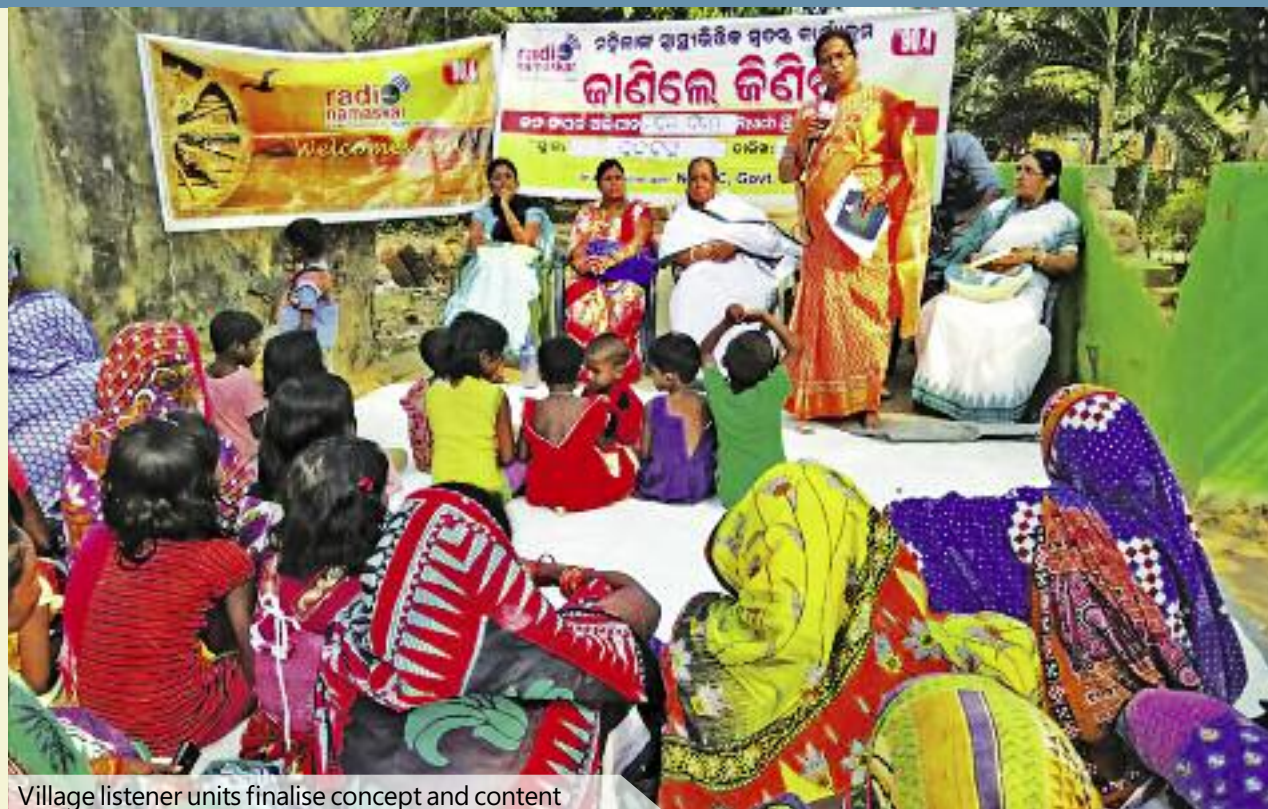
Village listener units finalise concept and content