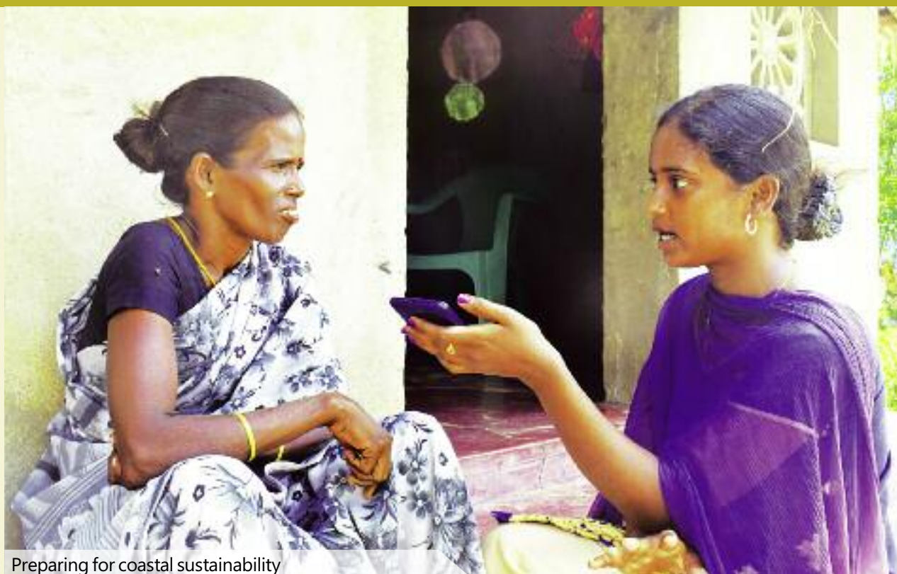
Preparing for coastal sustainability