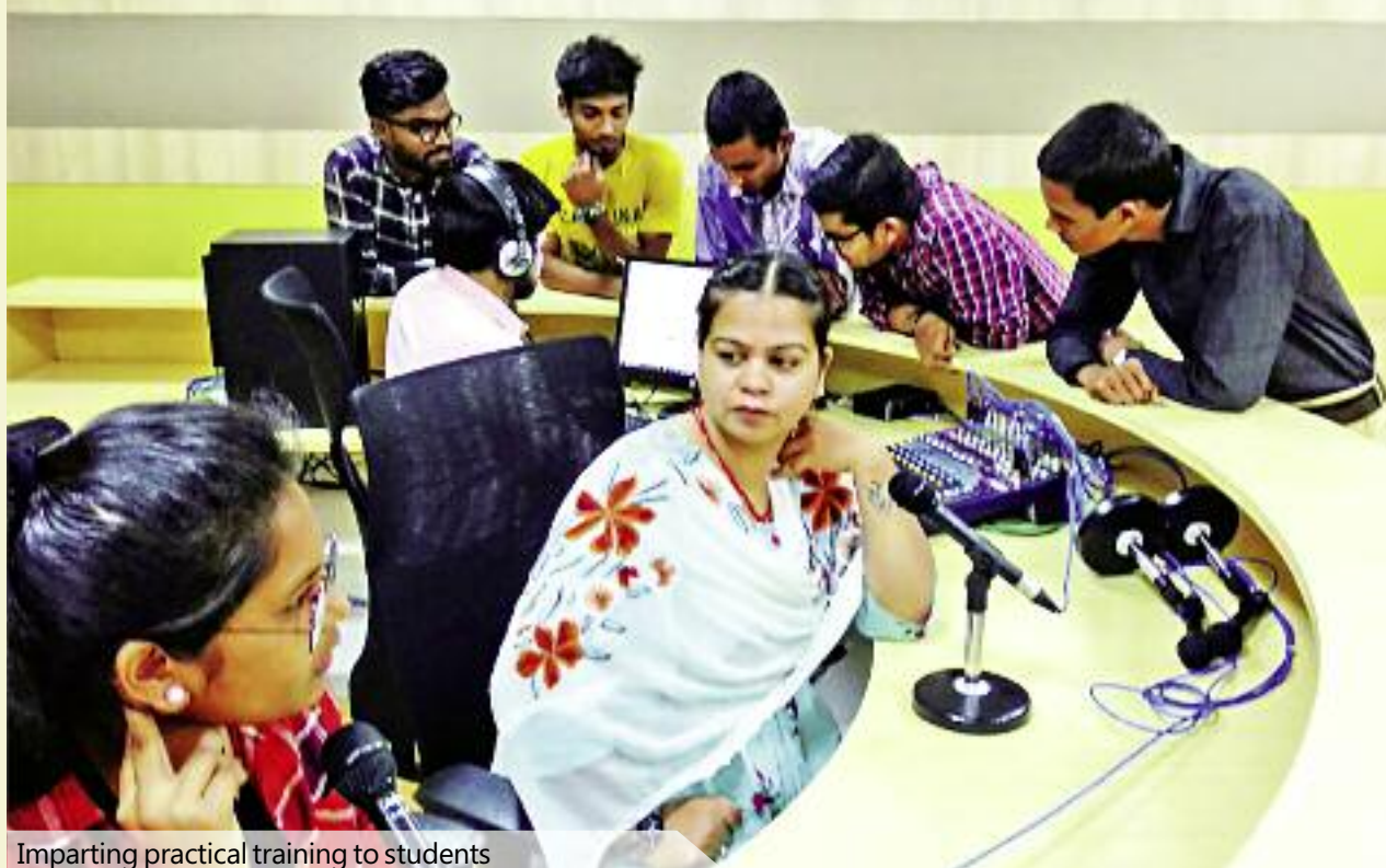
Imparting practical training to students

Languages Chhattisgarhi, Hindi and English