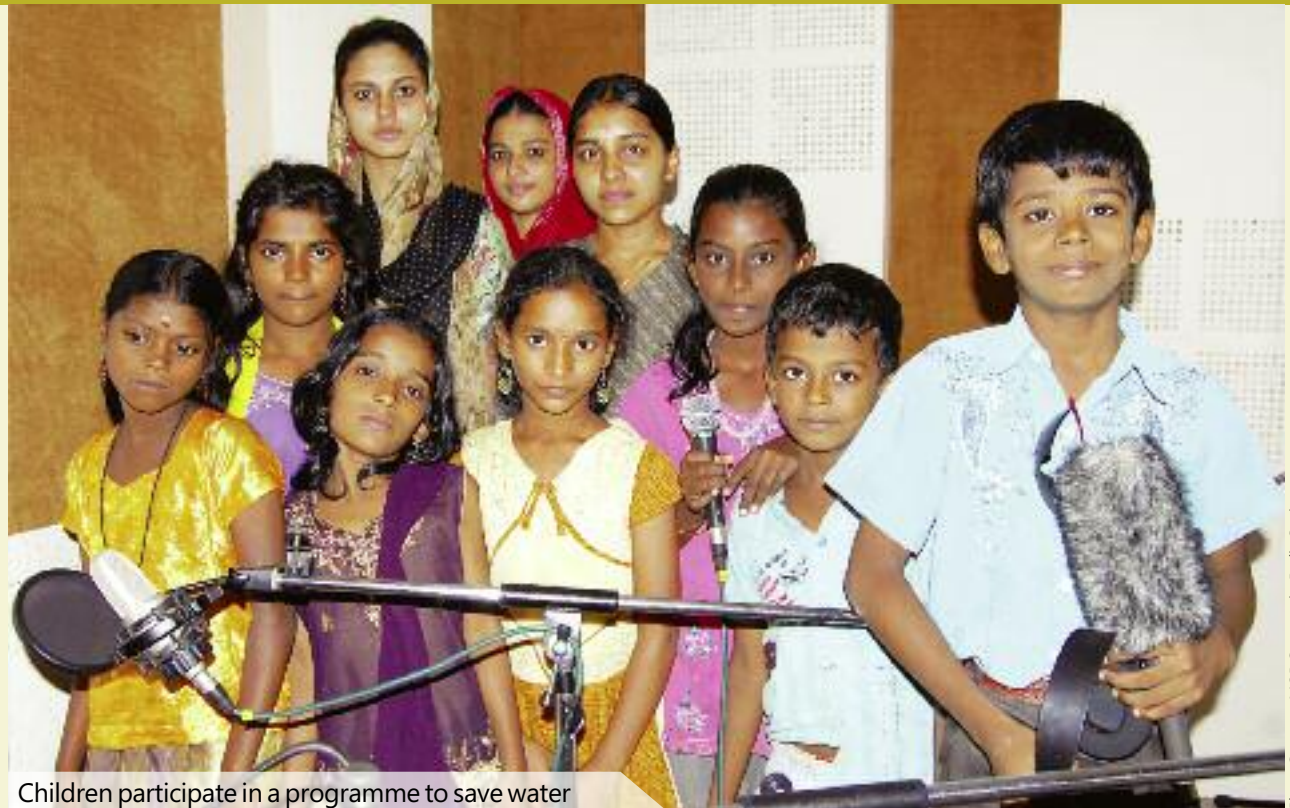
Children participate in a programme to save water