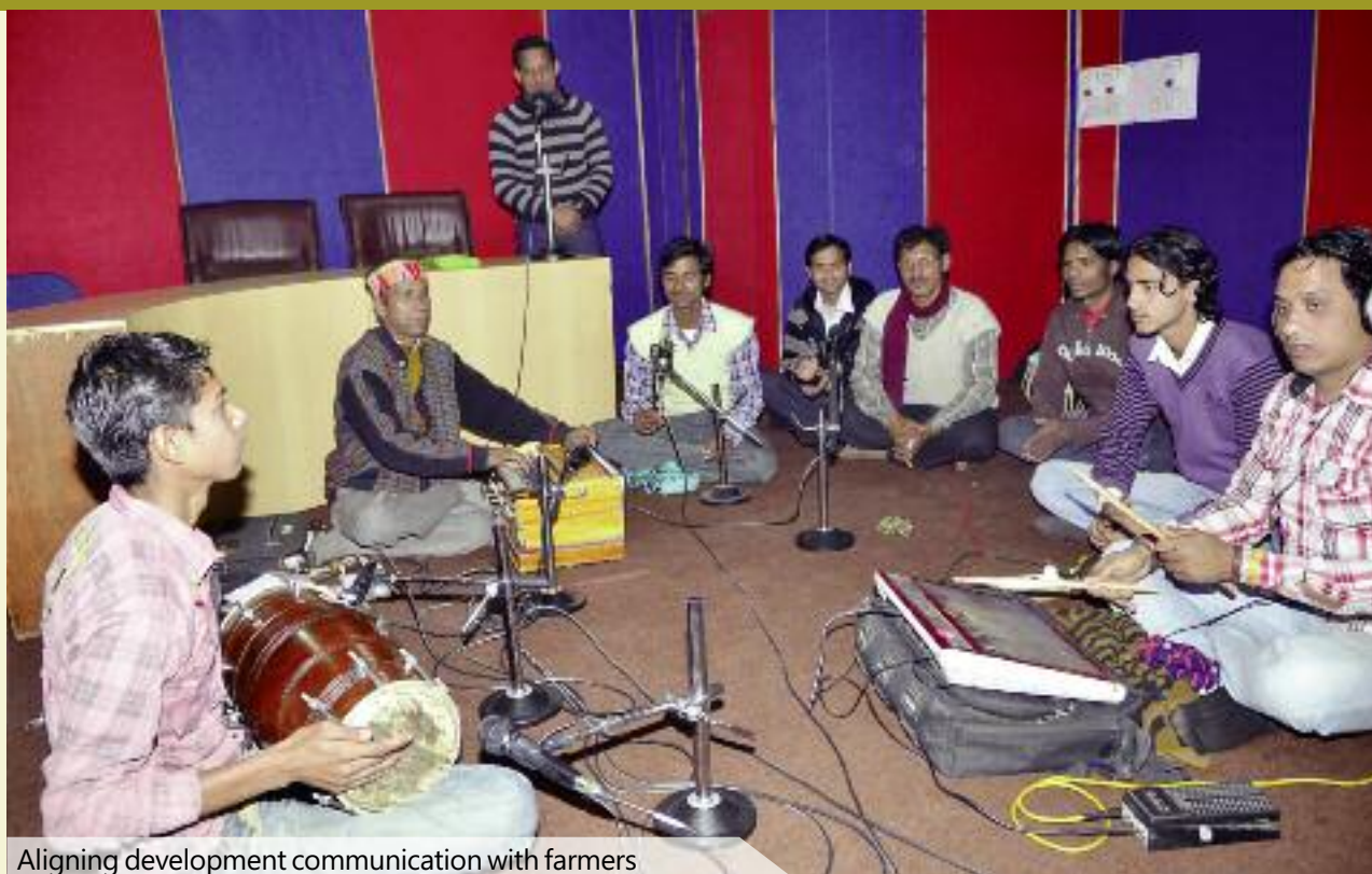
Aligning development communication with farmers

Languages Hindi, Kumauni, Garhwali, Bengali and Panjabi