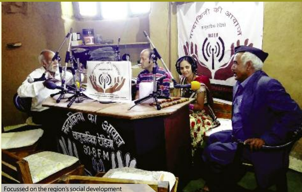
Focussed on the region's social development