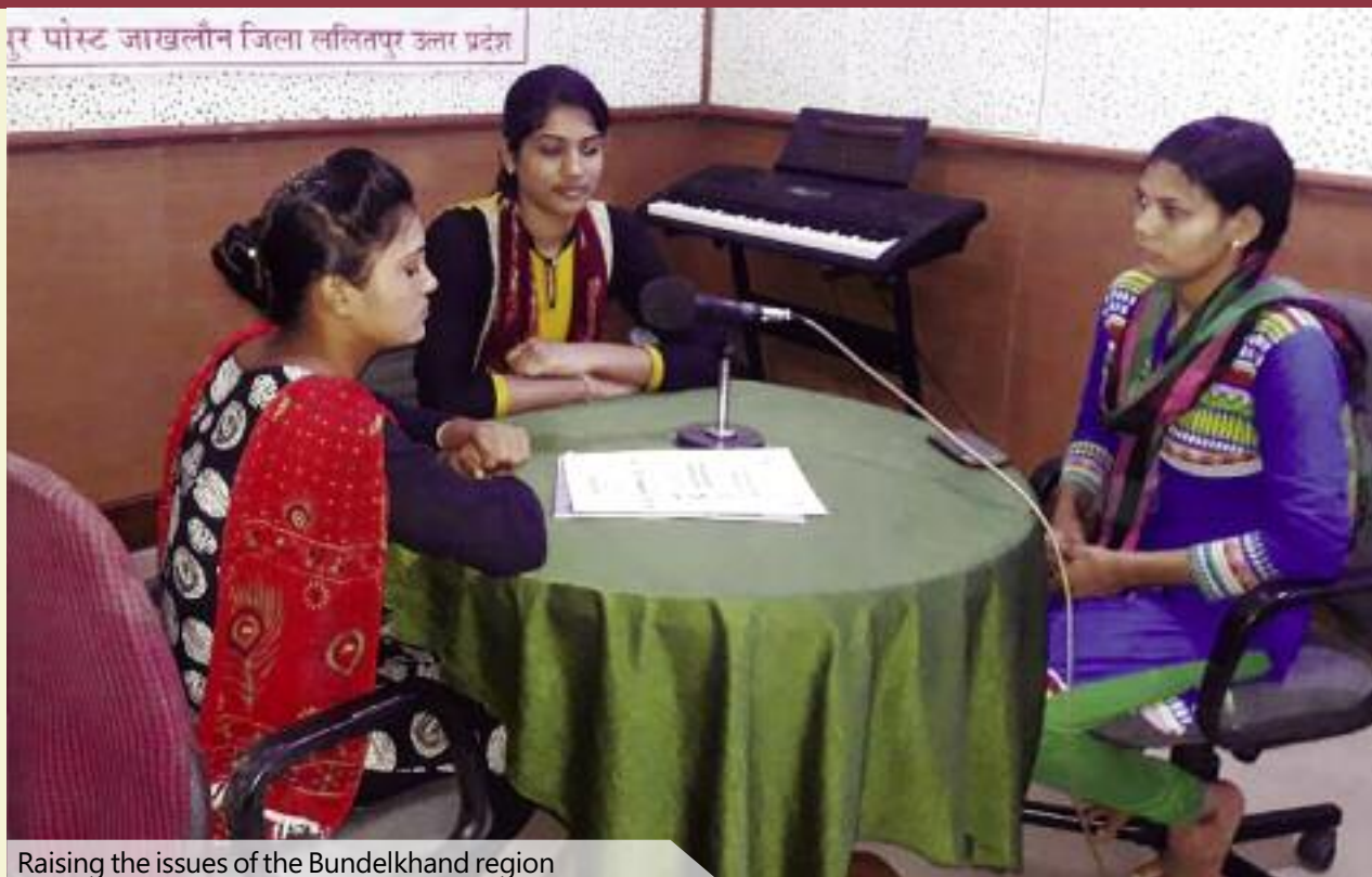
Raising the issues of the Bundelkhand region