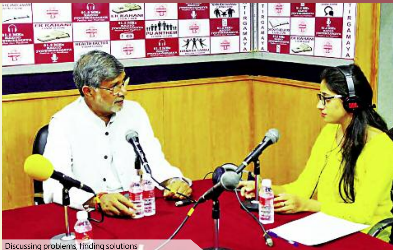
Discussing problems, finding solutions