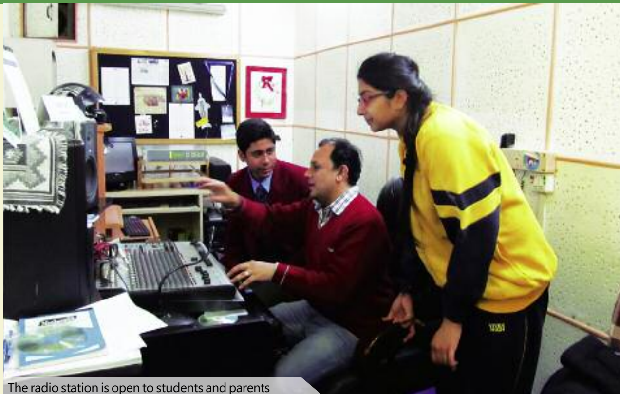
The radio station is open to students and parents