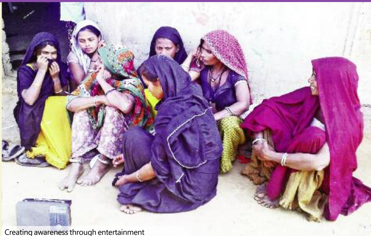
Creating awareness through entertainment