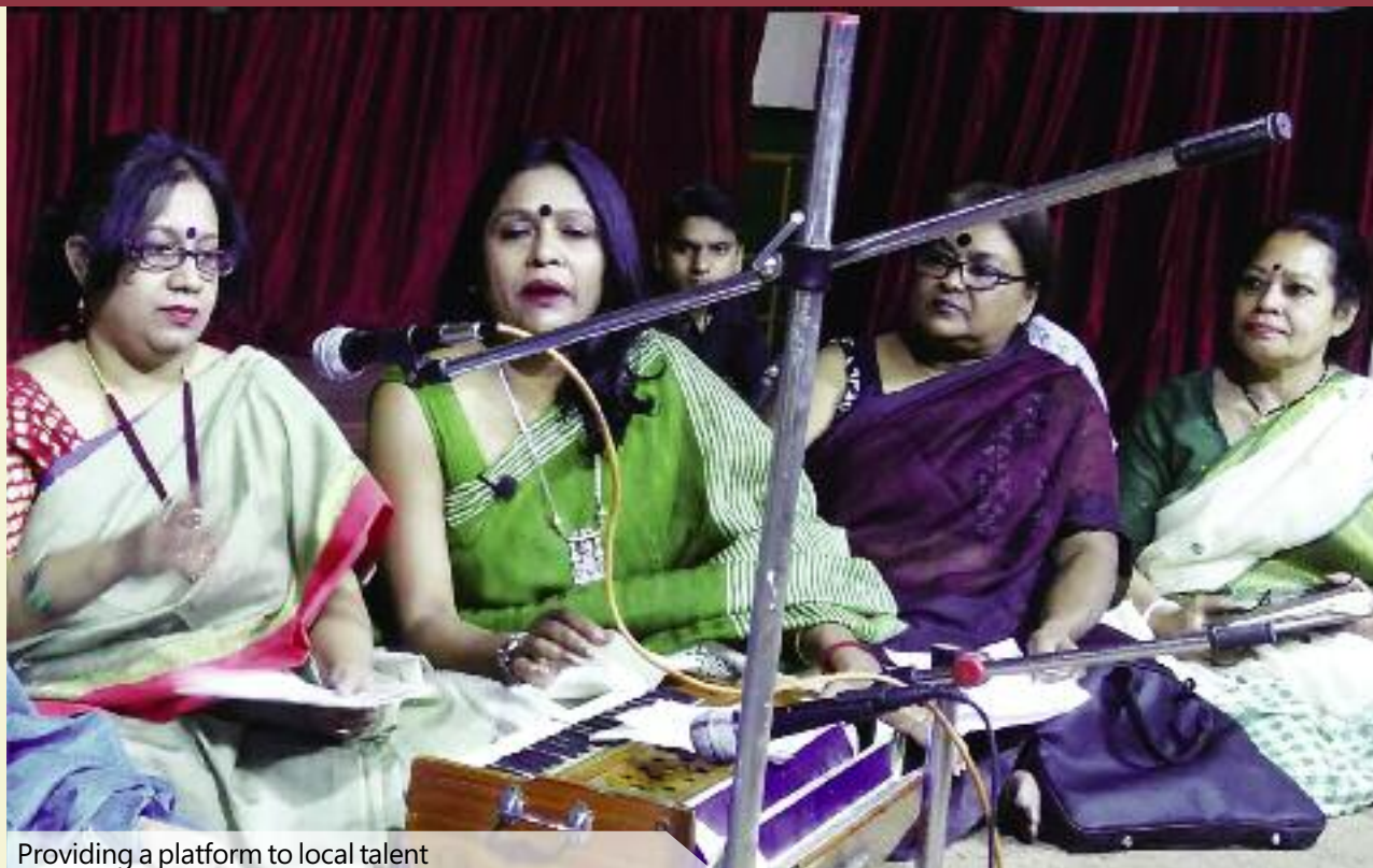
Providing a platform to local talent