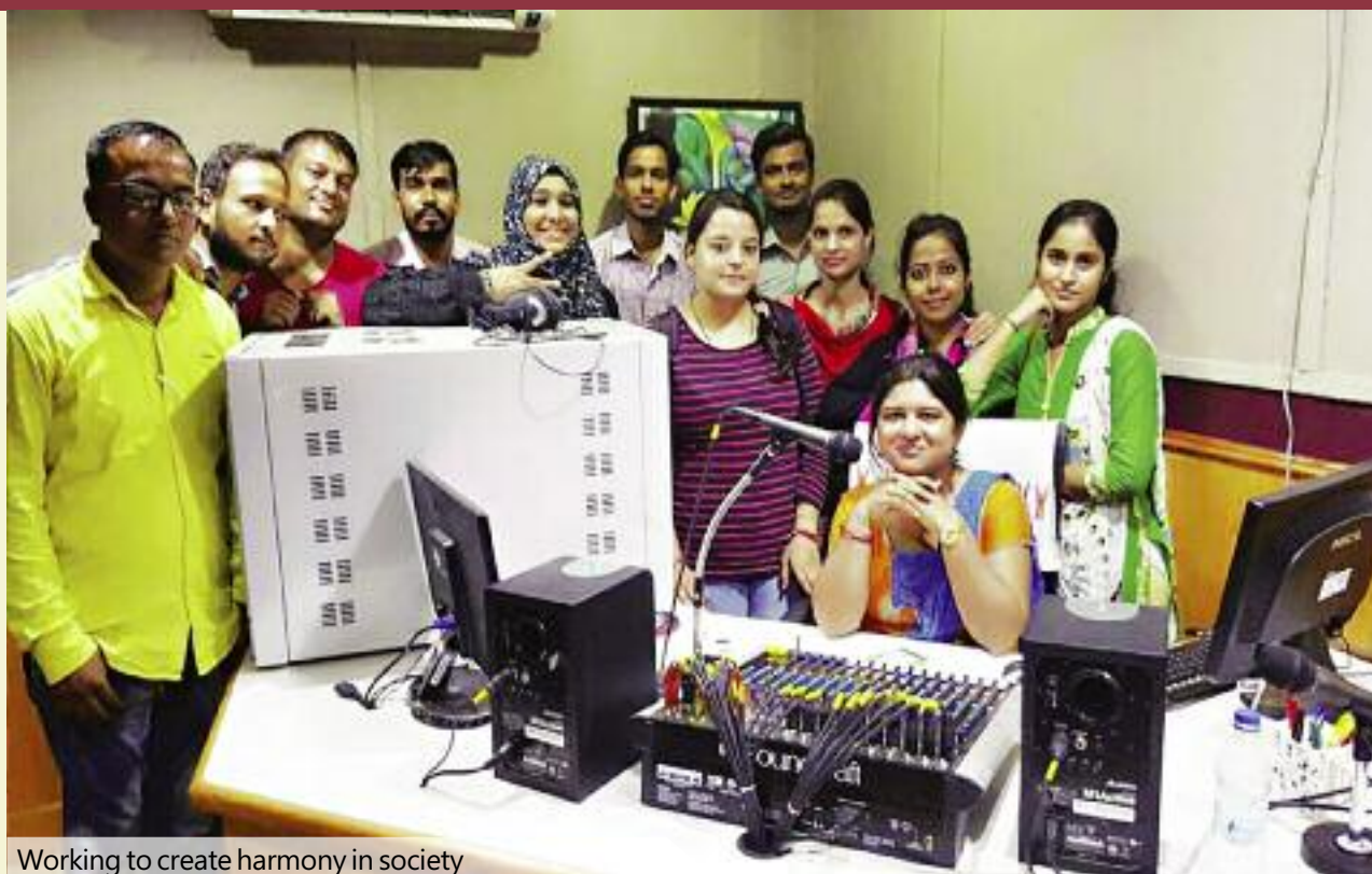
Working to create harmony in society