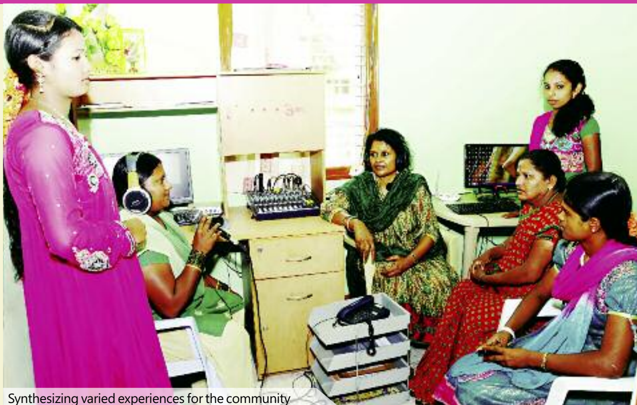
Synthesizing varied experiences for the community