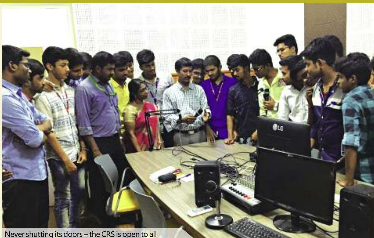
Never shutting its doors – the CRS is open to all