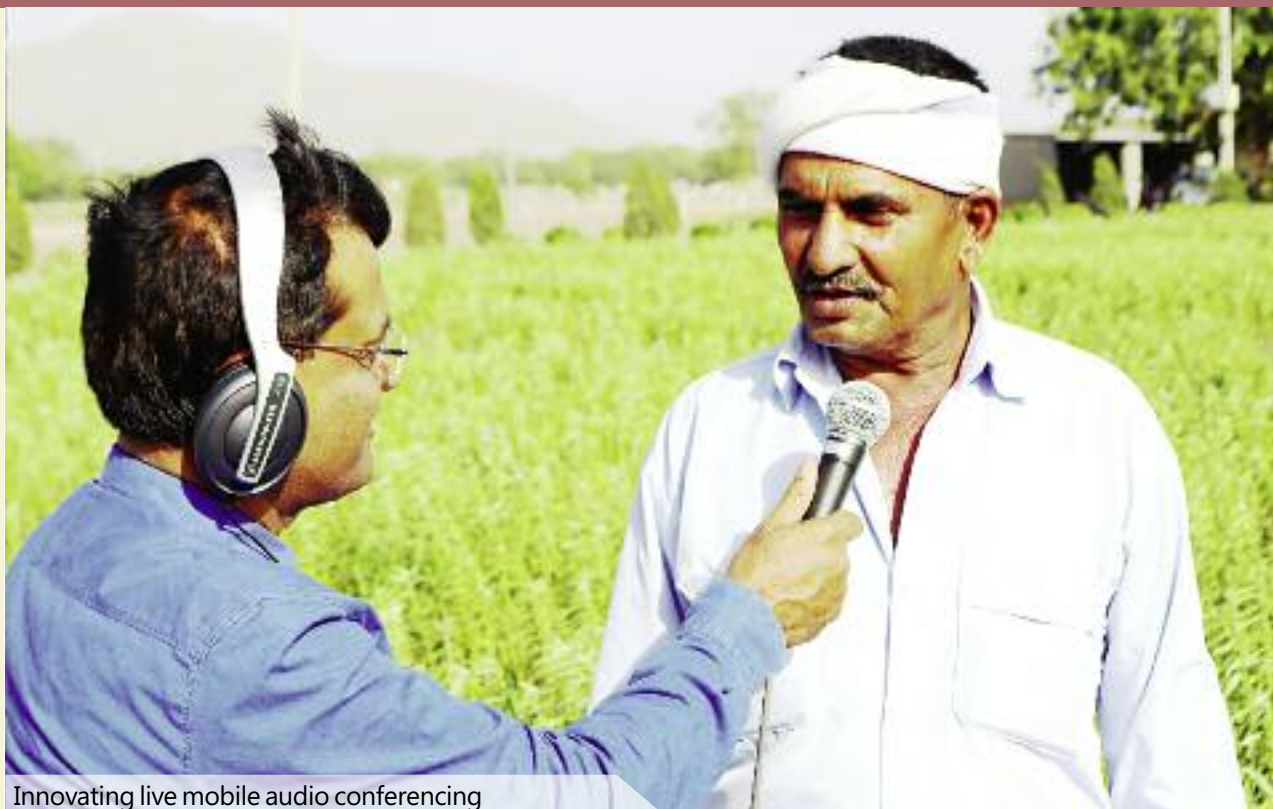
Innovating live mobile audio conferencing