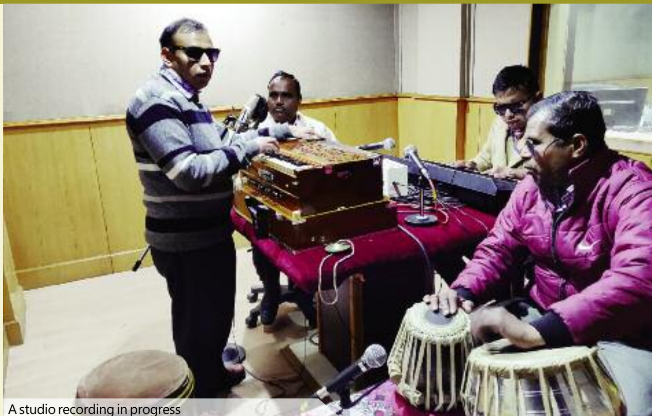
A studio recording in progress