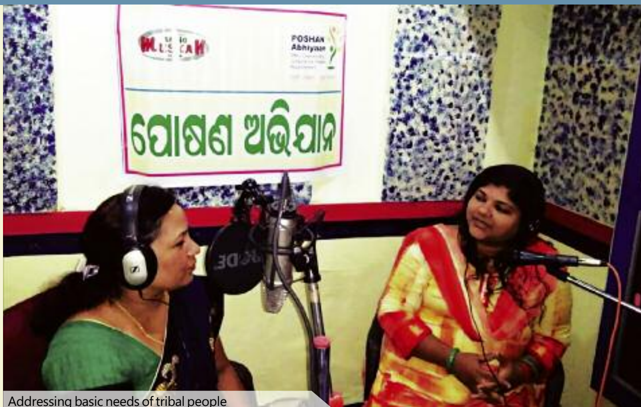
Addressing basic needs of tribal people