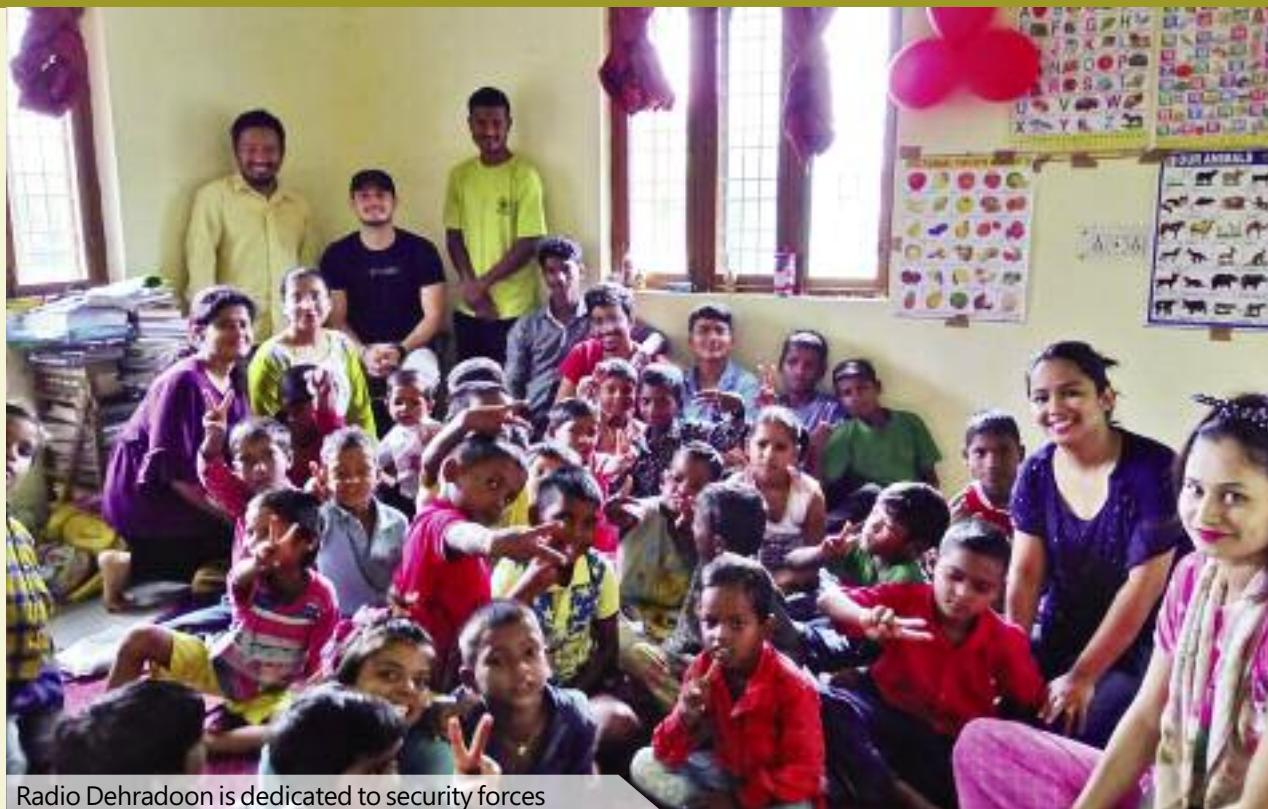
Radio Dehradun is dedicated to security forces