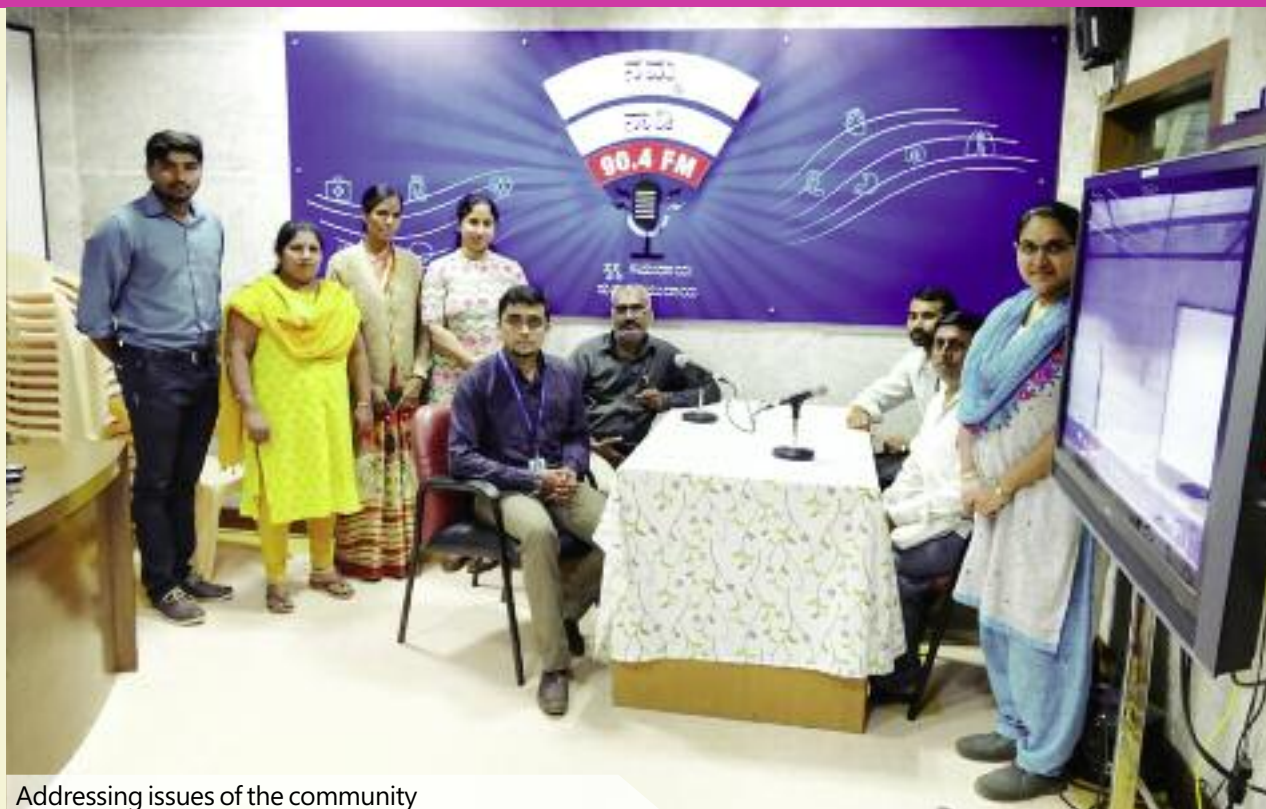
Addressing issues of the community