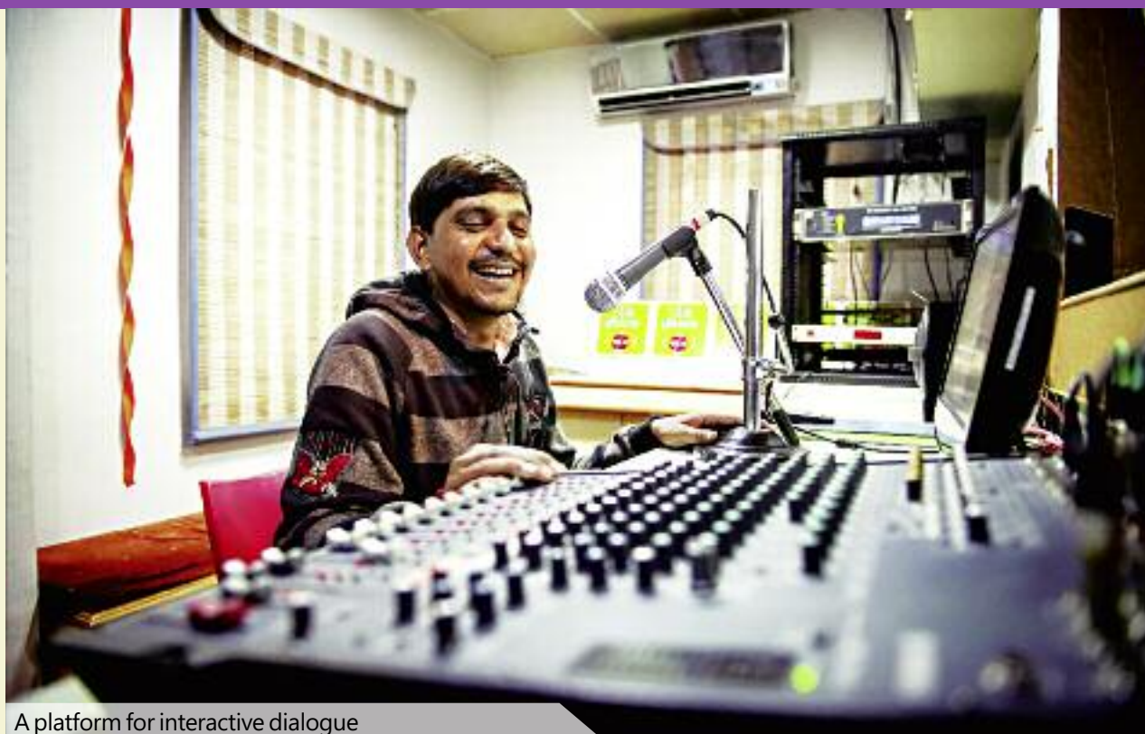
A platform for interactive dialogue