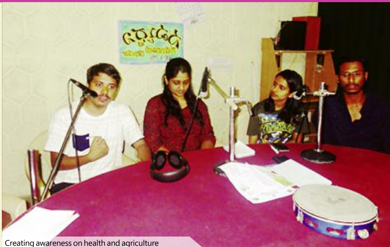
Creating awareness on health and agriculture